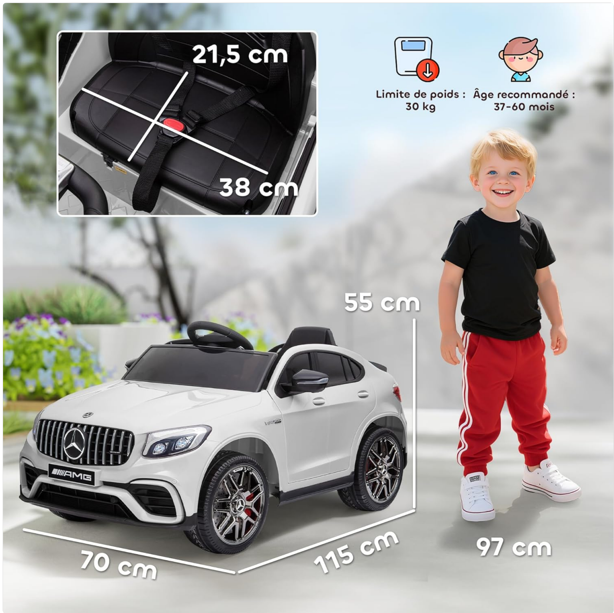
Figure 9.1: Visual representation of the car's dimensions, seat size, weight limit, and recommended age range.