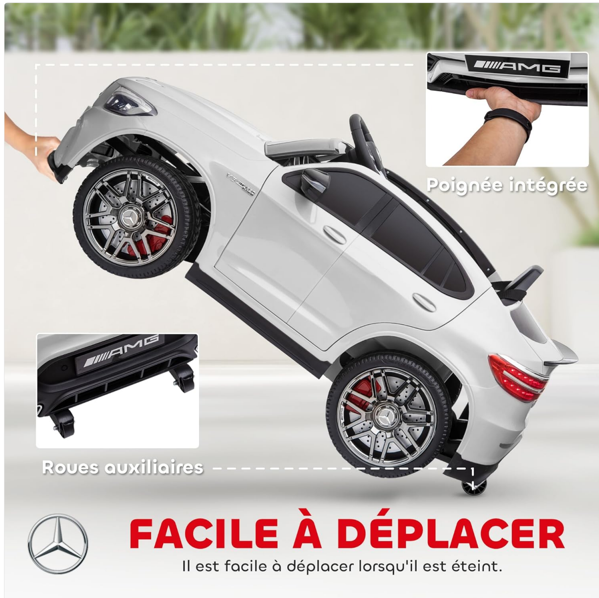
Figure 7.1: The integrated handle and auxiliary wheels facilitate easy movement of the car when it is powered off, aiding in storage and transport.