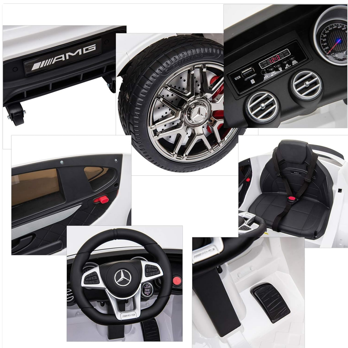
Figure 4.1: Detailed view of various components of the ride-on car, including the wheel, dashboard, seat, and pedal, which require assembly and proper connection.

Assembly of the HOMCOM Mercedes GLC AMG Electric Ride-On Car is required. Follow the detailed instructions provided in the included manual for step-by-step assembly. Ensure all connections are secure and all screws are tightened before allowing a child to use the vehicle.