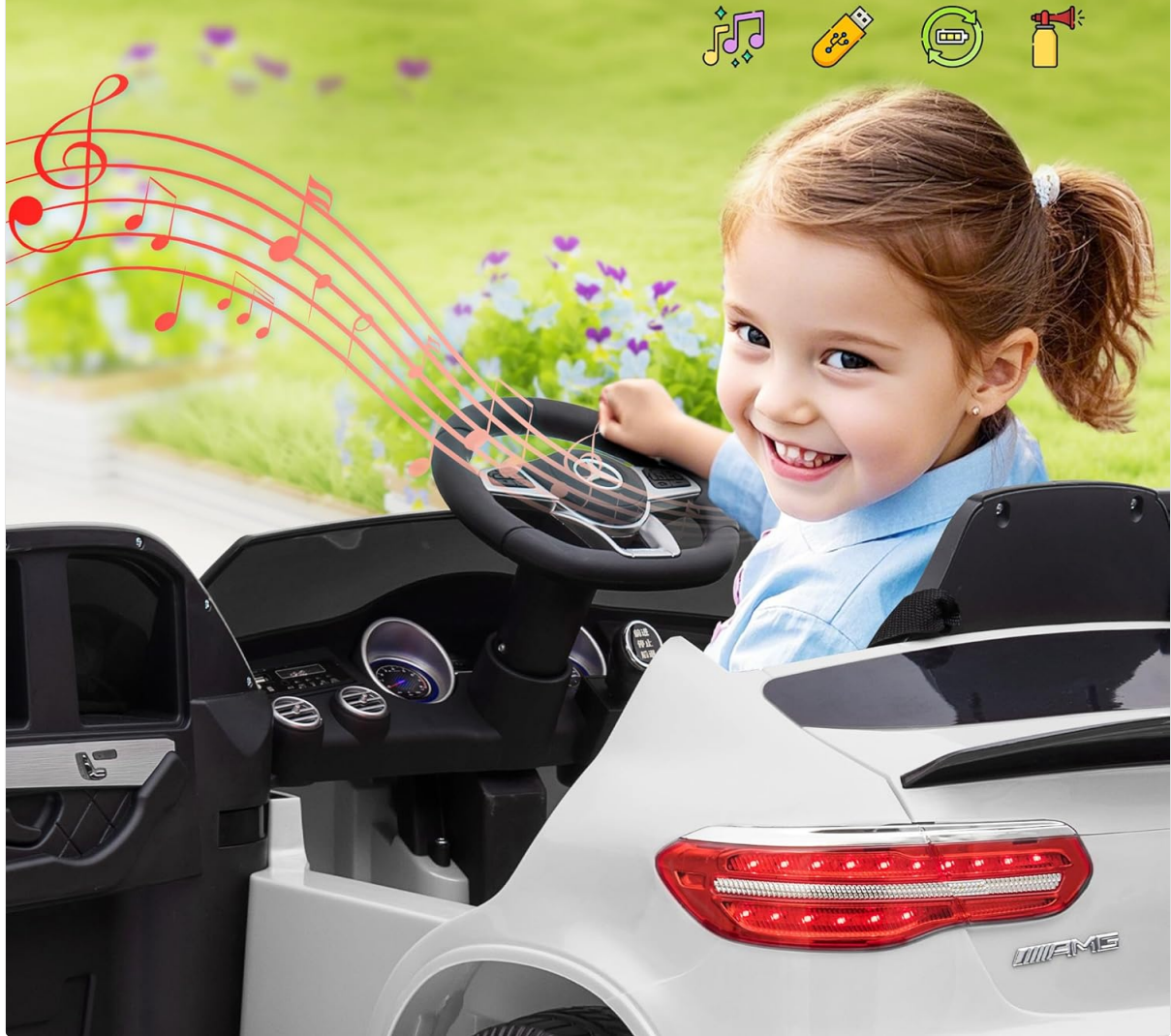
Figure 5.2: The dashboard and steering wheel area, highlighting the multimedia and sound features available for the child's enjoyment.