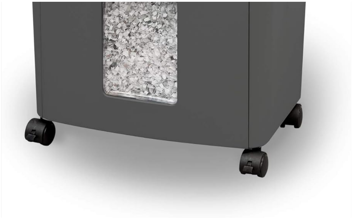
Image: Front-angle view of the Boxis AF70 shredder, showing paper loaded into the auto-feed tray and the transparent window revealing shredded paper in the bin.