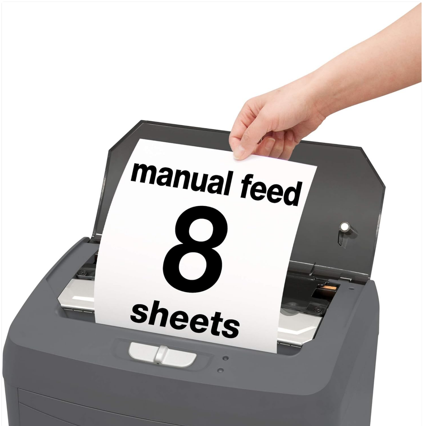
Image: Close-up view of the manual feed slot, demonstrating how to insert paper for manual shredding, with an indication of its 8-sheet capacity.