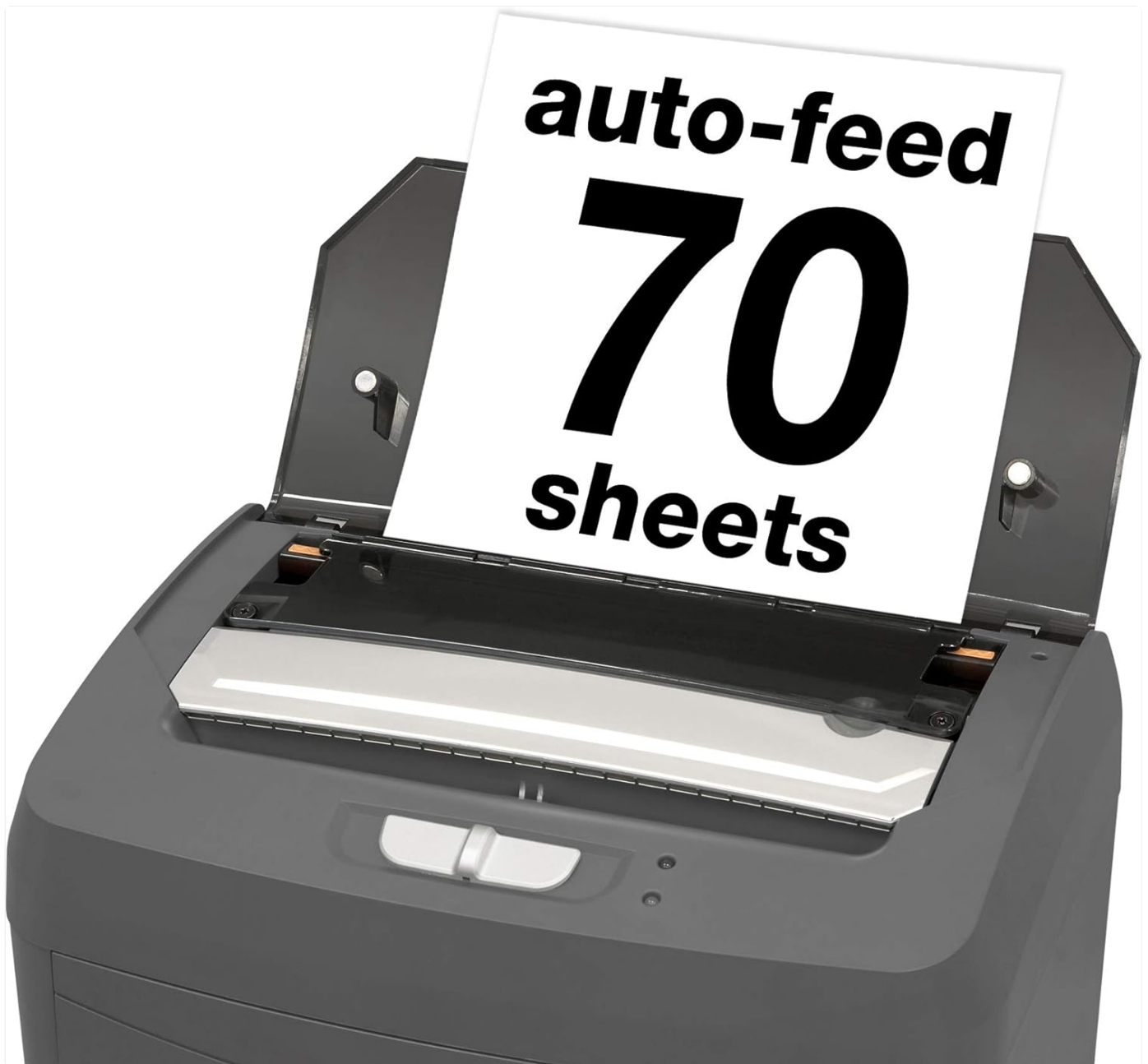
Image: Close-up view of the auto-feed tray with a stack of paper, indicating its 70-sheet capacity for automatic shredding.