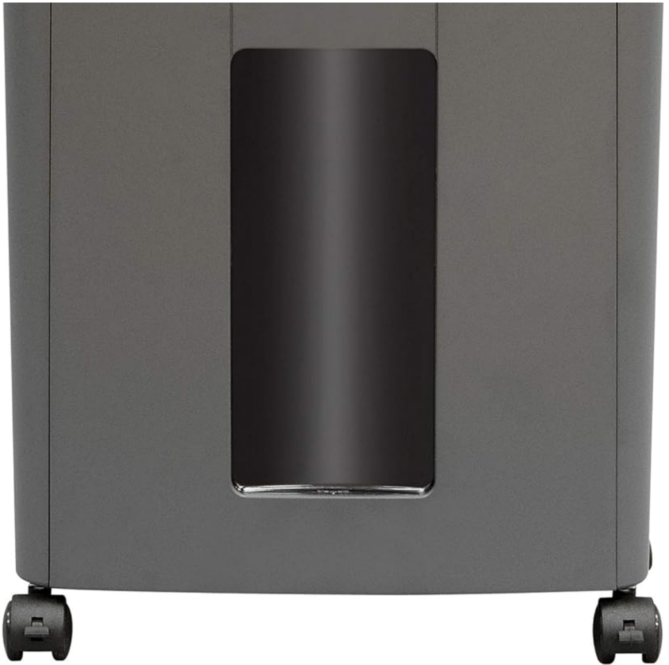
Image: Direct front view of the Boxis AF70 shredder, highlighting the control panel and the waste bin window.