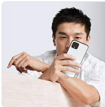
Figure 3.3: Motion Sense in Action

Utilize Quick Gestures to control your phone without touching it. Wave your hand above the screen to skip songs, silence calls, and more. Motion Sense functionality is available in specific regions including the US, Canada, Singapore, Australia, Taiwan, and most European countries.