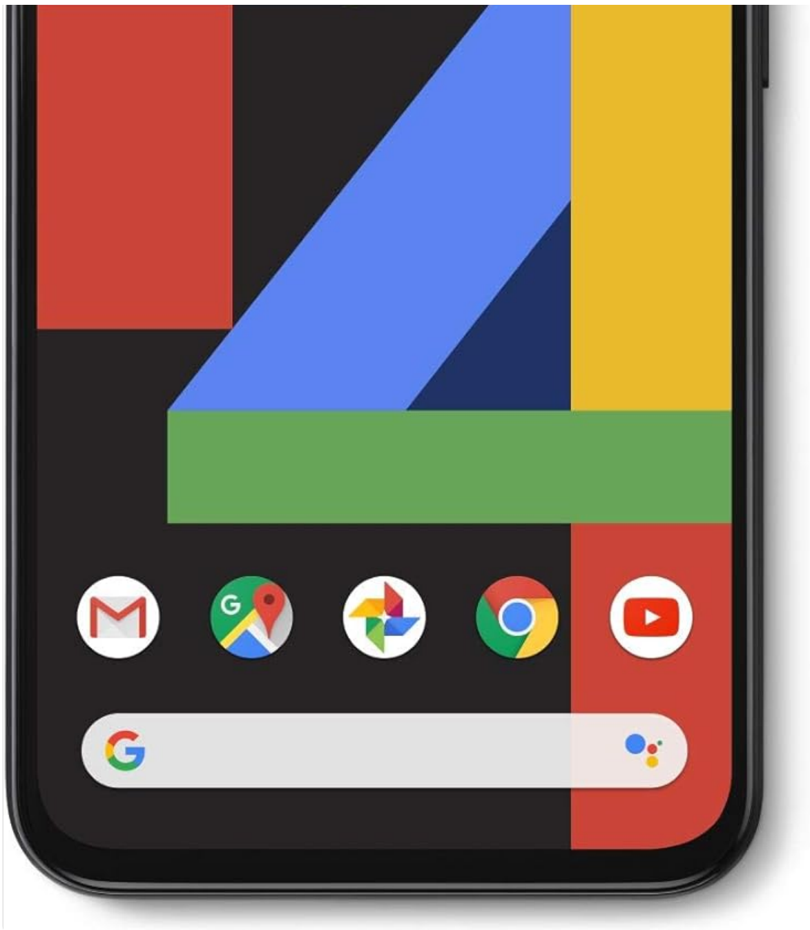
Figure 1.1: Google Pixel 4 XL (Oh So Orange)