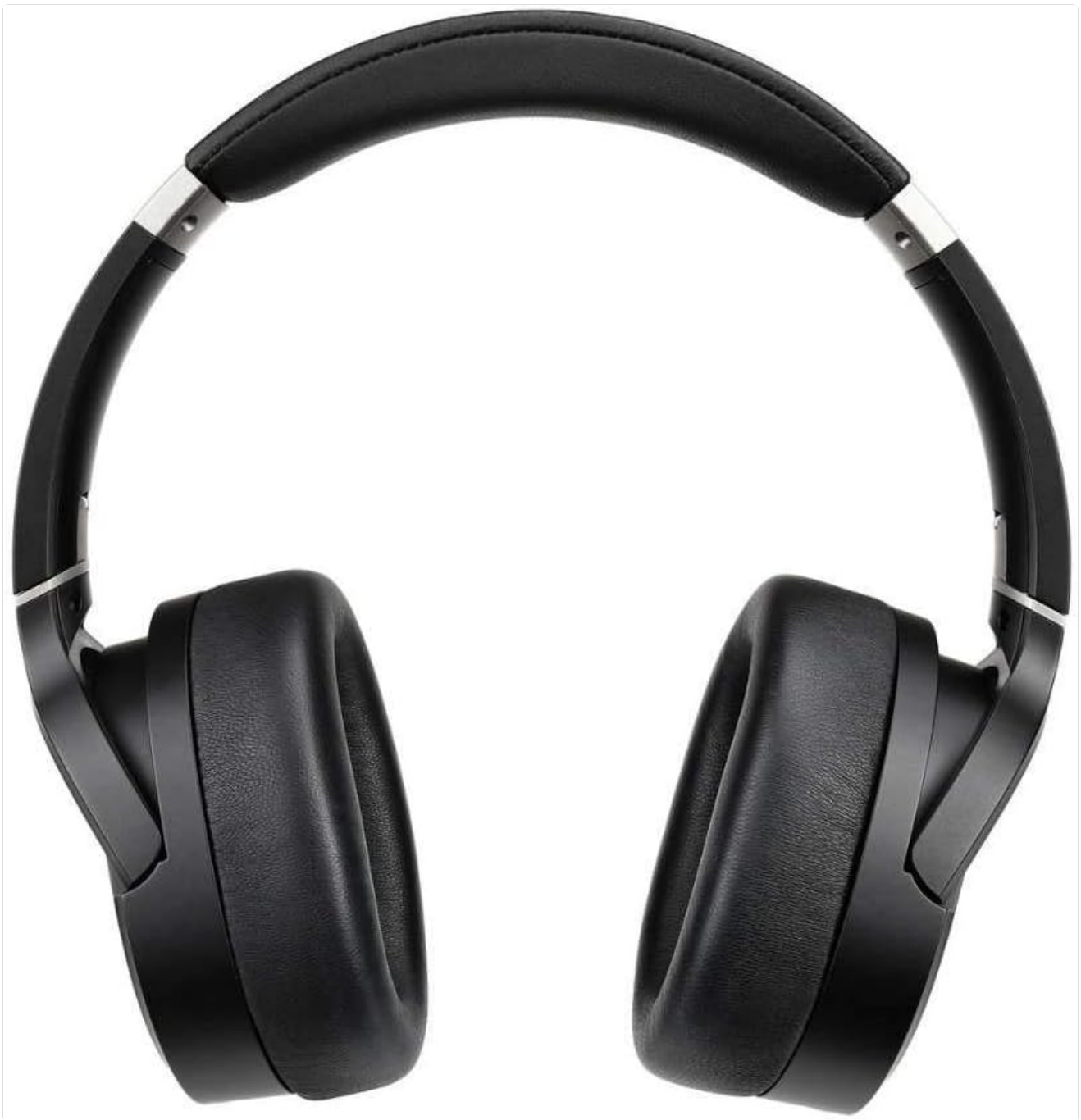
Figure 4.2: Top view of the Audeze LCD-1 headphones, highlighting the adjustable headband and earcups.