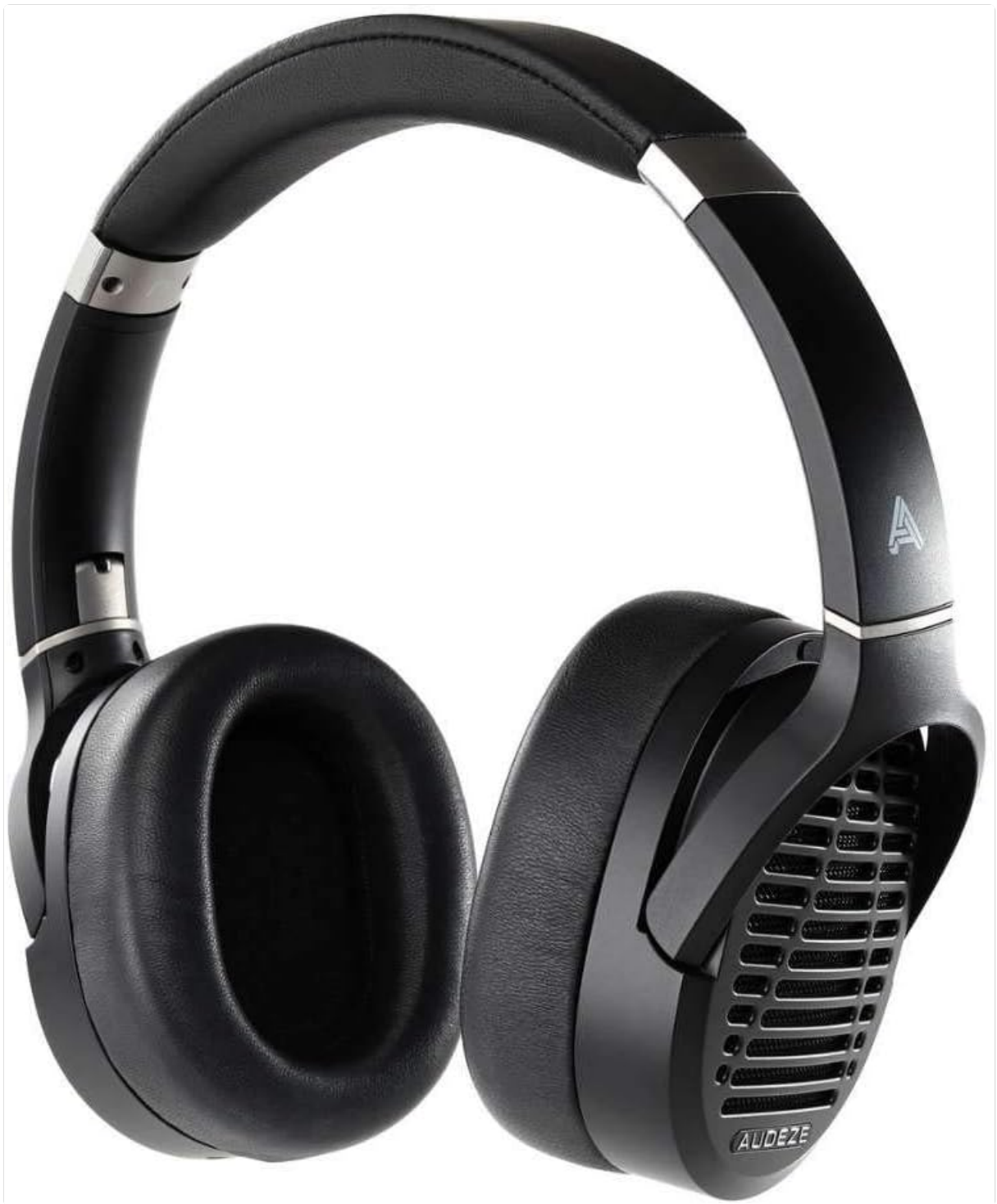
Figure 4.1: Front view of the Audeze LCD-1 headphones, showcasing the open-back design and comfortable earcups.