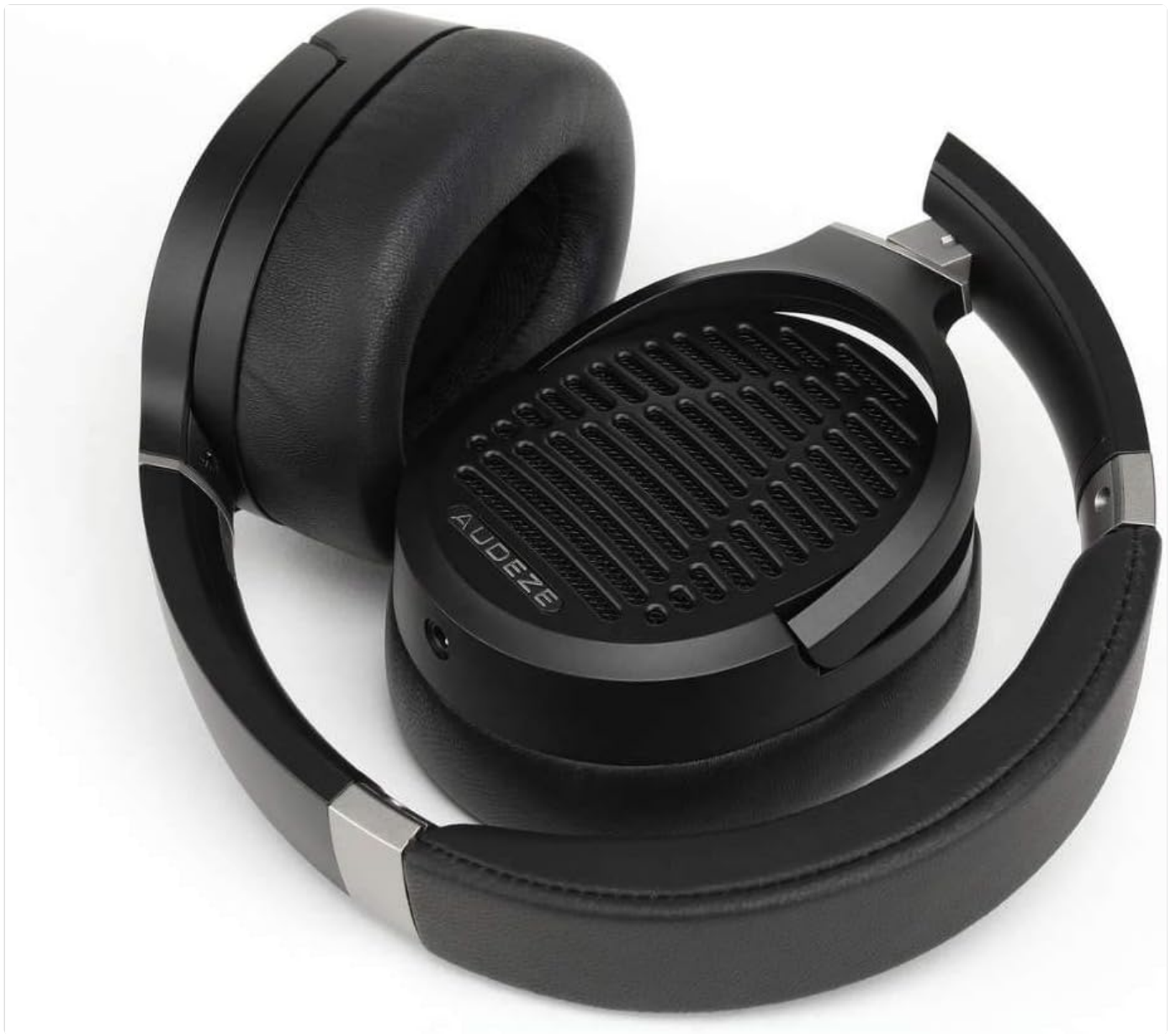
Figure 4.3: The Audeze LCD-1 headphones folded, demonstrating their compact design for easy portability and storage.