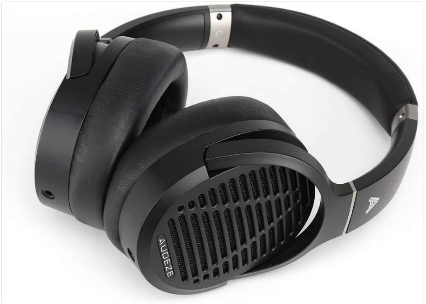
Figure 4.4: Angled view of the Audeze LCD-1 headphones in their folded state, ready to be placed in the protective case.