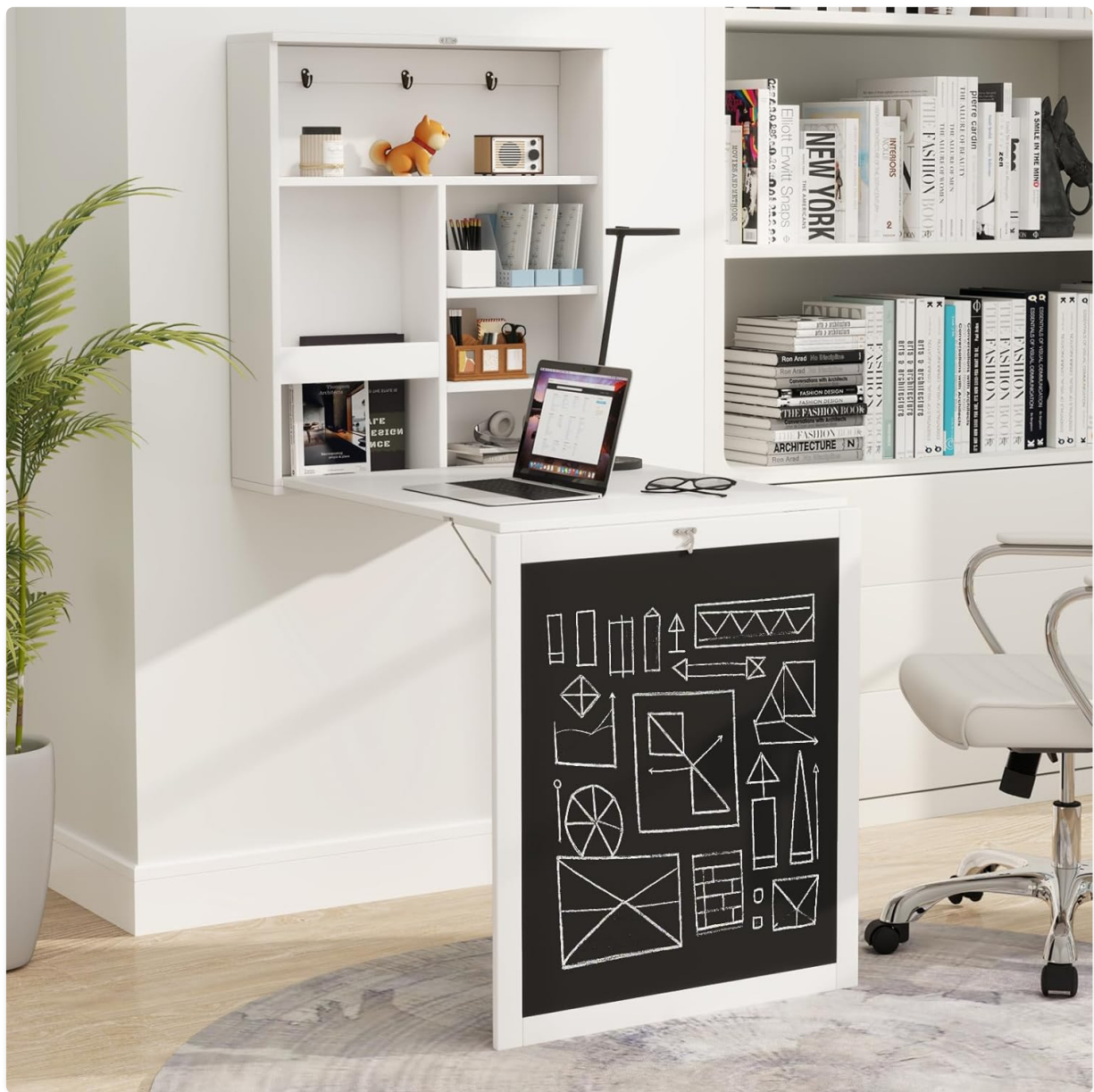
Figure 1: Tangkula Wall Mounted Fold-Out Desk in open configuration.