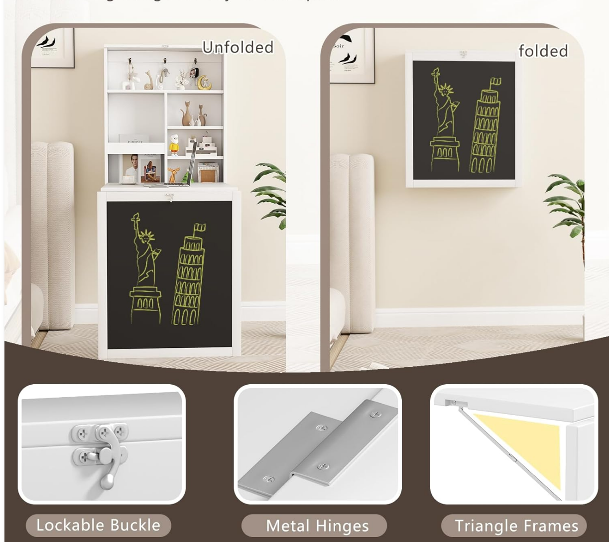
Figure 4: Hidden Storage Space and Spacious Tabletop.

Swift folding design for any narrow space