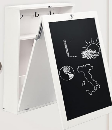
Figure 3: Wall-Mounted Structure Details (Lockable Buckle, Metal Hinges, Triangle Frames).