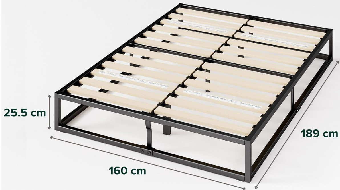
Image 7.1: Detailed dimensions of the Zinus Joseph Metal Platform Bed Frame.