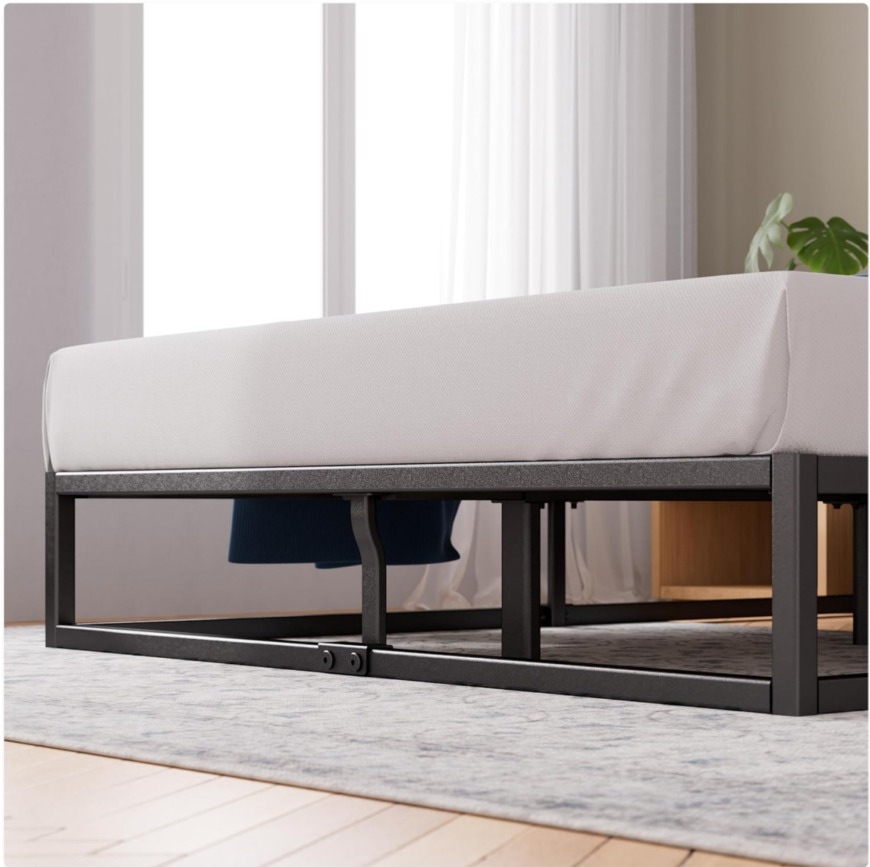
Image 4.1: The 25 cm height provides convenient under-bed storage options.