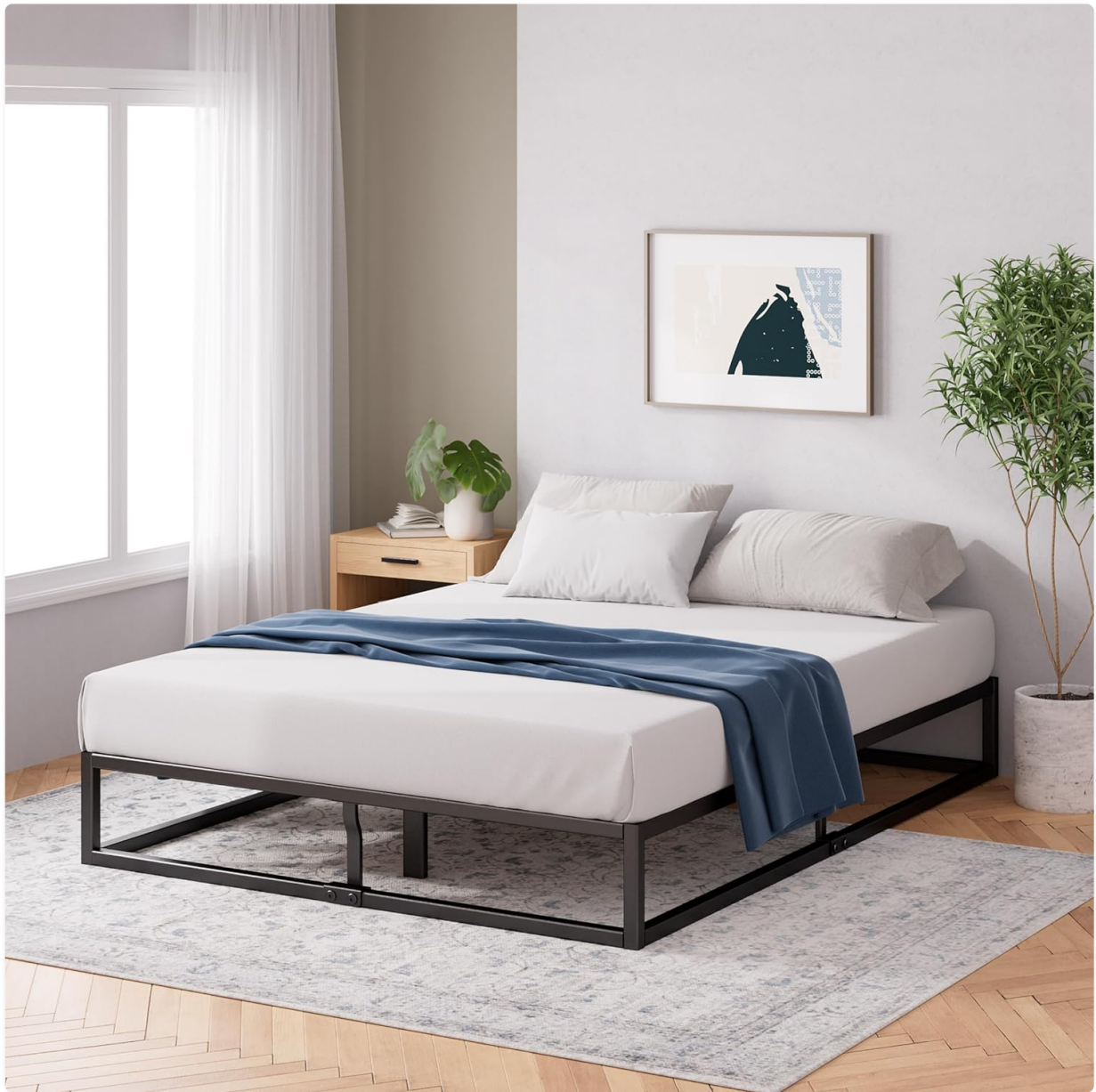
Image 1.1: The Zinus Joseph Metal Platform Bed Frame, shown with a mattress and bedding in a modern bedroom environment.