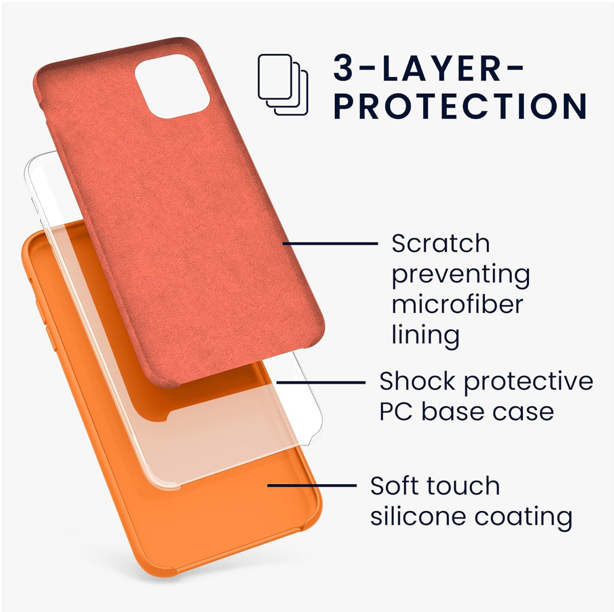
Image: A diagram illustrating the three protective layers of the case: a scratch-preventing microfiber lining, a shock-protective PC base case, and a soft-touch silicone coating.