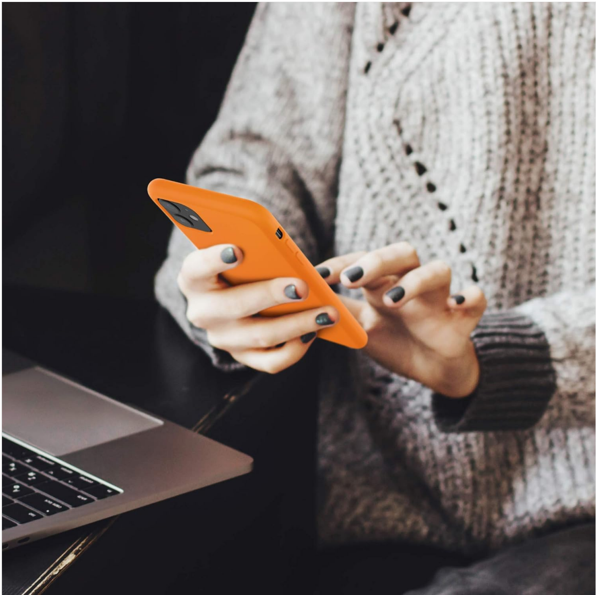
Image: A person holding an iPhone 11 with the kwmobile case, illustrating the comfortable and secure grip.