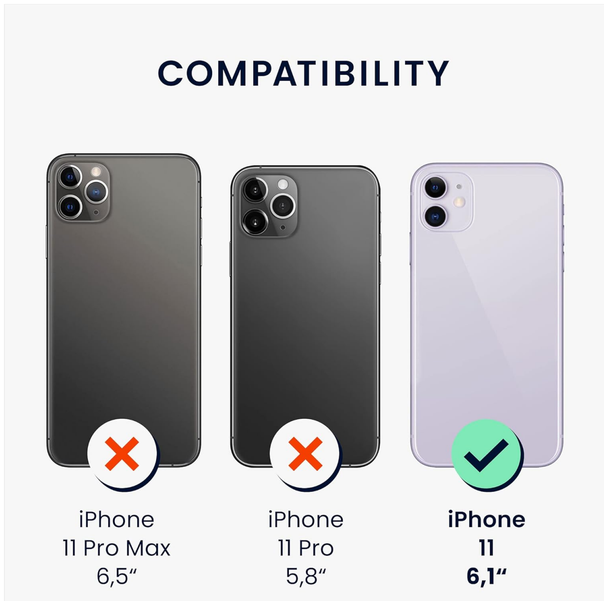
Image: A visual guide indicating compatibility with the iPhone 11 (6.1 inches) and incompatibility with iPhone 11 Pro Max (6.5 inches) and iPhone 11 Pro (5.8 inches).