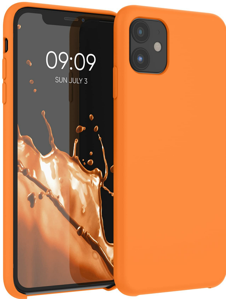
Image: The kwmobile TPU Silicone Case in Fruity Orange, fitted onto an Apple iPhone 11.