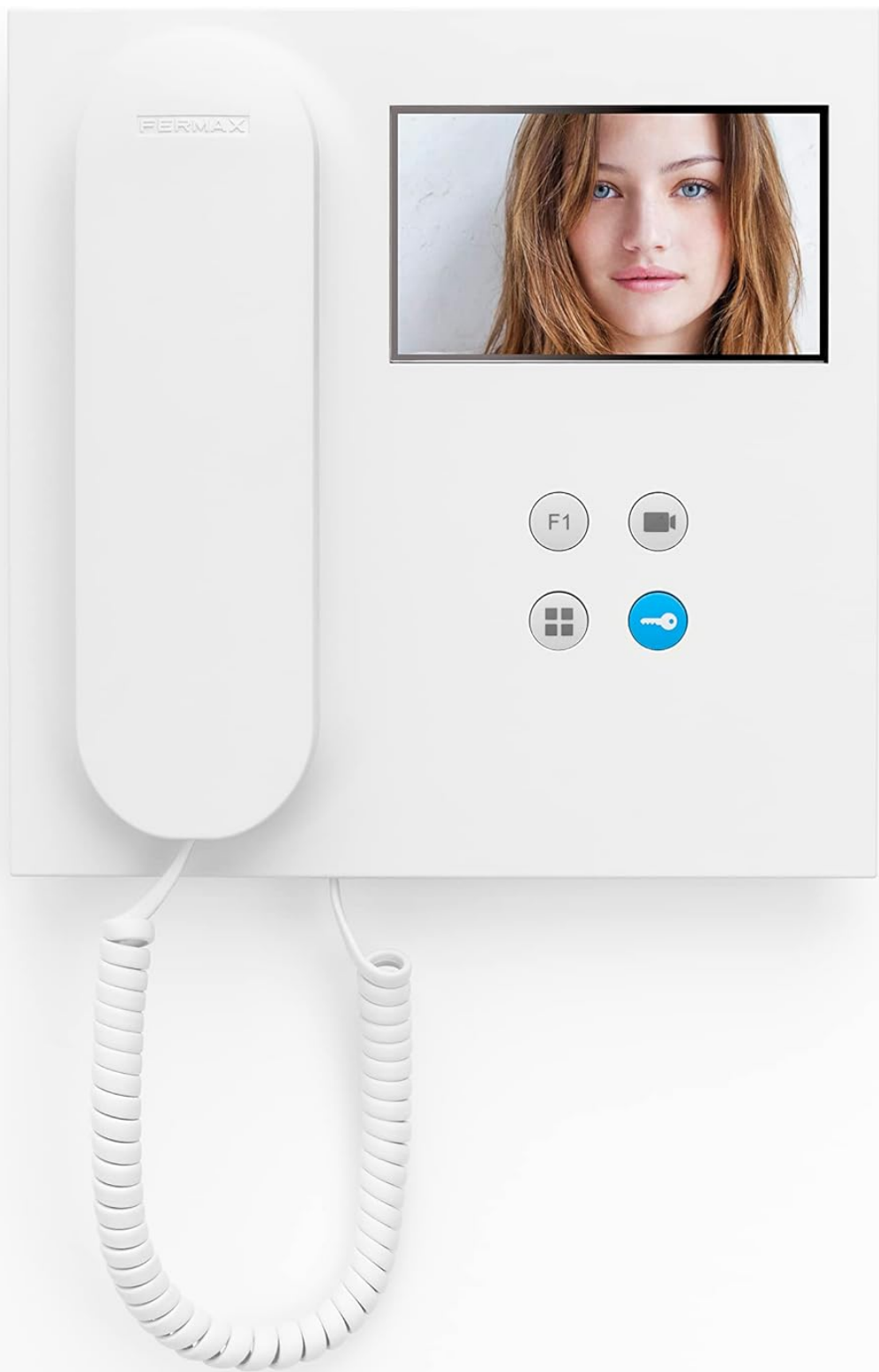
Image: Front view of the Fermax 9445 monitor, showing a live video feed on its 4.3-inch color screen and the handset in its cradle.