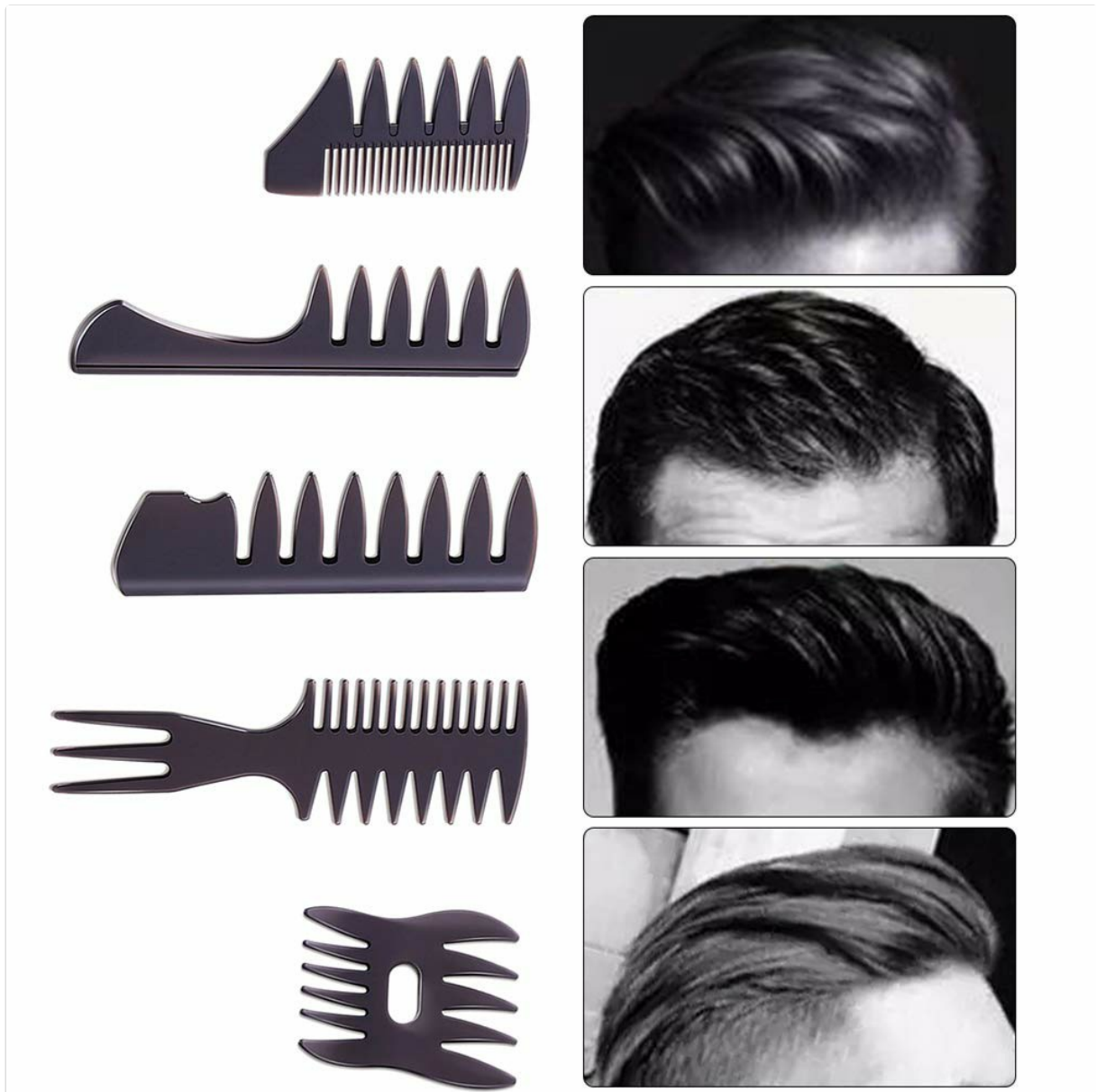
Image 4.1: Visual guide demonstrating the application of different comb types for various hair textures and styles.

4. Finishing: Once the desired style is achieved, use hairspray or other finishing products to hold the style in place, if necessary.