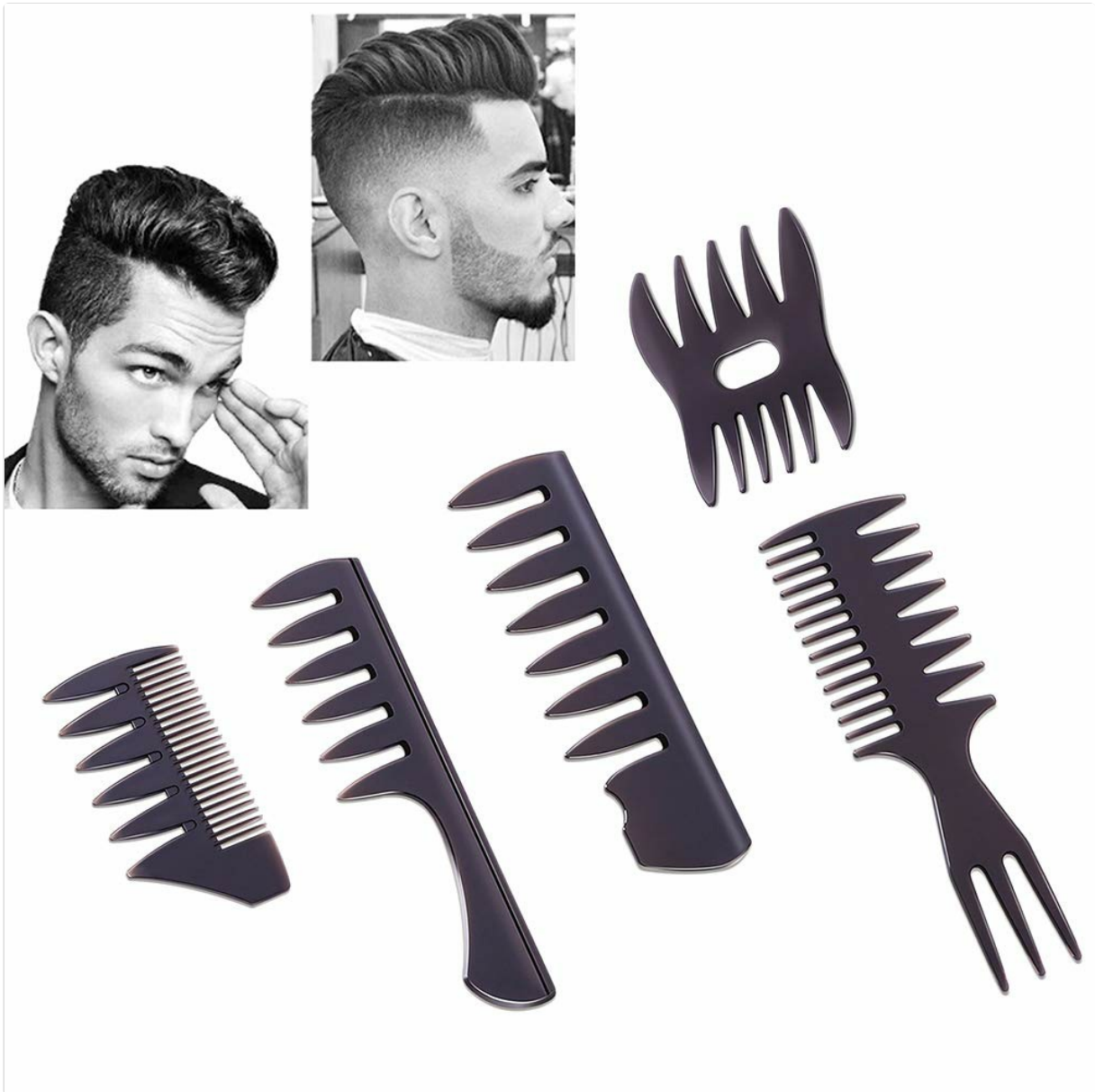
Image 2.1: The complete EastyGold 5-piece hair styling comb set, showcasing all five unique comb designs.