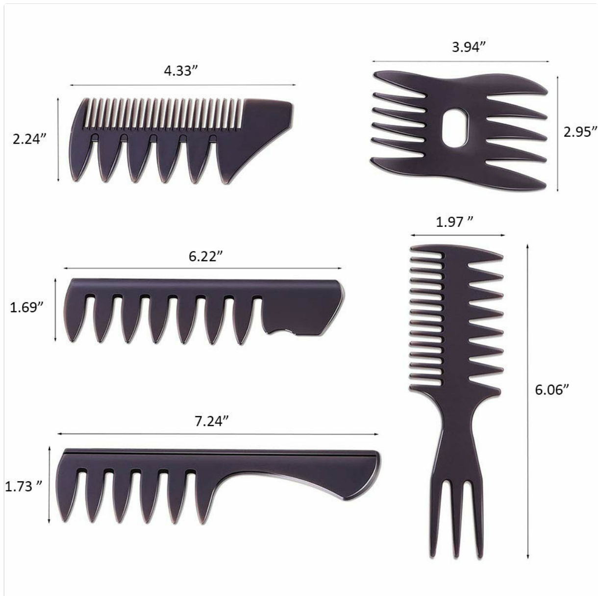
Image 7.1: Diagram illustrating the dimensions of each comb within the set.