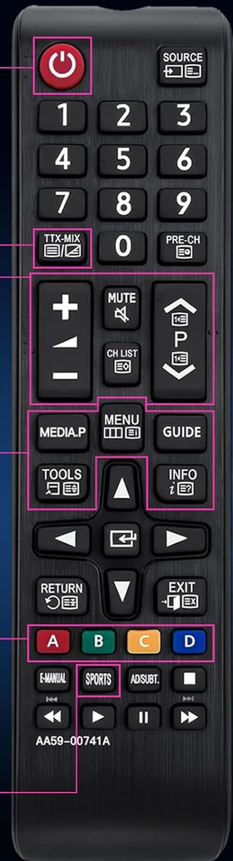
Image: A detailed diagram of the remote control, highlighting and explaining the function of each button.