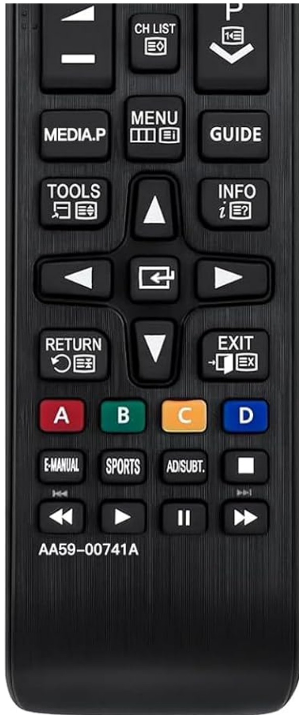
Image: Front view of the MYHGRC AA59-00741A replacement remote control, showcasing its button layout.

This remote is compatible with a wide range of Samsung TV models, including those that originally used remote controls such as BN59-00175B, AA59-00818A, AA59-00603A, BN59-01199G, AA59-00622A, AA59-00496A, AA59-01180A, BN59-01268D, AA59-00666A, AA59-01089-00600A, BN59-01175N, BN59-01199F, AA59-00786A, AA59-00602A, BN59-01247A, and AA59-00743A.