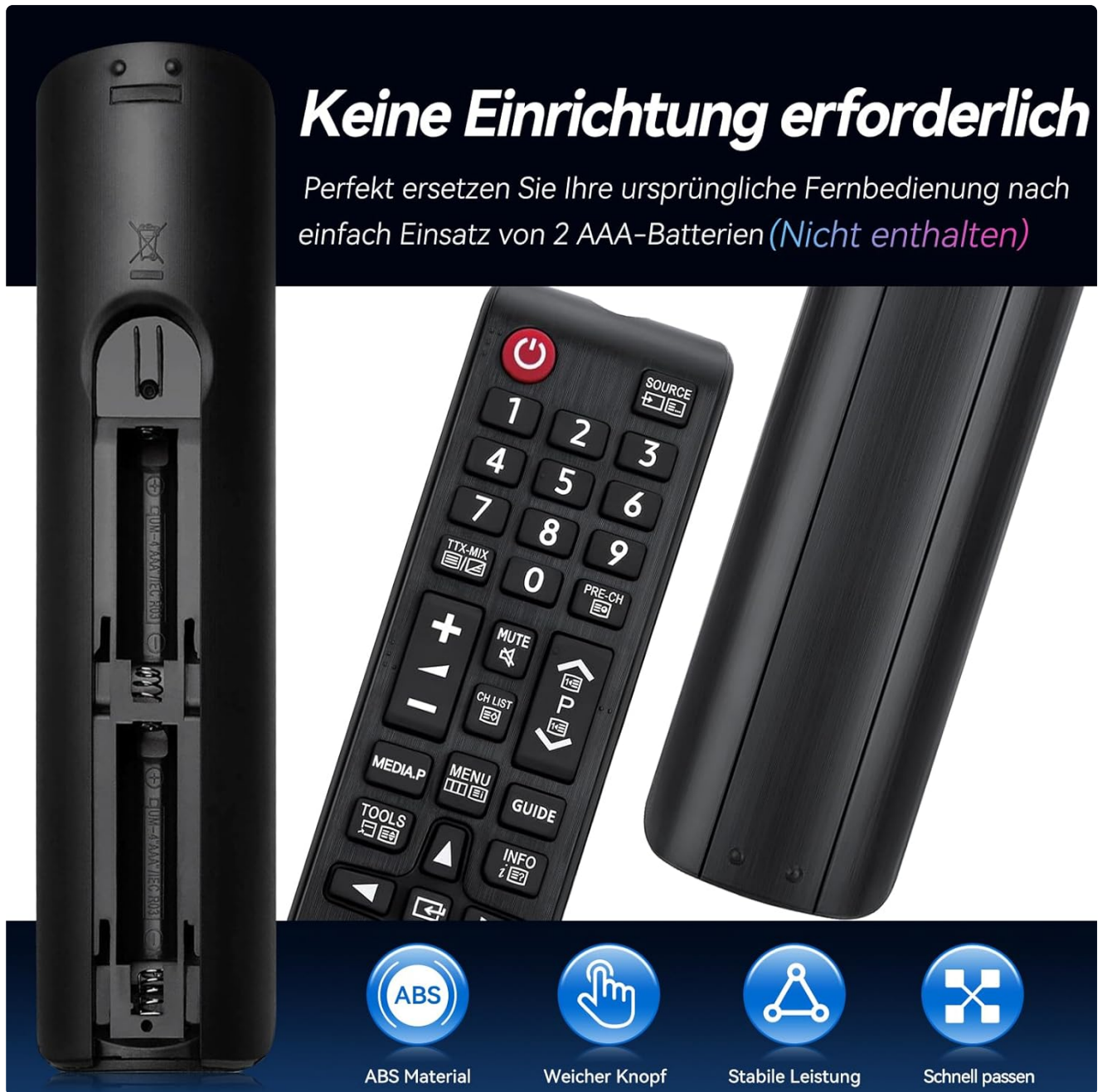
Image: A view of the remote control's battery compartment, showing where to insert two AAA batteries. Text indicates "No setup required".

Once the batteries are installed, the remote control is immediately operational. No additional pairing or code entry is necessary.