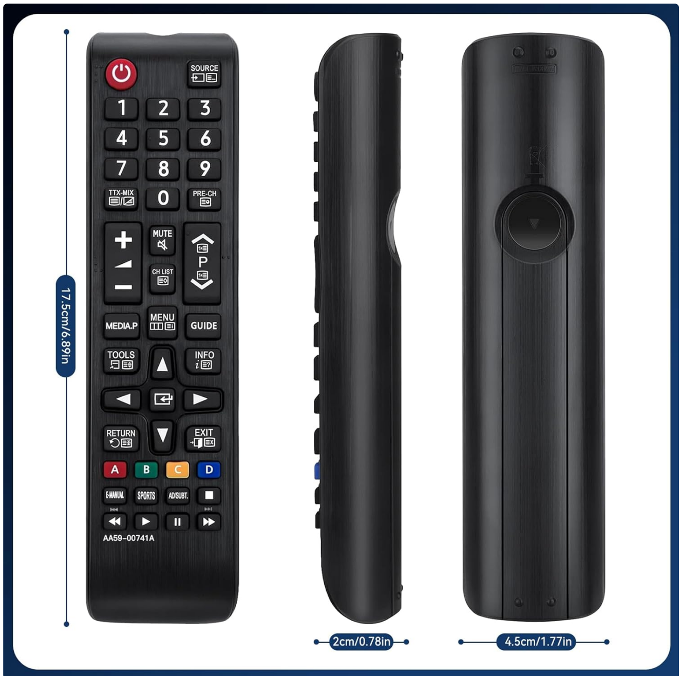
Image: A diagram showing the precise dimensions of the MYHGRC AA59-00741A remote control.