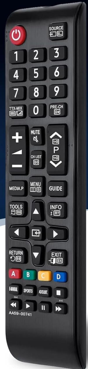
Image: The remote control positioned next to various Samsung Smart TV screens, illustrating its broad compatibility.