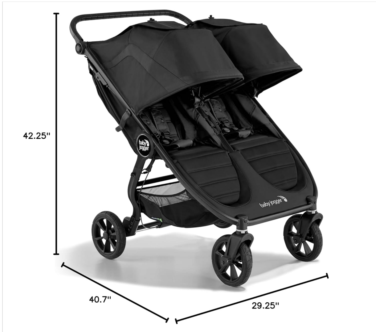
Image: Stroller dimensions for reference.