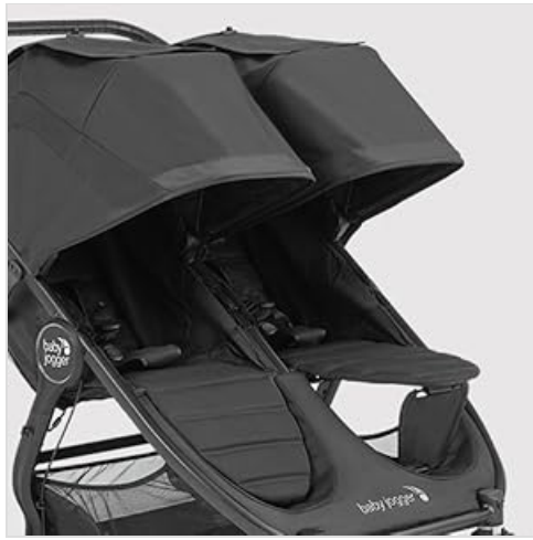
Image: Overview of stroller features, including the large storage basket.