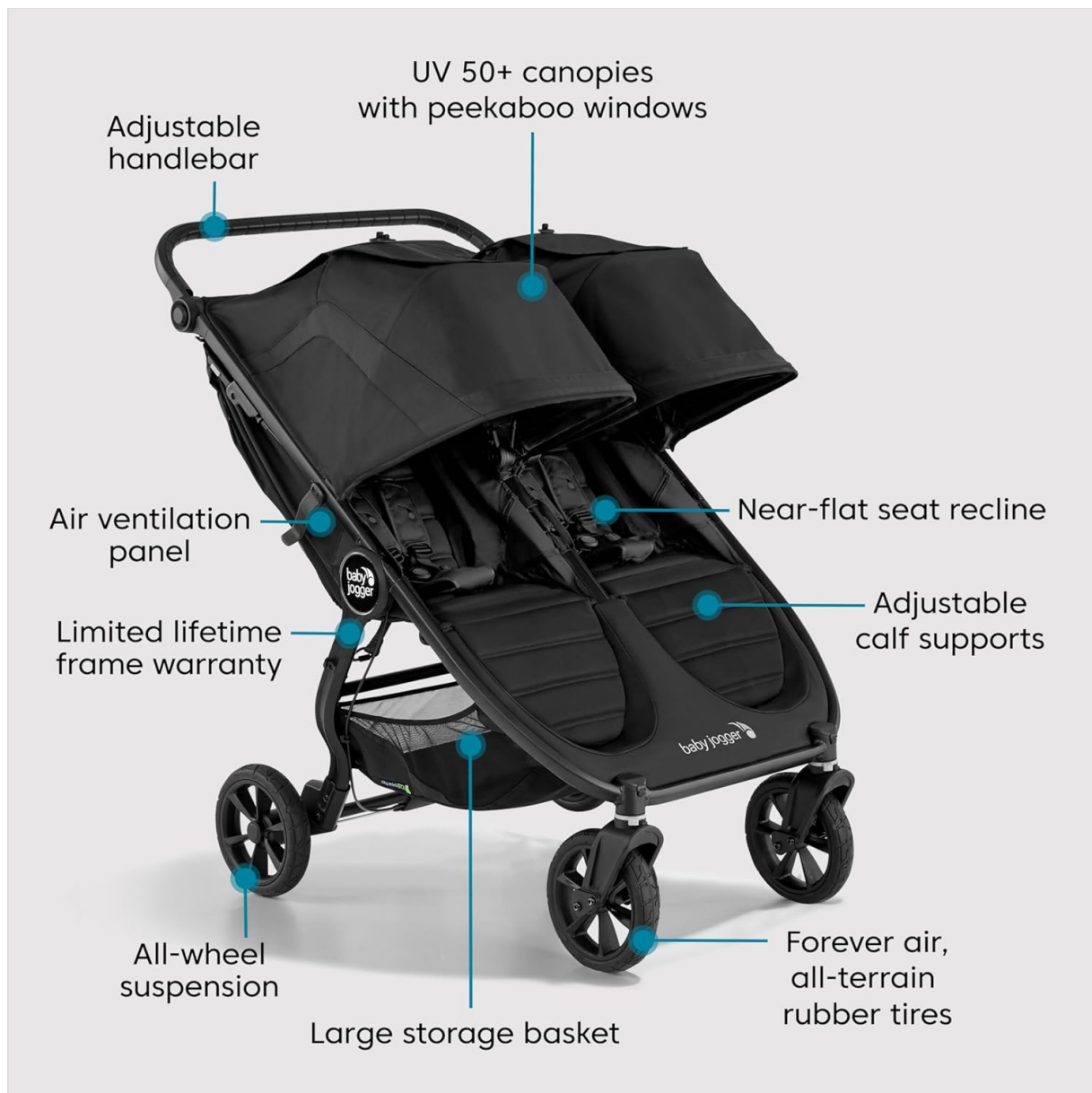
Image: Magnetic peekaboo window for checking on children.