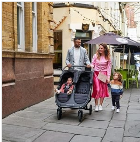
Image: Quick, compact fold for easy storage and transport.

When not in use, fold the stroller using the one-step, in-seat fold mechanism and store it in a dry, cool place away from direct sunlight.