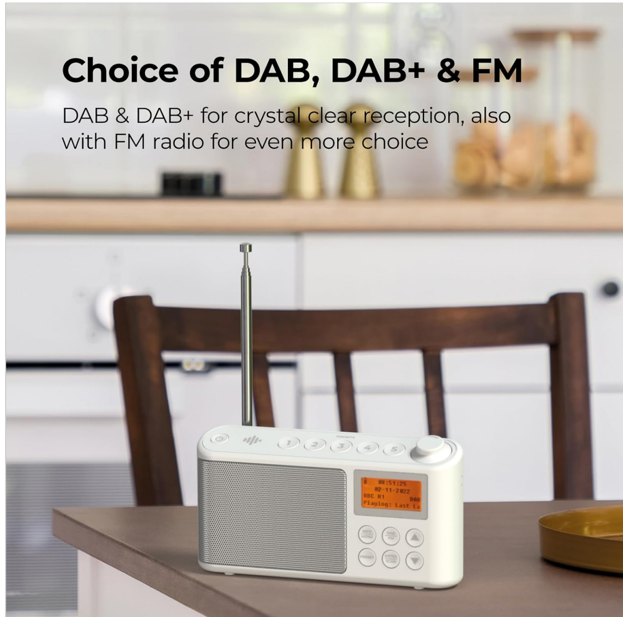
Figure 3: The radio offers both DAB/DAB+ and FM reception for a wide range of stations.

Press the DAB/FM Button to switch between DAB/DAB+ digital radio mode and FM analog radio mode.