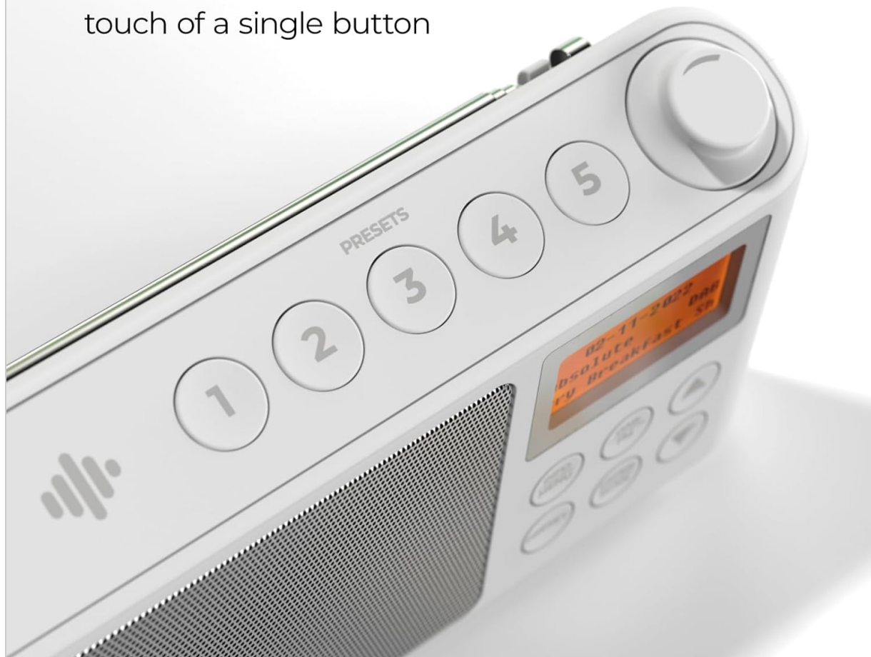
Figure 4: The five dedicated preset buttons provide instant access to your favorite stations.

Instantly recall your favourite DAB & FM stations at the touch of a single button