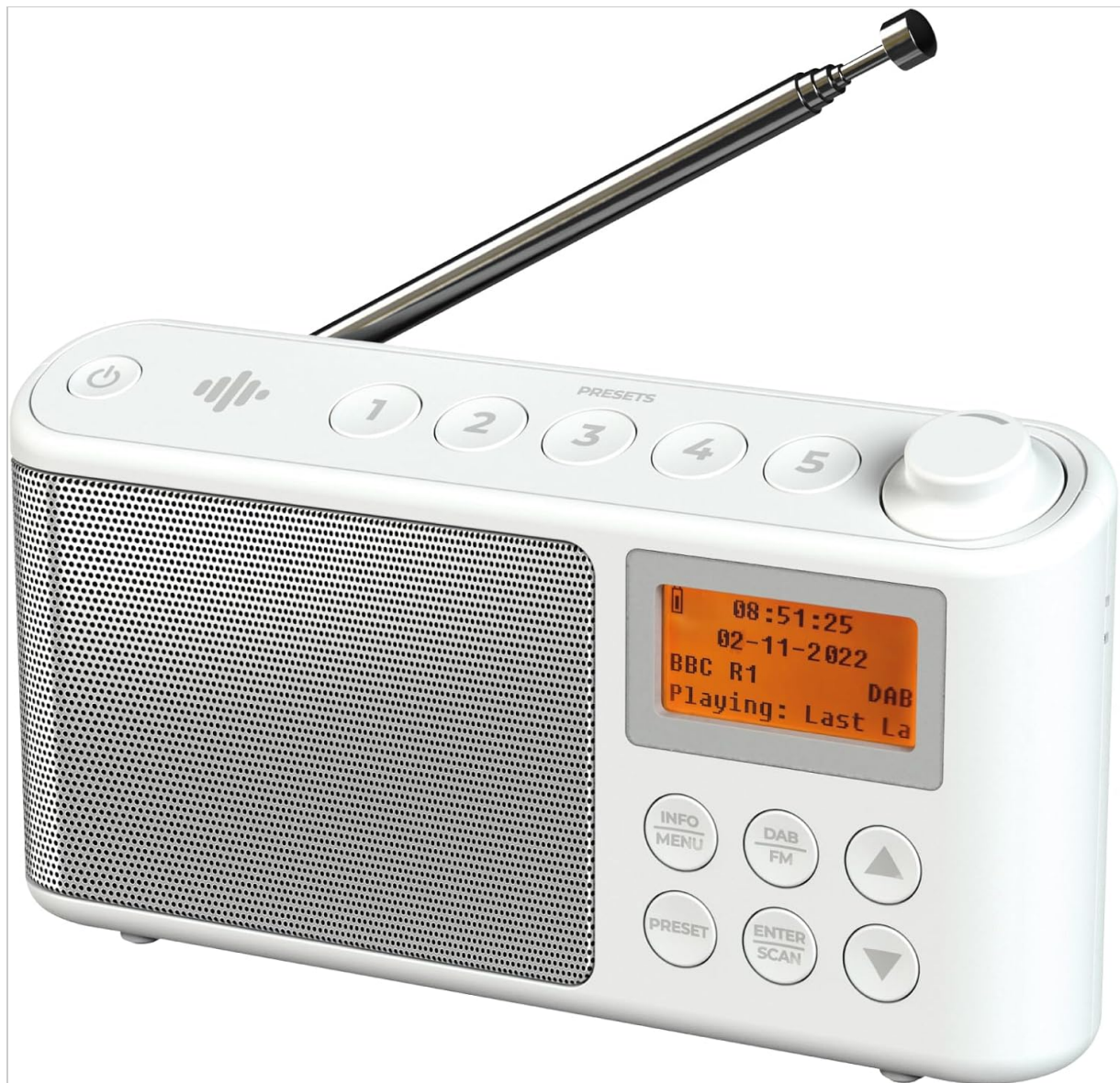
Figure 1: Front view of the i-box portable digital radio, showing the speaker grille, LCD display, and control buttons.

Familiarize yourself with the radio's components and controls.