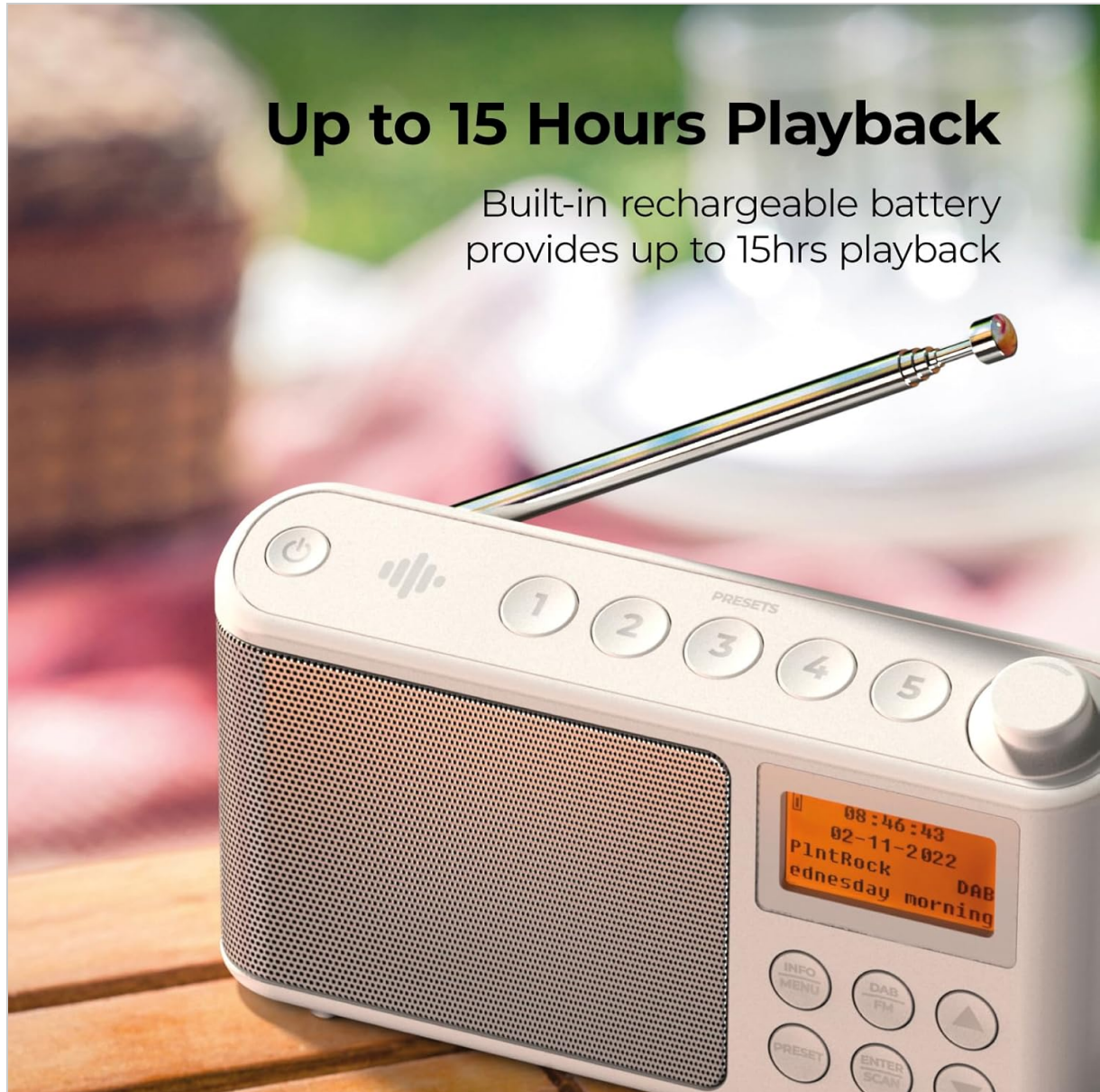
Figure 2: The radio operating on battery power, highlighting its portability and long playback time.