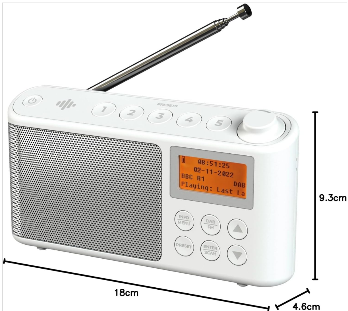
Figure 6: Dimensions of the i-box portable digital radio.