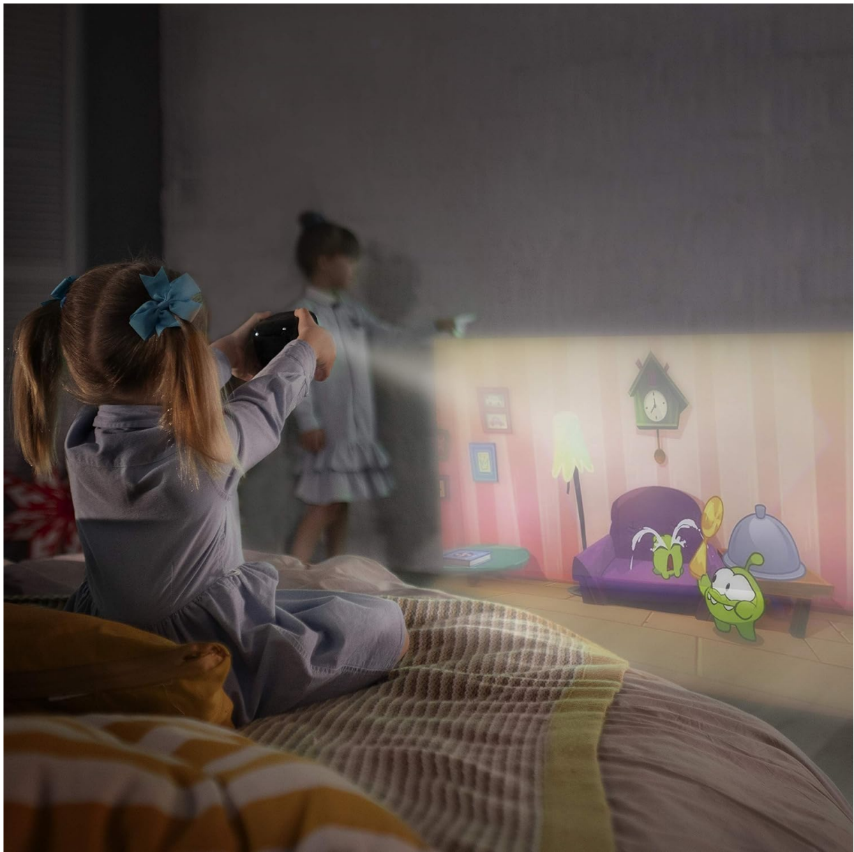
Image: Two young girls are shown standing in front of a wall, interacting with a colorful projected image from the CINEMOOD 360, which appears to be a game or interactive content.