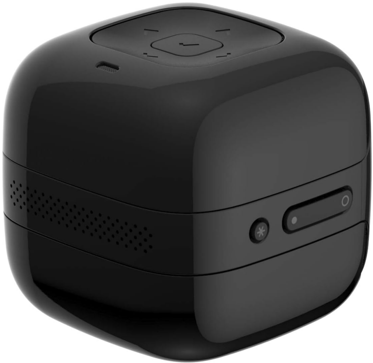
Image: A side view of the CINEMOOD 360 projector, showing the VR button, headphone jack, and micro-USB charging port.