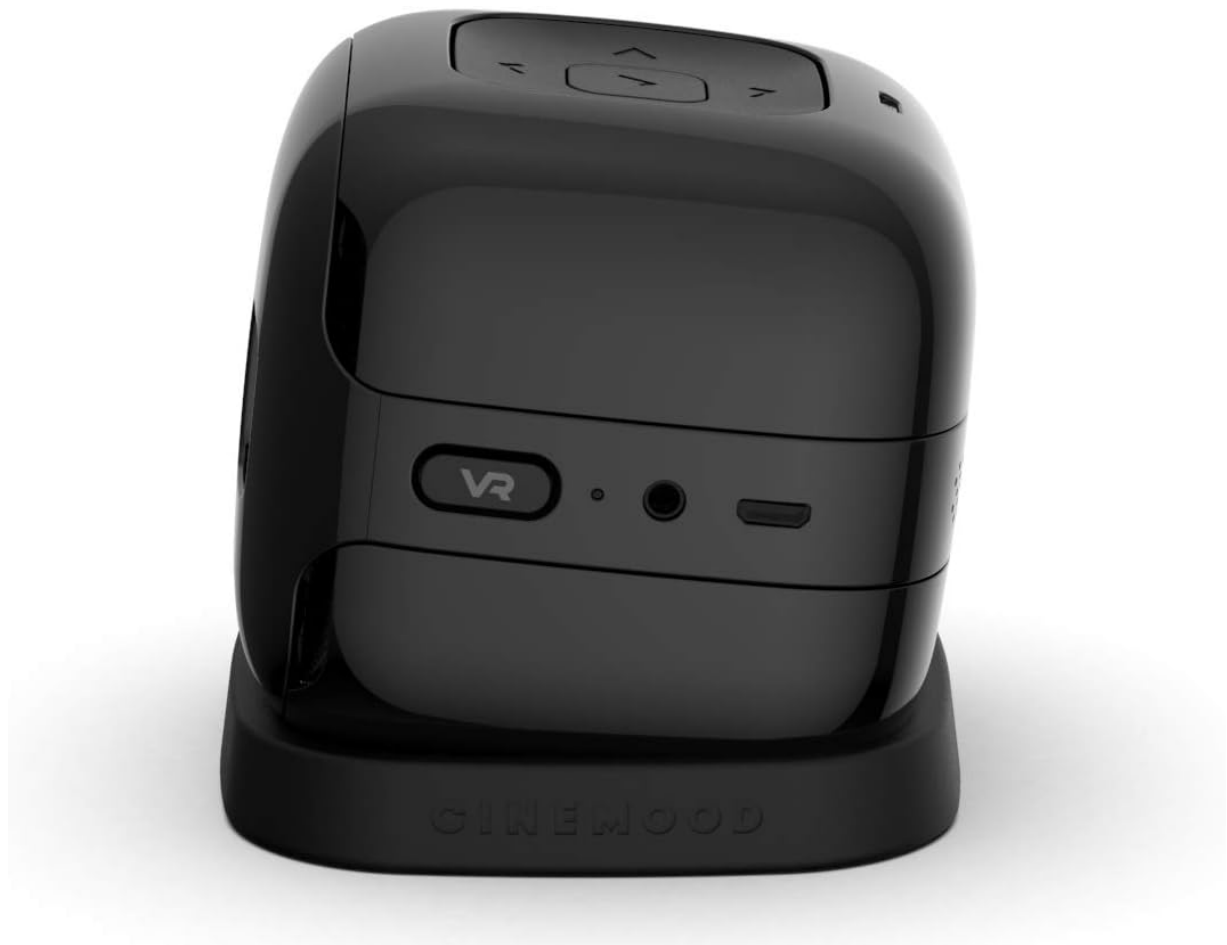
Image: A top-down view of the CINEMOOD 360 projector, highlighting its control buttons for navigation and volume on the top surface.

The CINEMOOD 360 features intuitive controls on the device itself and can also be controlled via a smartphone application.