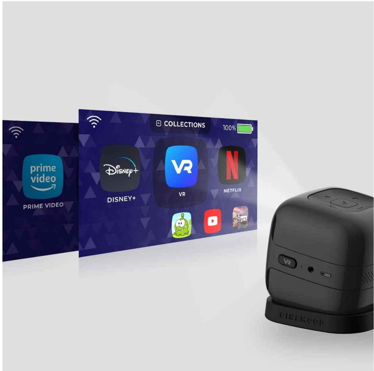
Image: The CINEMOOD 360 projector is shown projecting a user interface with icons for Prime Video, Disney+, VR content, Netflix, and YouTube, illustrating its streaming capabilities.

Press and hold the power button to turn on the projector. Follow the on-screen prompts to connect to your Wi-Fi network. A stable internet connection is required for accessing streaming services and software updates.