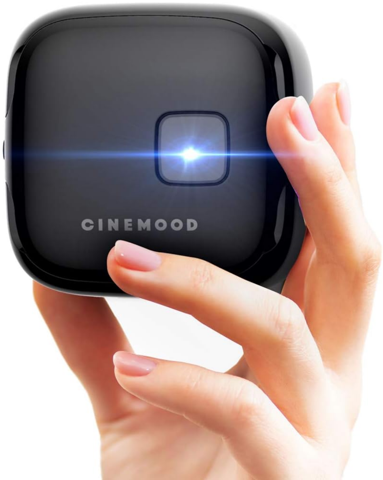
Image: The CINEMOOD 360 projector, a small black cube, is held in a person's hand, with a bright light beam emanating from its lens, indicating its projection capability.