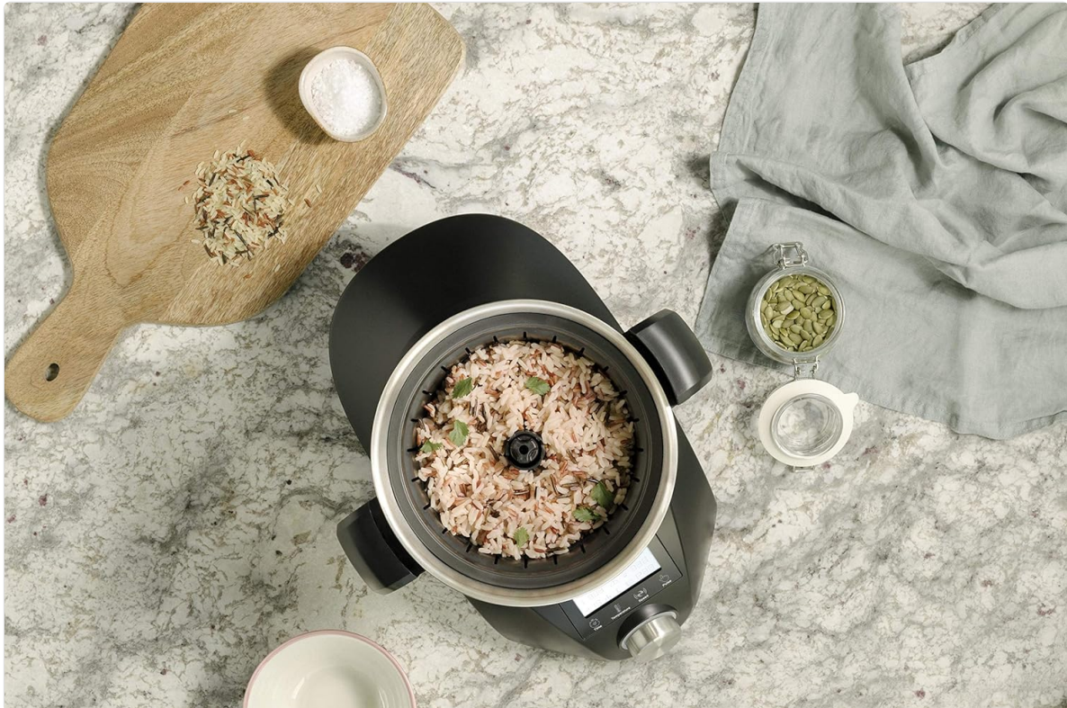
The IKOHS CHEFBOT Compact STEAMPRO food processor, ready for use.

Thank you for choosing the IKOHS CHEFBOT Compact STEAMPRO. This versatile food processor is designed to simplify your cooking experience with its numerous functions, including steaming, chopping, mixing, kneading, and more. Please read this manual carefully before first use to ensure safe and optimal operation of your appliance. Keep this manual for future reference.