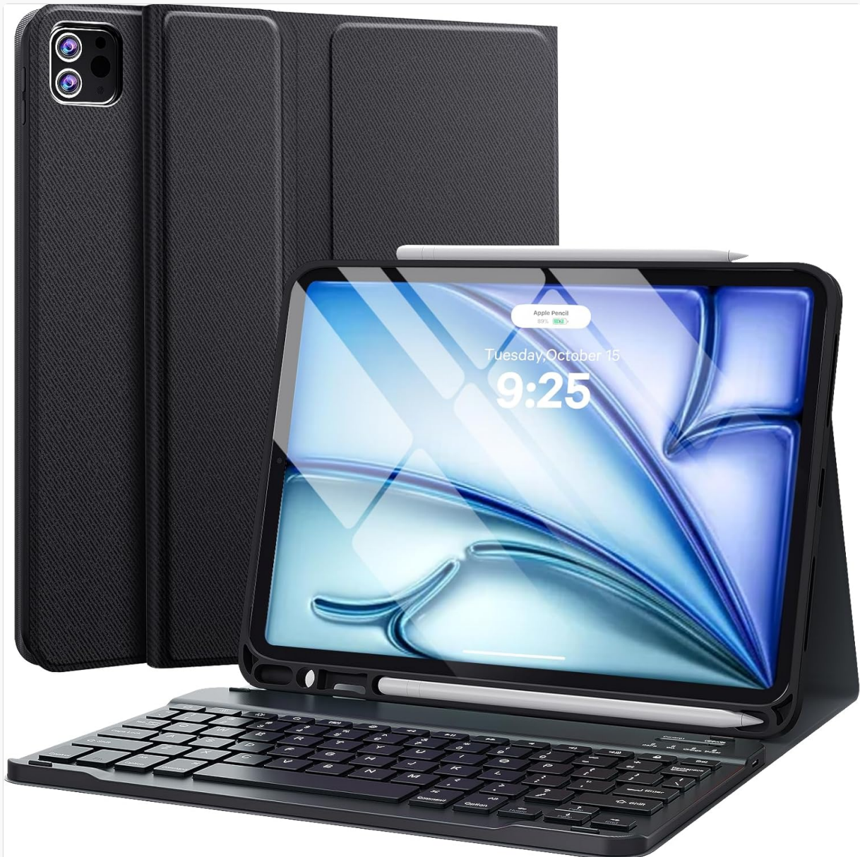
Image: CHESONA Wireless Keyboard Case with iPad and Apple Pencil.

Video: Overview of the CHESONA Keyboard Case features, including detachable keyboard, multiple viewing angles, and pencil holder.