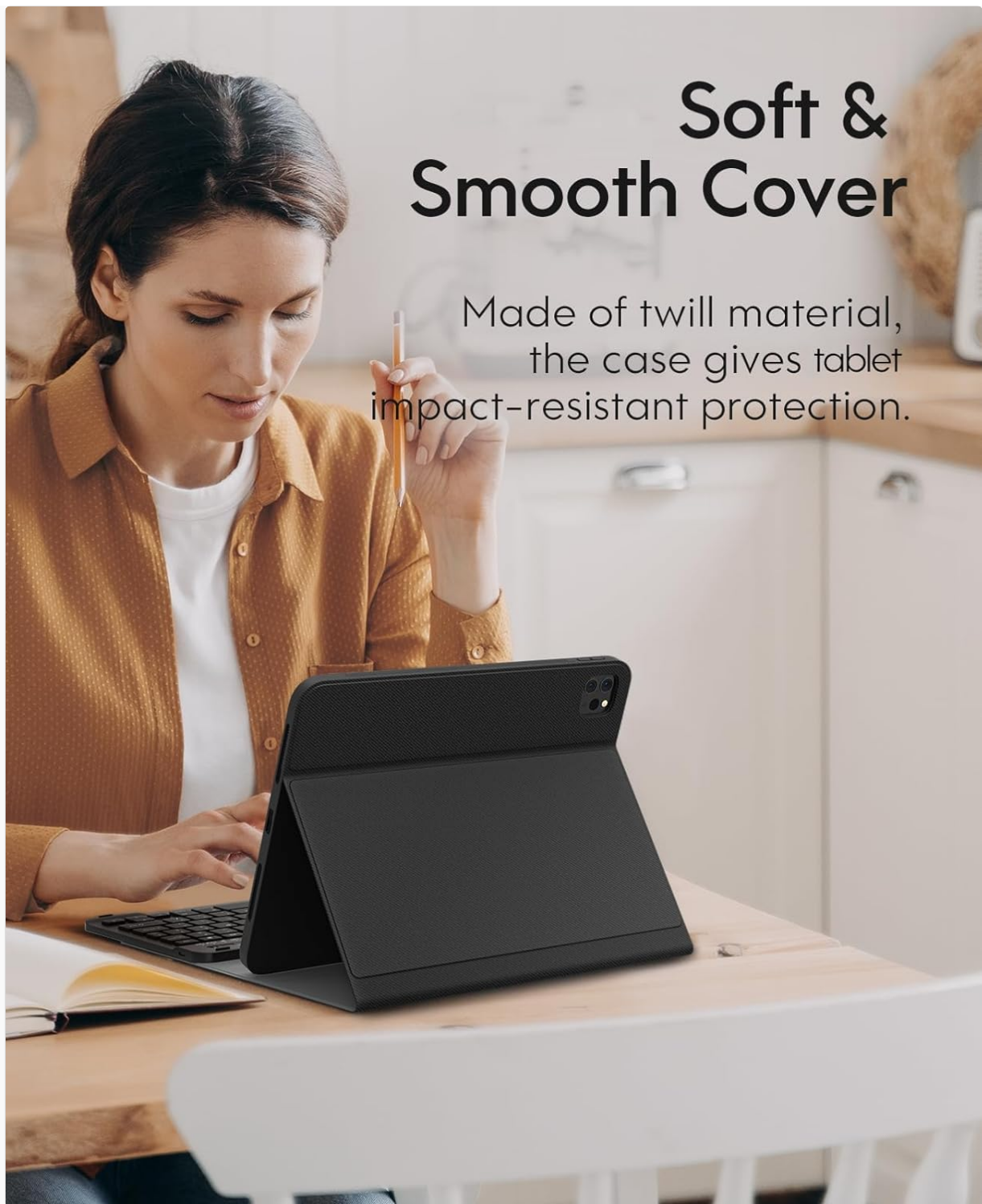
Image: Close-up of the soft and smooth cover material.