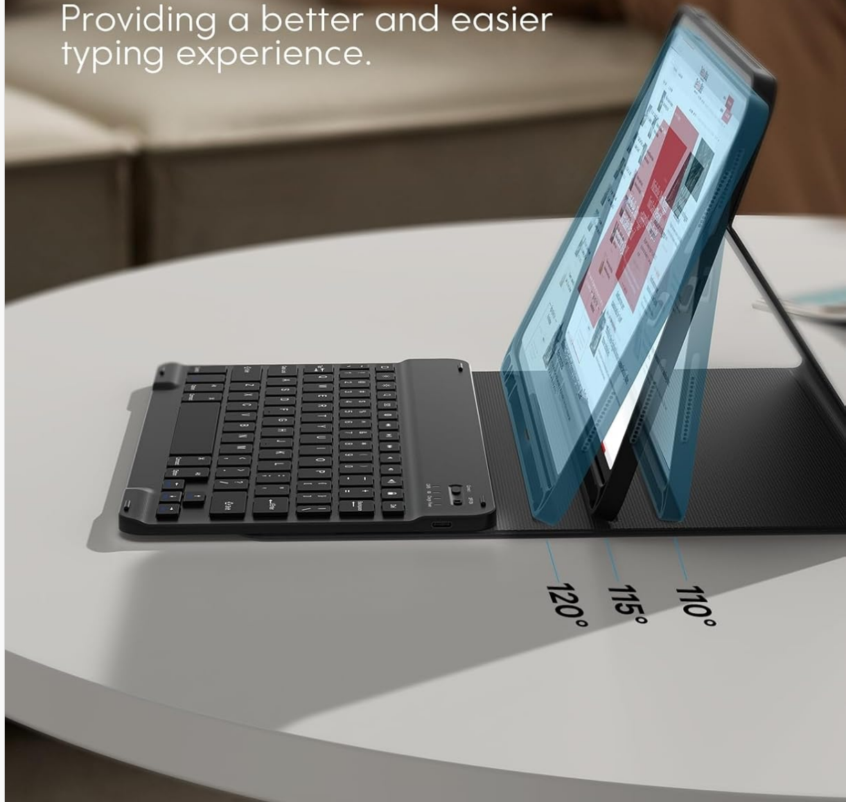
Image: iPad case demonstrating adjustable viewing angles.

Providing a better and easier typing experience.