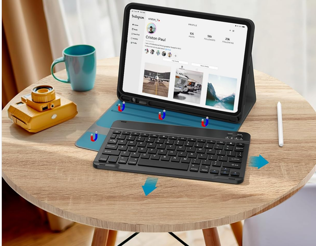
Image: Detachable wireless Bluetooth keyboard.

Easy to remove and attach whenever you need to.