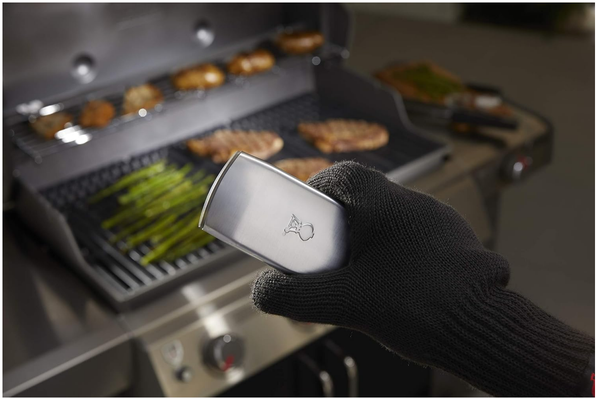
Image: A hand holding the Weber Handle Grill 'N Go Light after detaching it from the grill handle.