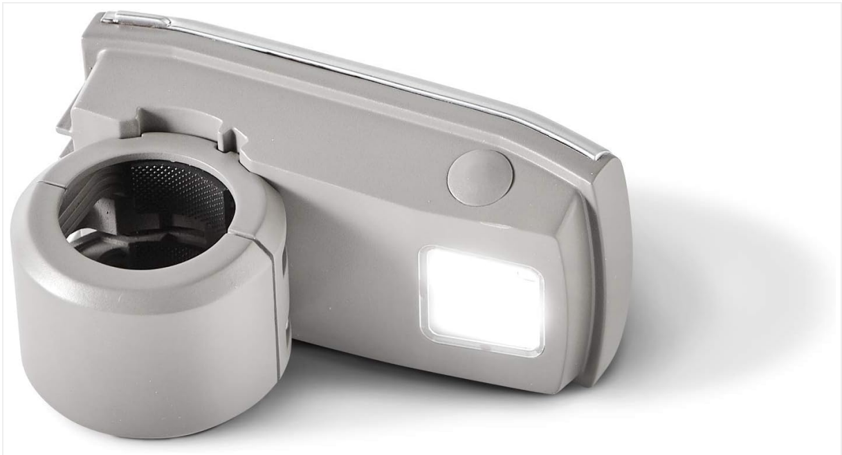
Image: The LED light of the Grill 'N Go Light illuminated.