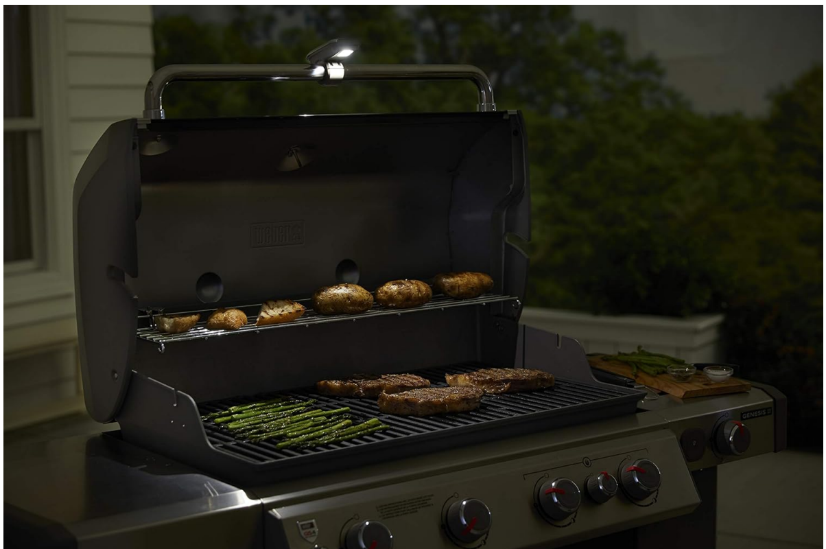
Image: A Weber grill with food cooking, brightly illuminated by the attached Grill 'N Go Light during nighttime.