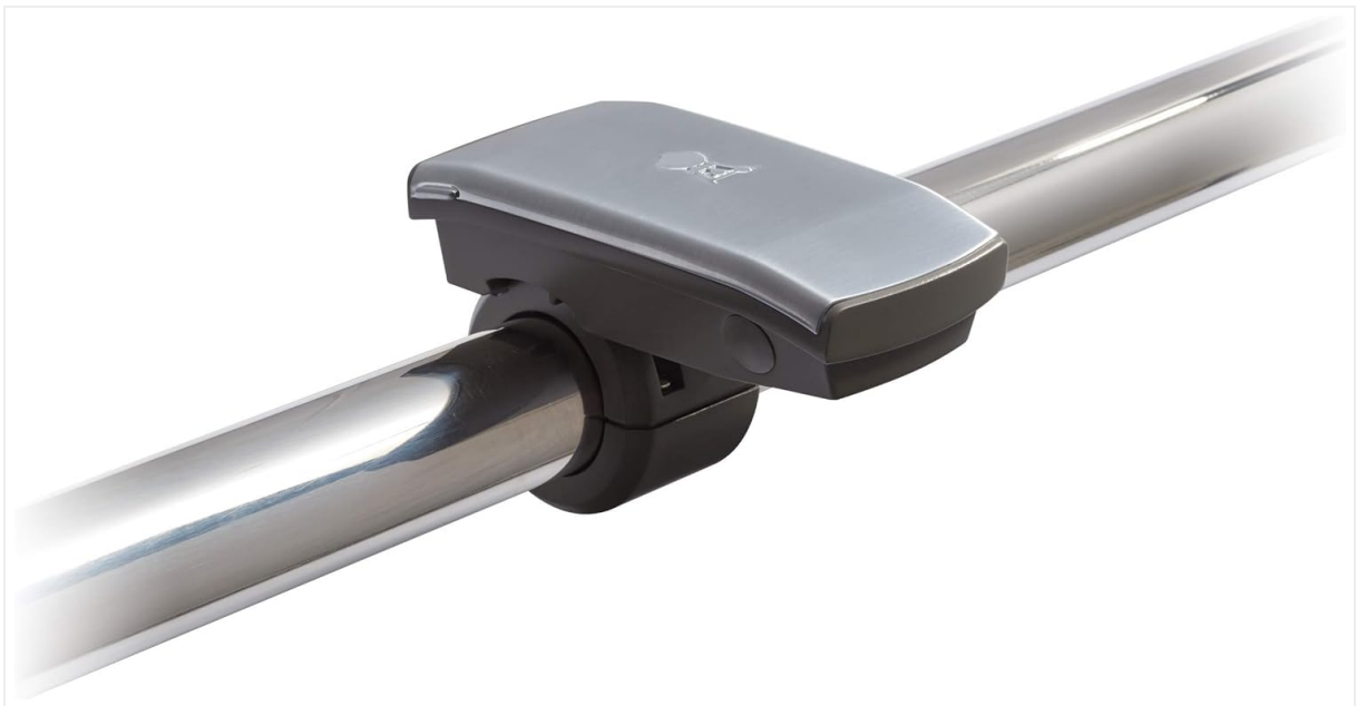
Image: The Weber Handle Grill 'N Go Light securely attached to a grill handle.