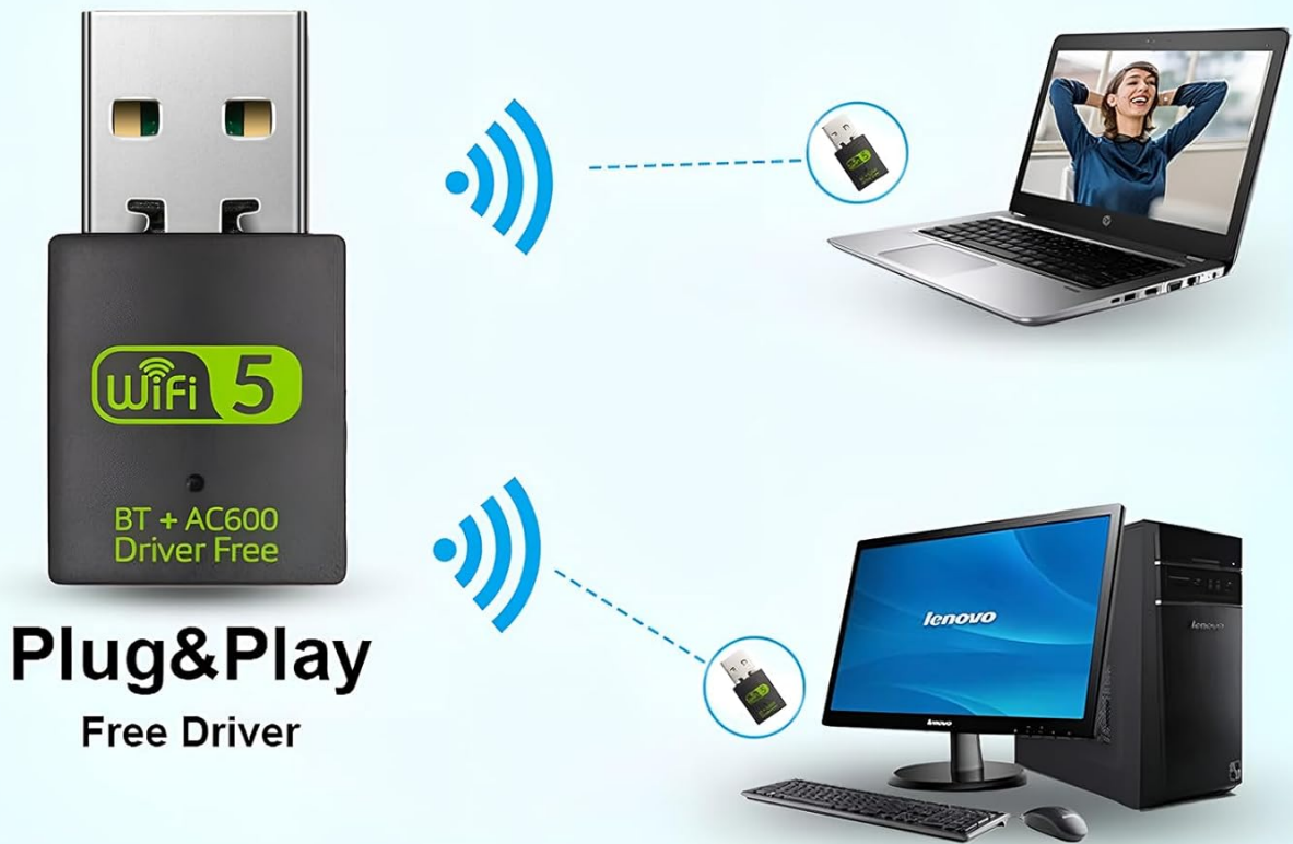
Figure 3.1: Plug and Play installation for desktop and laptop computers.