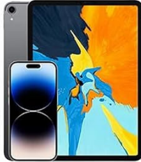
Smartphone & Tablet