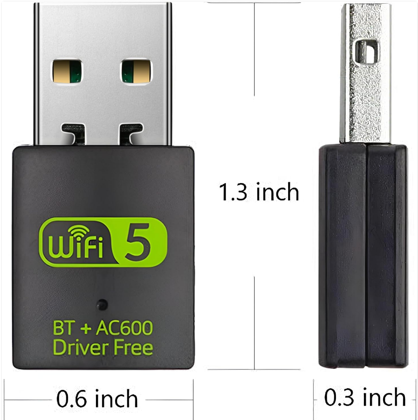
Figure 5.1: Physical dimensions of the adapter.