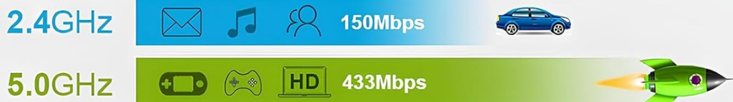
Figure 4.1: Dual-band Wi-Fi operation.