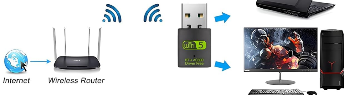
Figure 4.2: Wi-Fi and AP mode functionality.