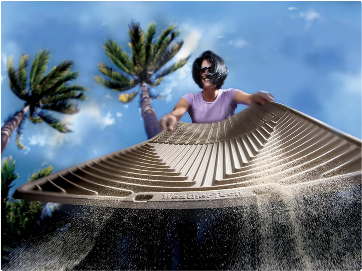
Image 6.1: Demonstrating the ease of cleaning by shaking off sand from a WeatherTech mat.

Your browser does not support the video tag.