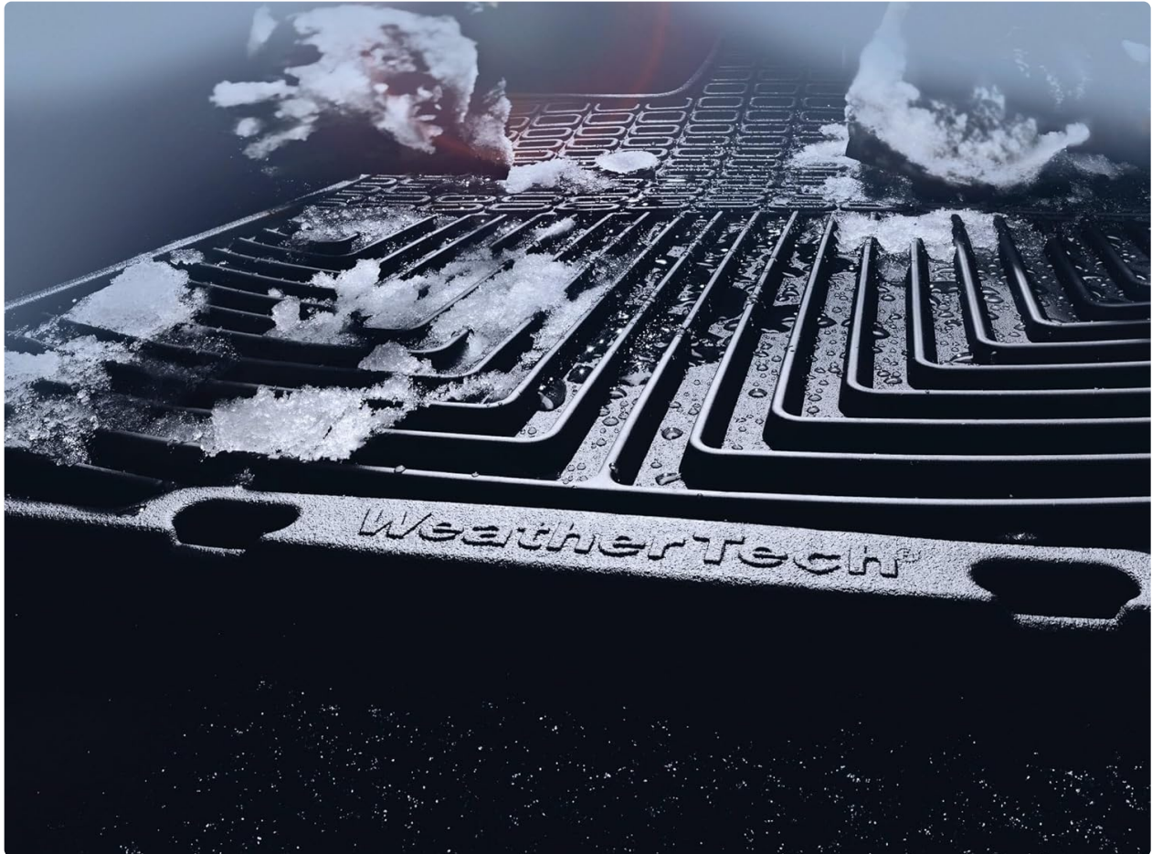
Image 5.1: WeatherTech mat effectively containing snow and ice, preventing it from reaching the vehicle's carpet.

WeatherTech All-Weather Floor Mats are designed for continuous use in all seasons and conditions. Their deep channels effectively contain spills, dirt, and debris, keeping your vehicle's carpet clean and protected.