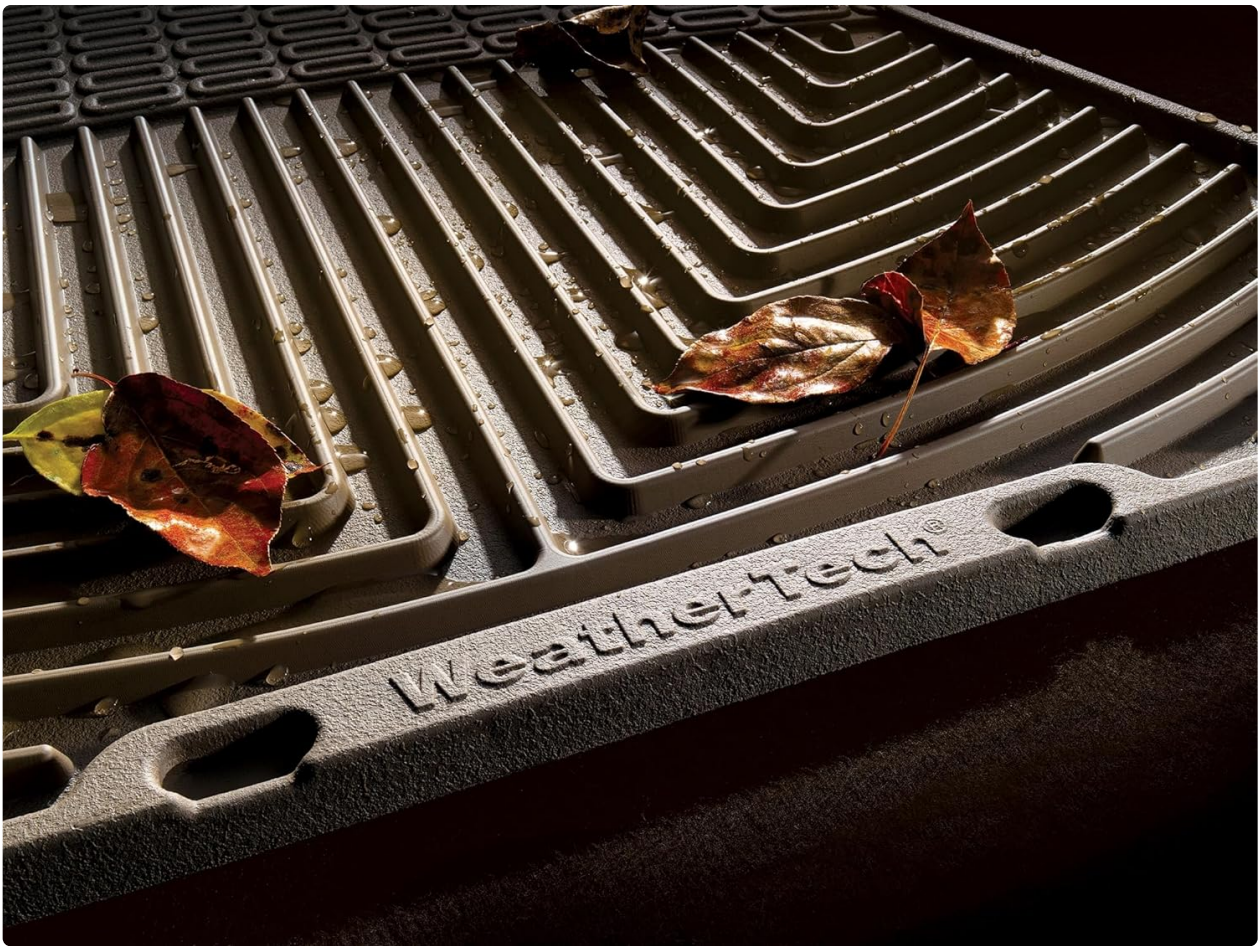
Image 5.2: WeatherTech mat with leaves and water, demonstrating its ability to trap debris and moisture.