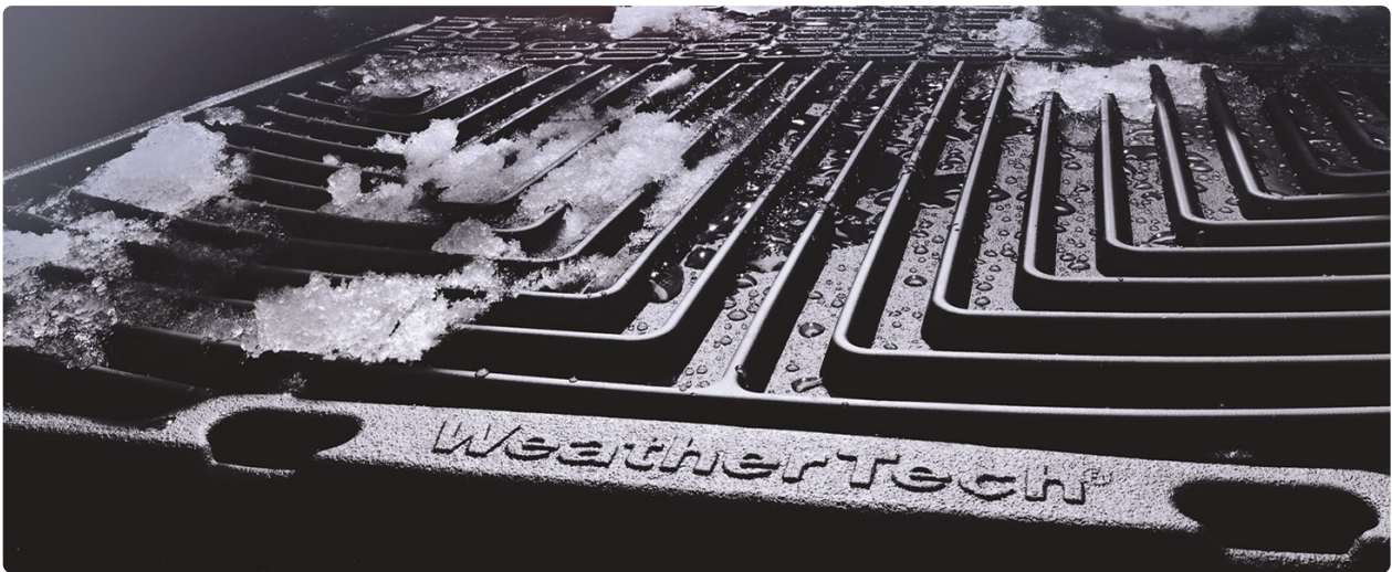
Image 3.1: Detailed view of the mat's textured surface and channels designed to contain liquids and debris.