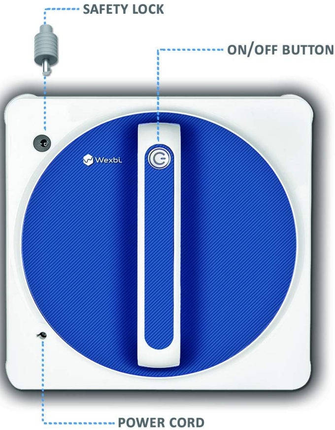
Image: A detailed view of the Wexbi W189 robot with key components such as the safety lock, on/off button, power cord, and micro-fiber cleaning cloth areas labeled.