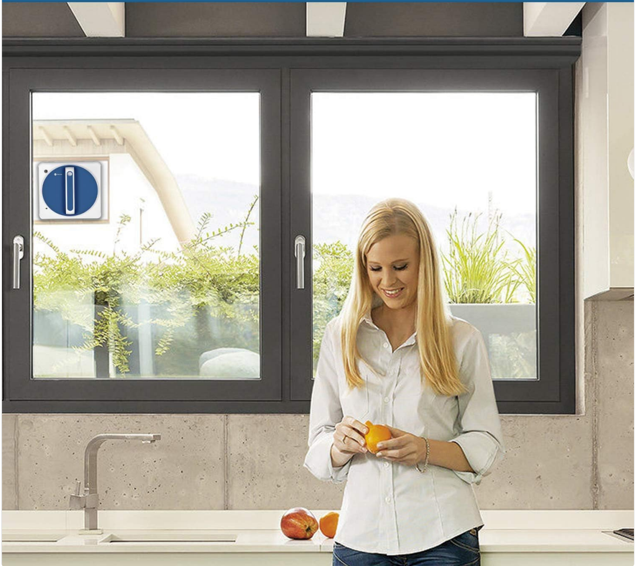
Image: The Wexbi W189 robot actively cleaning an indoor window, demonstrating its operation.

WHEN YOU ARE RESTING, WEXBI M189 CLEANING ROBOT IS WORKING FOR YOU!