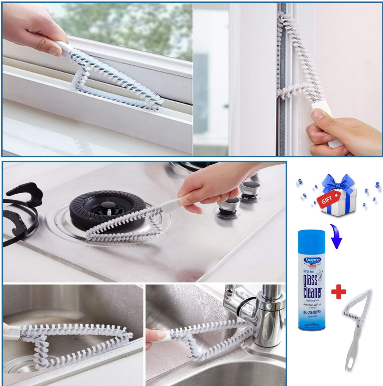
Image: The included track cleaning brush and a can of glass cleaner solution, useful for preparing windows and maintaining tracks.