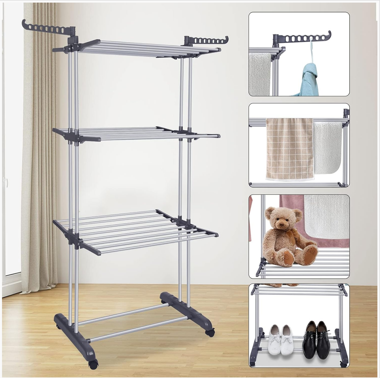
Figure 5: Versatile Use of the Drying Rack