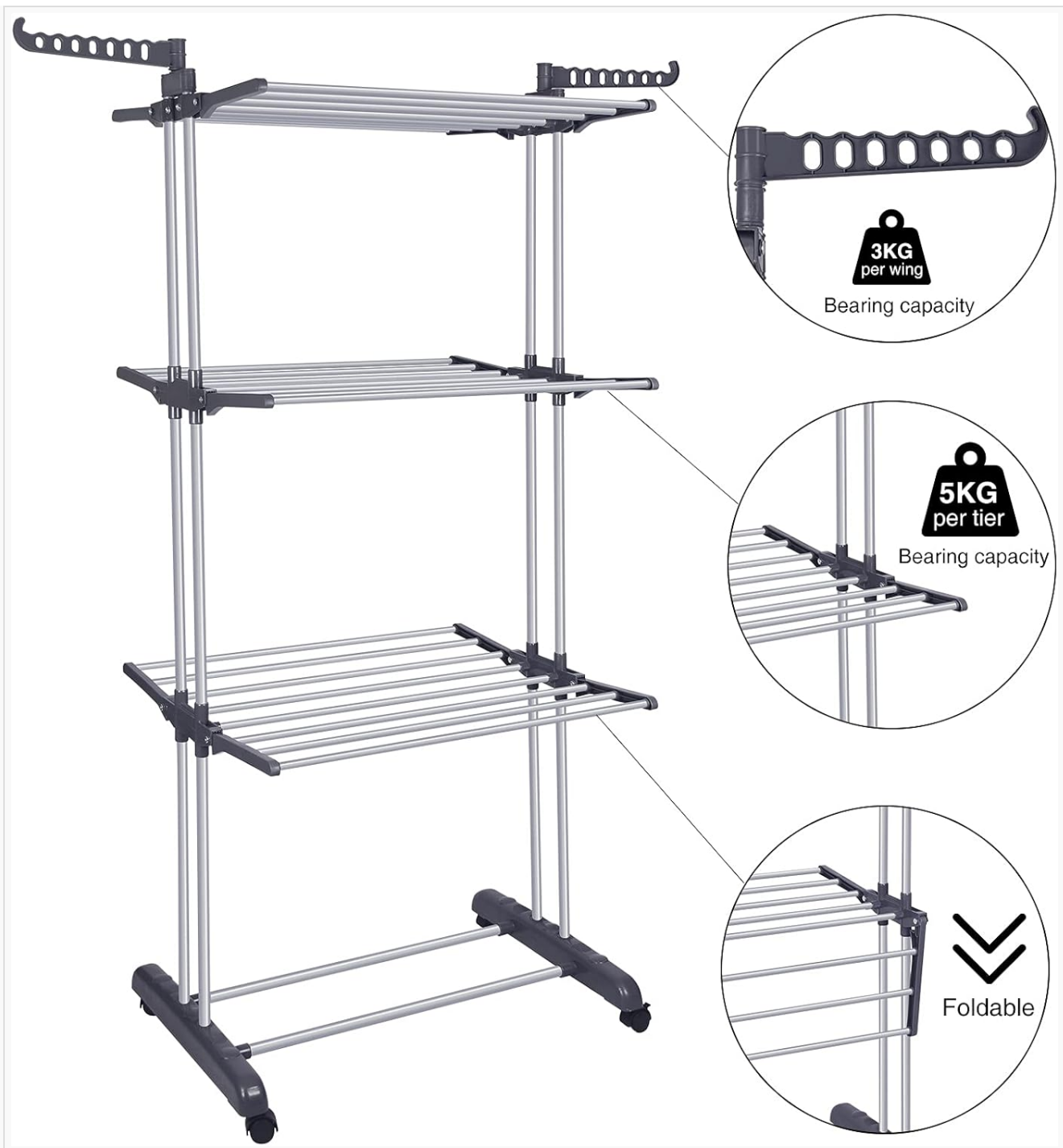
Figure 6: Folding Mechanism and Capacity