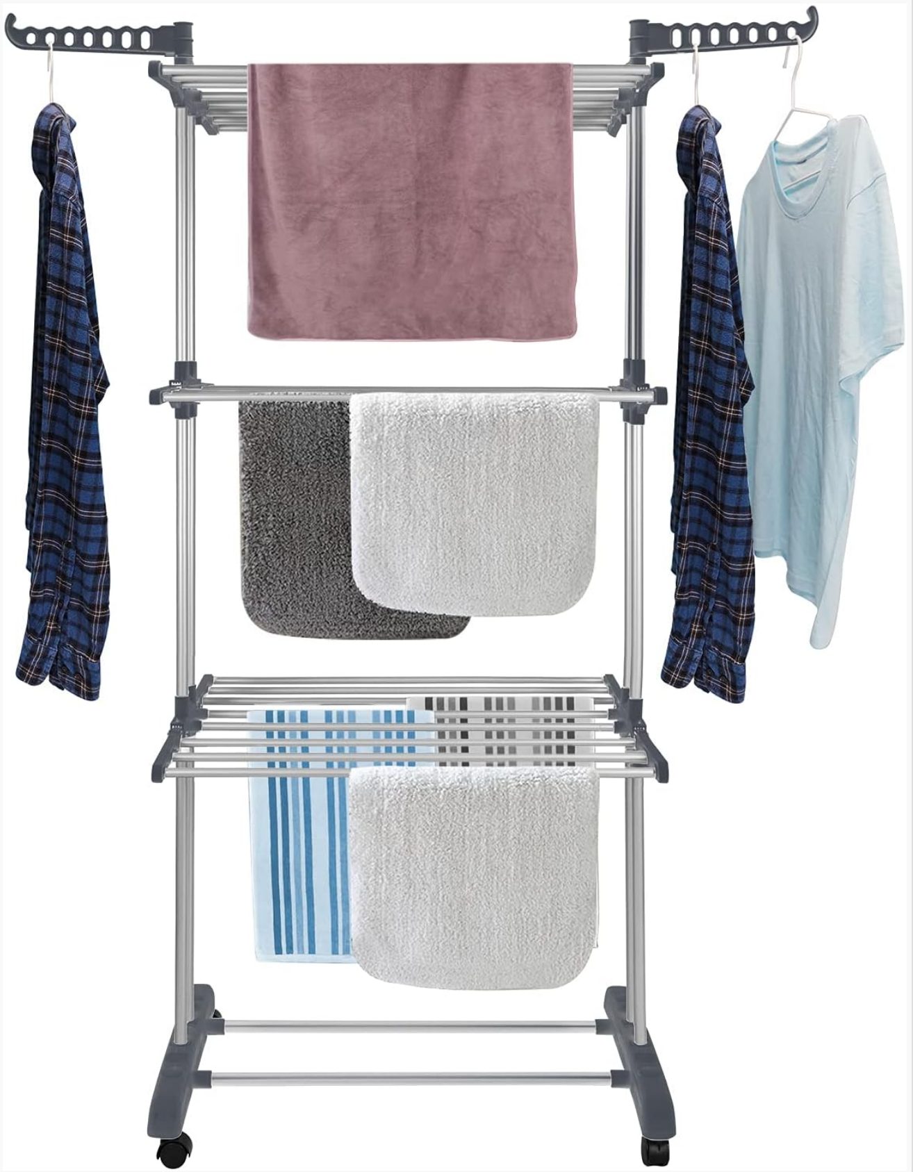
Figure 1: Bigzzia 4-Tier Clothes Drying Rack