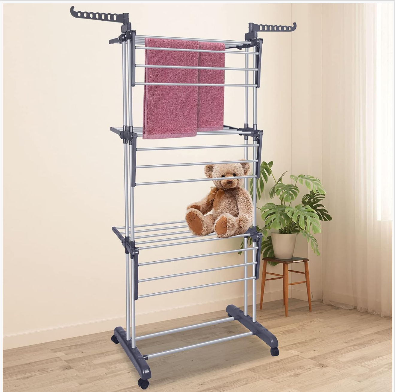
Figure 4: Rack in Use with Clothes

Each clothes drying rack can be folded down to conserve space when not in use. Collapse the trays and fold the side wings inward.