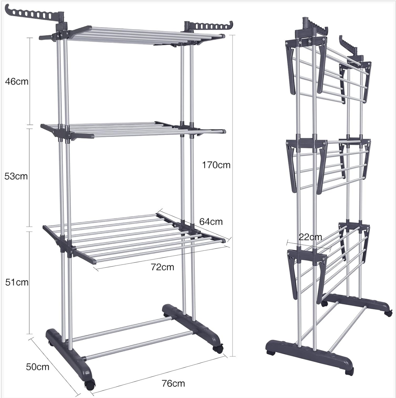
Figure 2: Assembly Diagram with Dimensions