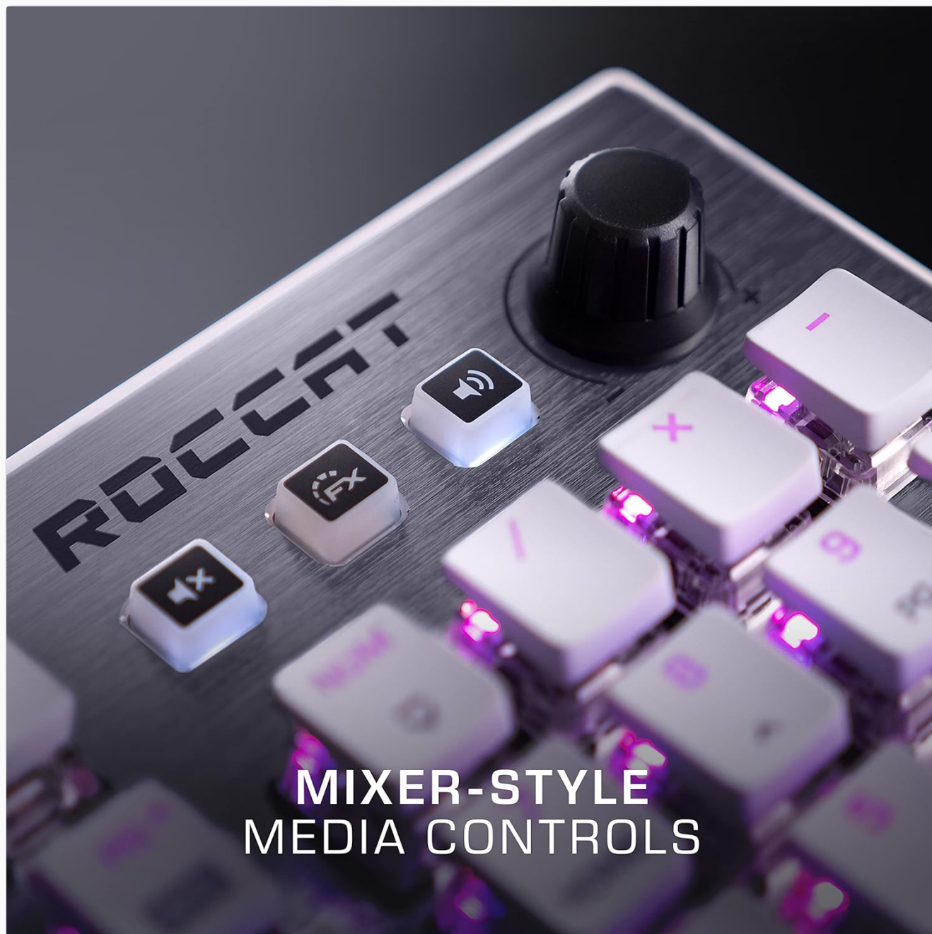
Image: A close-up view of the mixer-style media controls on the Roccat Vulcan 122, including the volume knob and dedicated function keys.