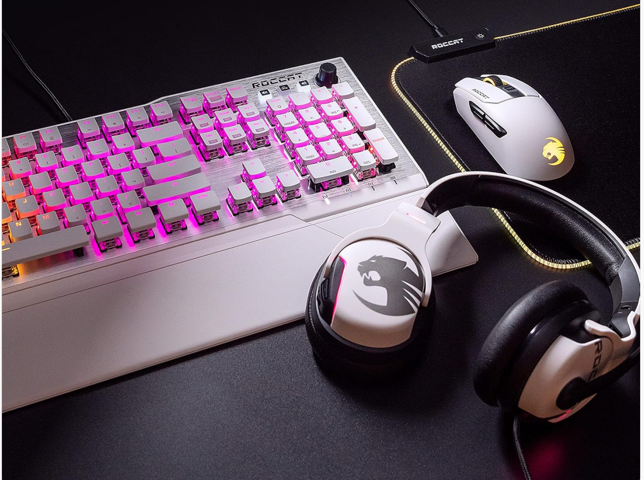
Image: The Roccacat Vulcan 122 keyboard shown with a Roccacat mouse and headset, demonstrating its vivid, dynamic lighting synergy with AIMO.