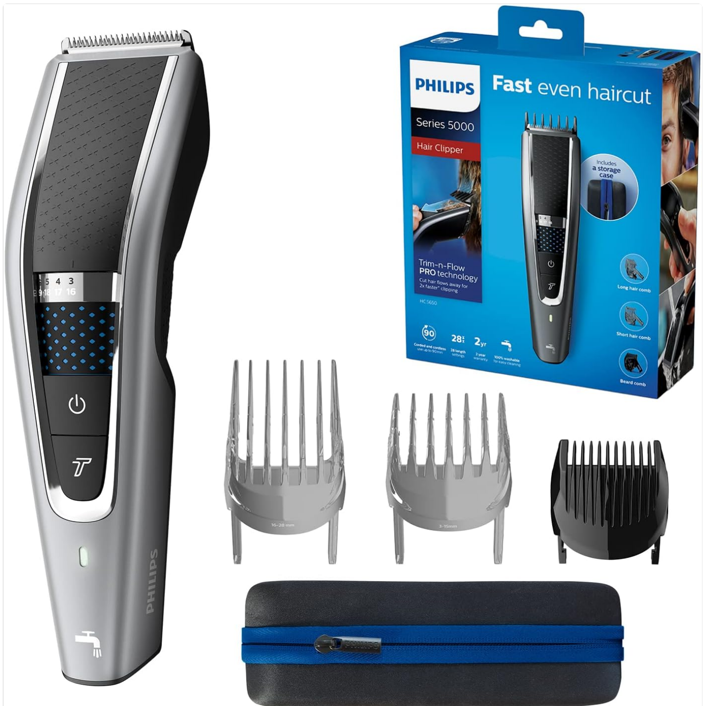
Figure 1.1: Philips Hairclipper series 5000, including the clipper, various comb attachments, and a storage pouch.