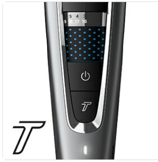
Figure 5.1: The hair clipper is designed to be easily cleaned by rinsing under running water.