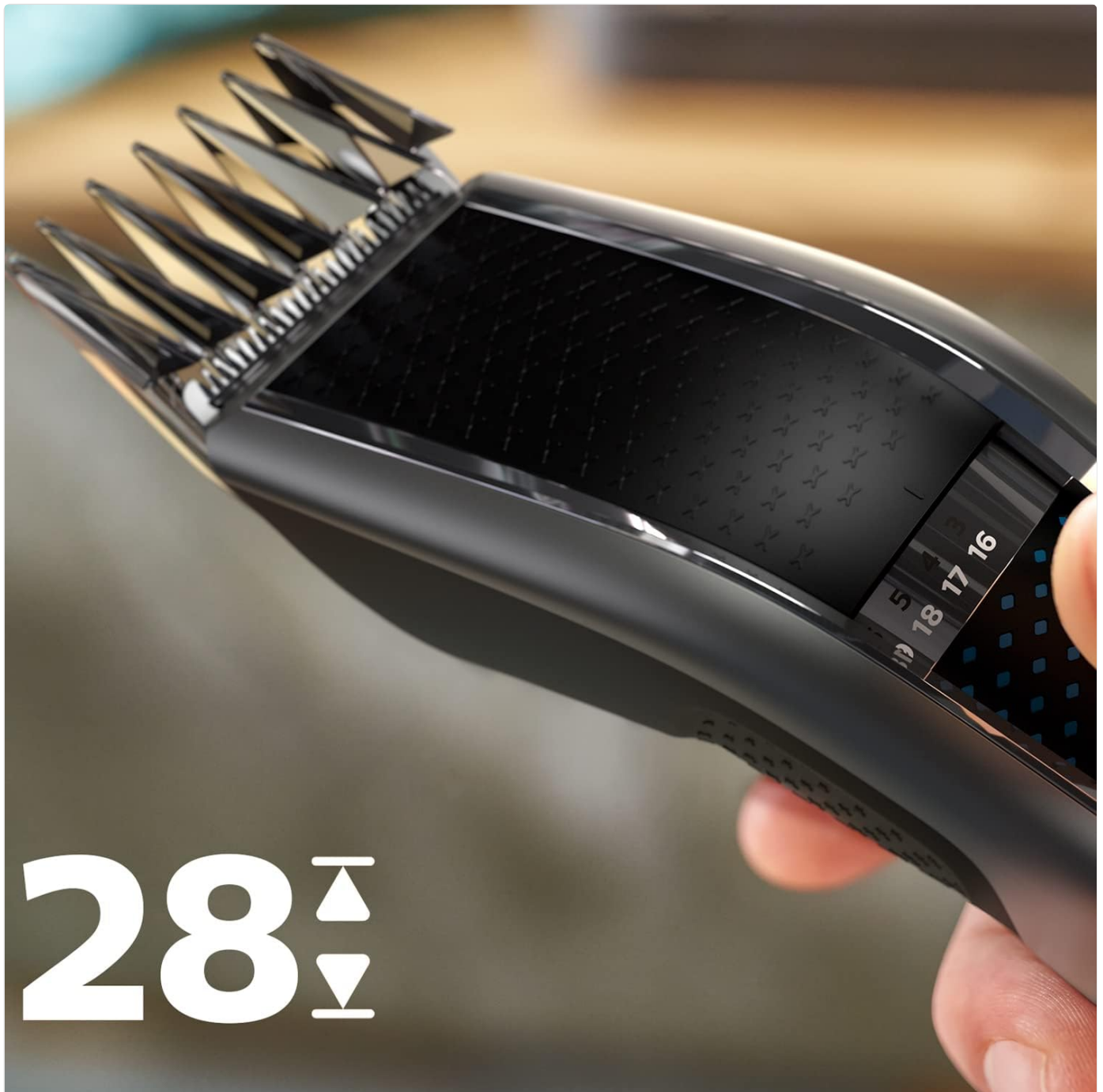
Figure 4.1: The clipper offers 28 easy-to-select length settings for precise control over your haircut.