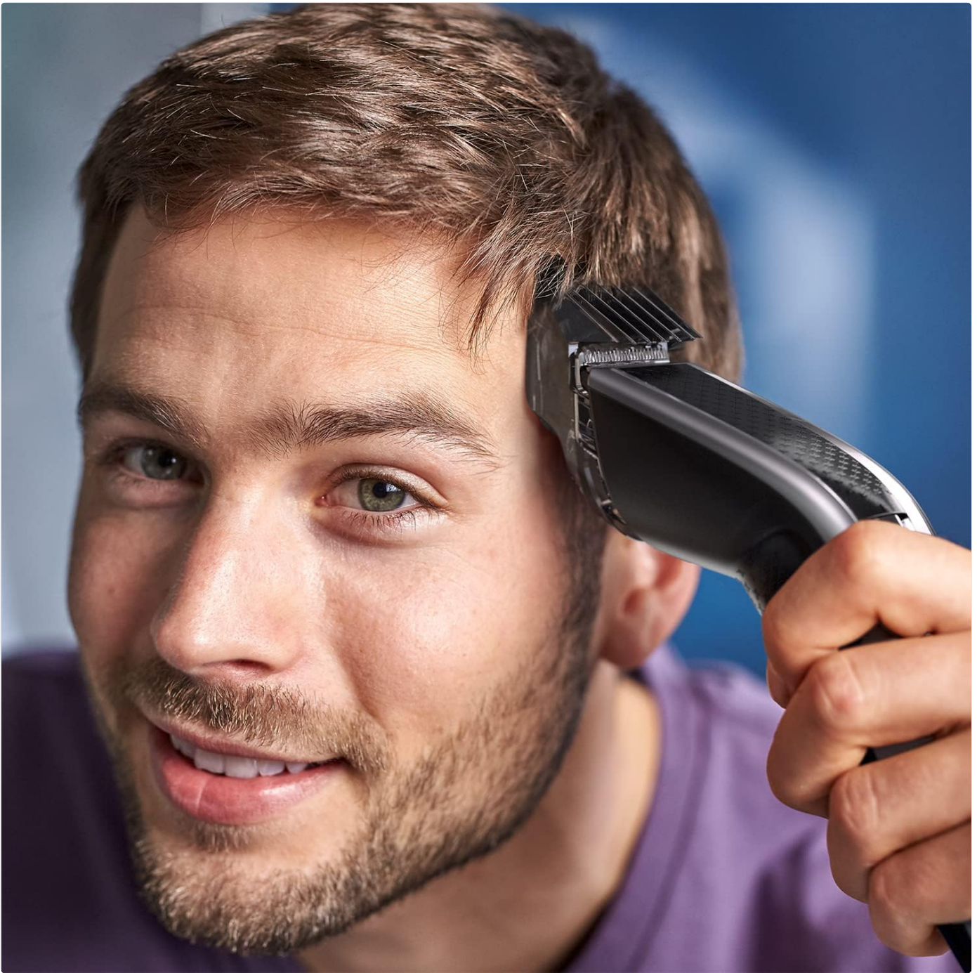
Figure 4.2: Demonstrating the use of the Philips Hairclipper for an even haircut.