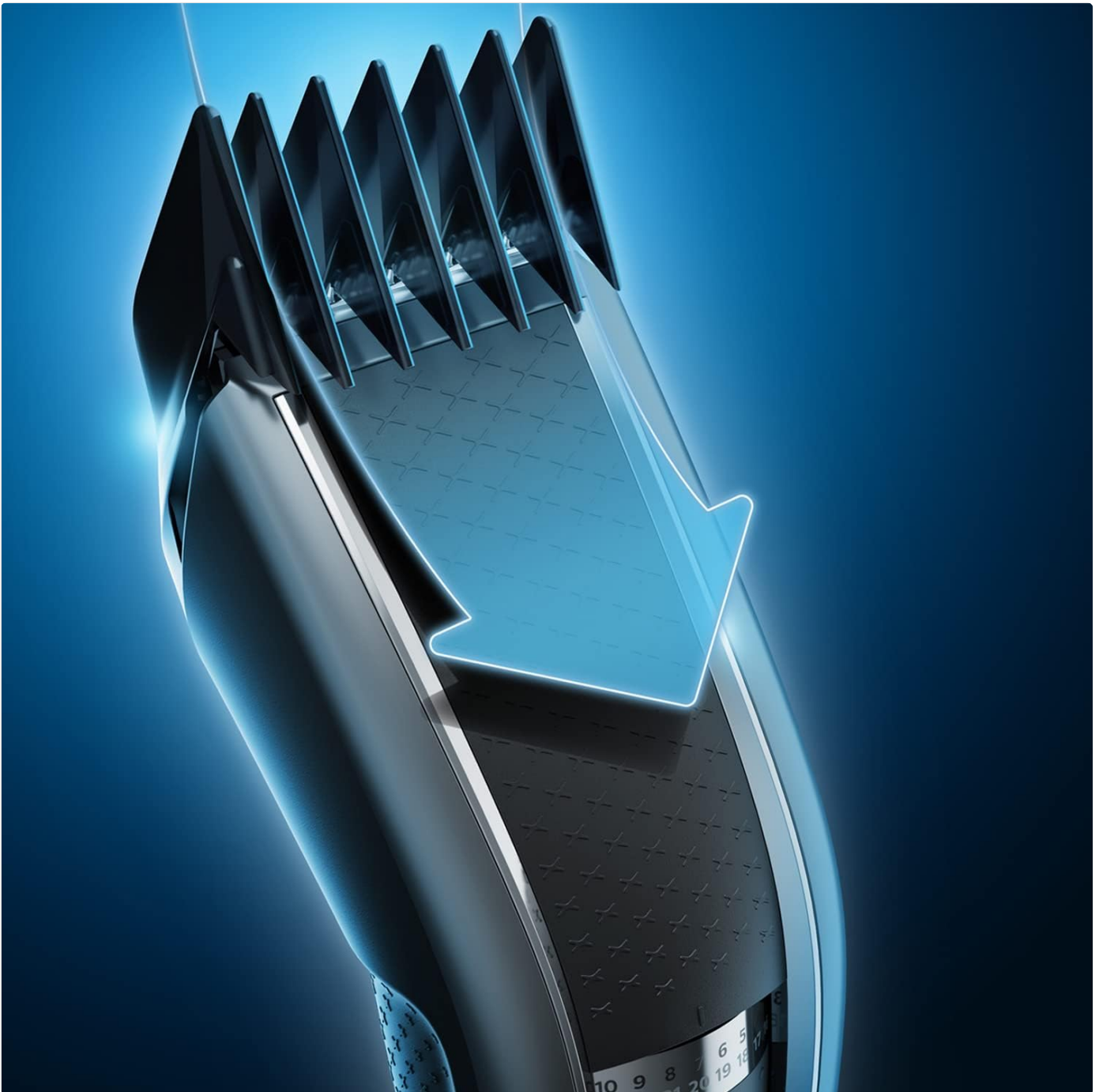
Figure 4.3: Visual representation of the Trim-n-Flow PRO technology, ensuring smooth hair flow during cutting.