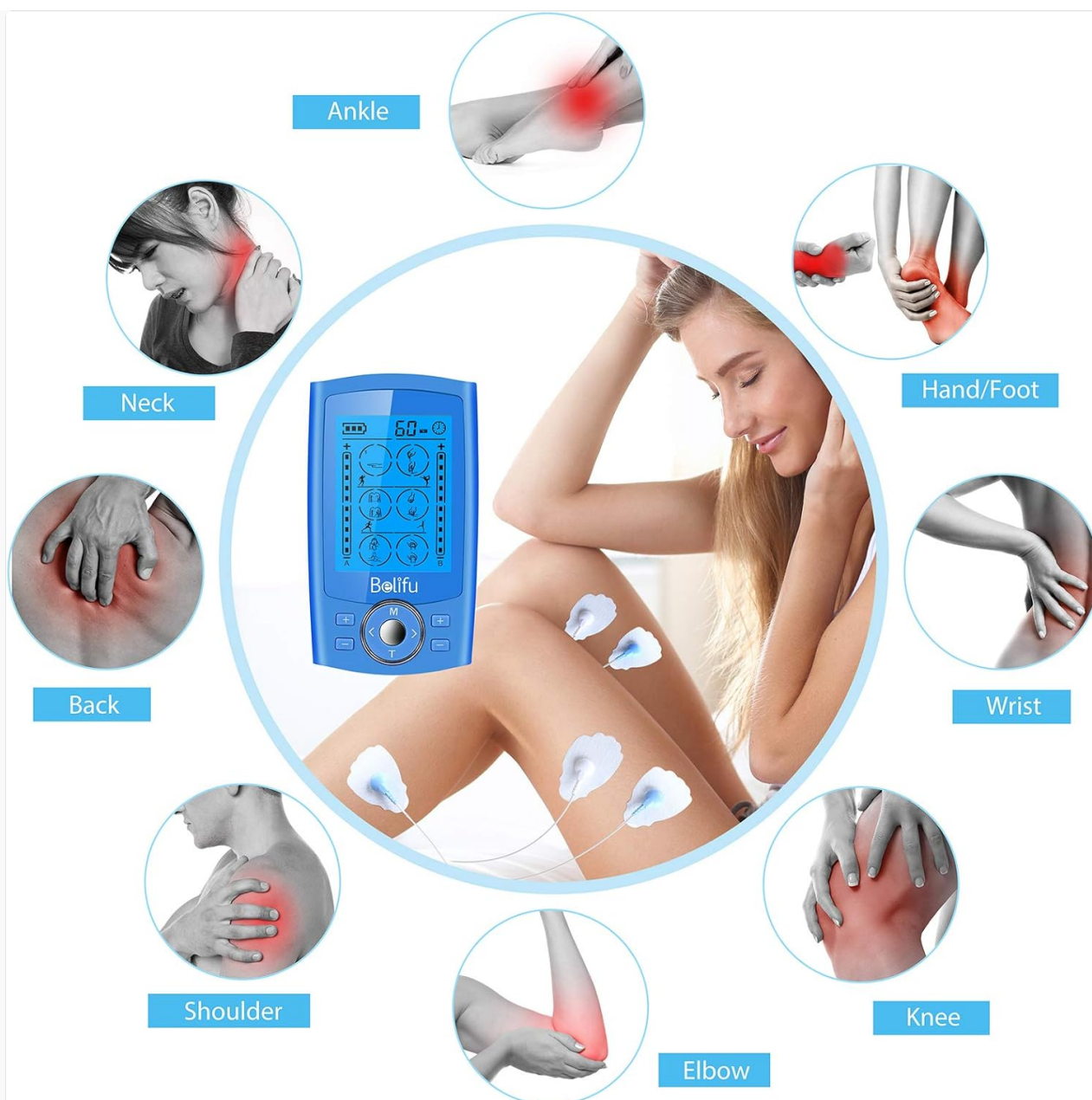
Figure 4.1: Common Electrode Pad Placement Areas.

This image illustrates various body areas where the TENS EMS unit can be applied for pain relief, including the neck, back, shoulder, elbow, knee, wrist, hand/foot, and ankle. The central image shows the device with pads attached to a person's leg.