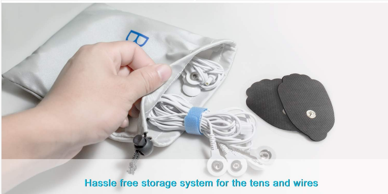
Figure 1.1: Contents of the Belifu TENS EMS Unit package.

The image displays the Belifu TENS EMS Unit, various sizes of blue electrode pads, white electrode wires, a black USB charging cable, a white drawstring storage bag with the Belifu logo, and blue fastening cable ties. All items are neatly arranged, indicating the complete package contents.