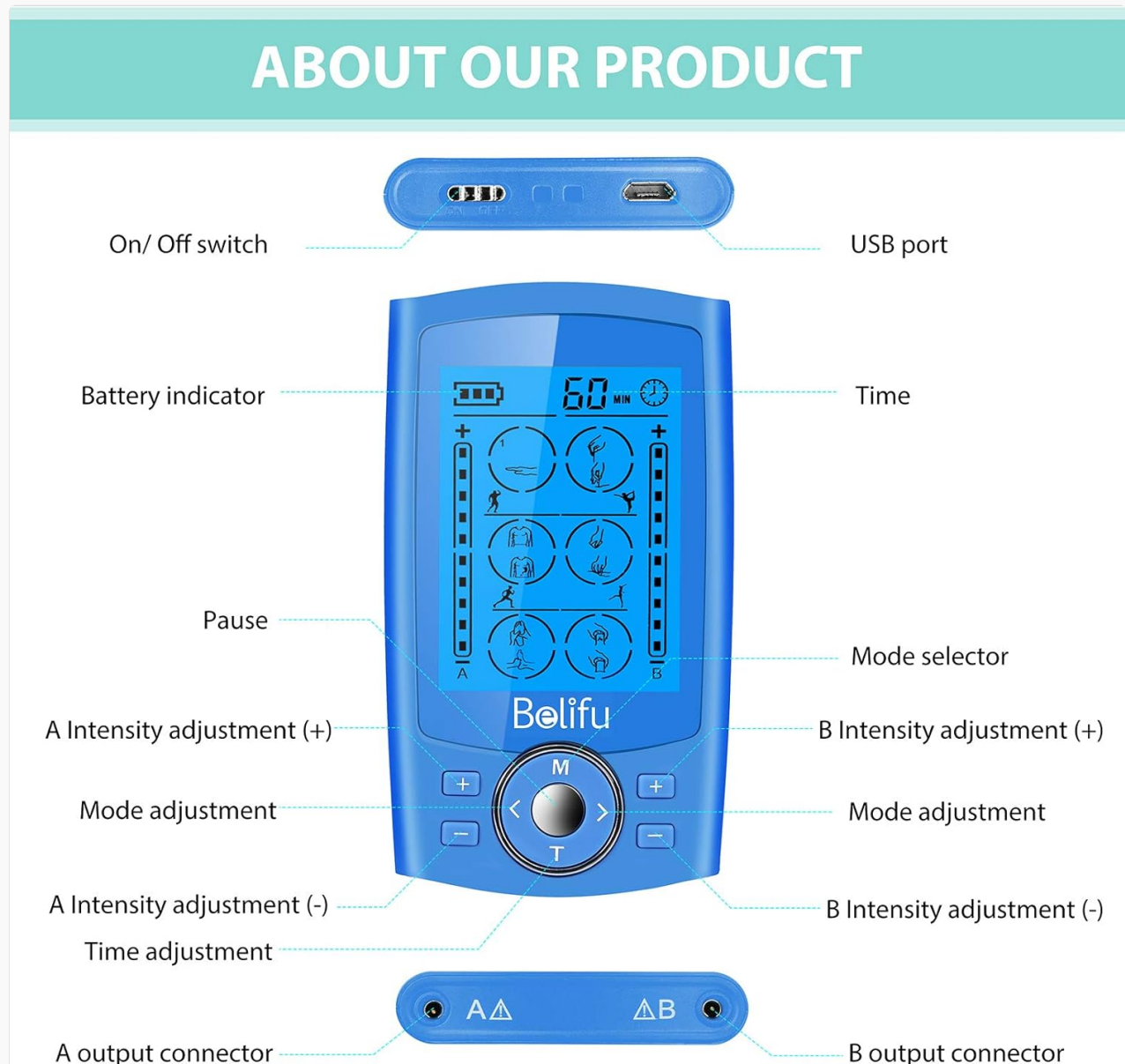
Figure 3.1: Belifu TENS EMS Unit Controls and Ports.

The Belifu TENS EMS Unit is a compact, portable device featuring dual channels and 24 pre-programmed massage modes. It is designed for ease of use with an intuitive interface.