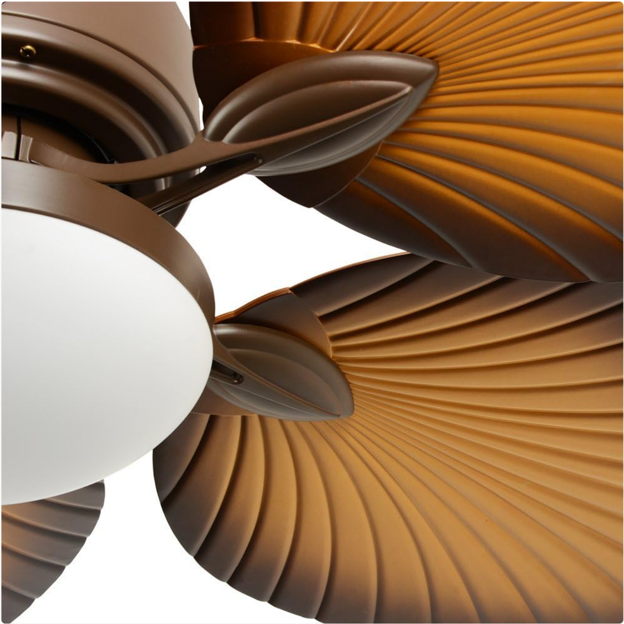
Image 7.1: Detail of the fan blades and their connection to the motor.