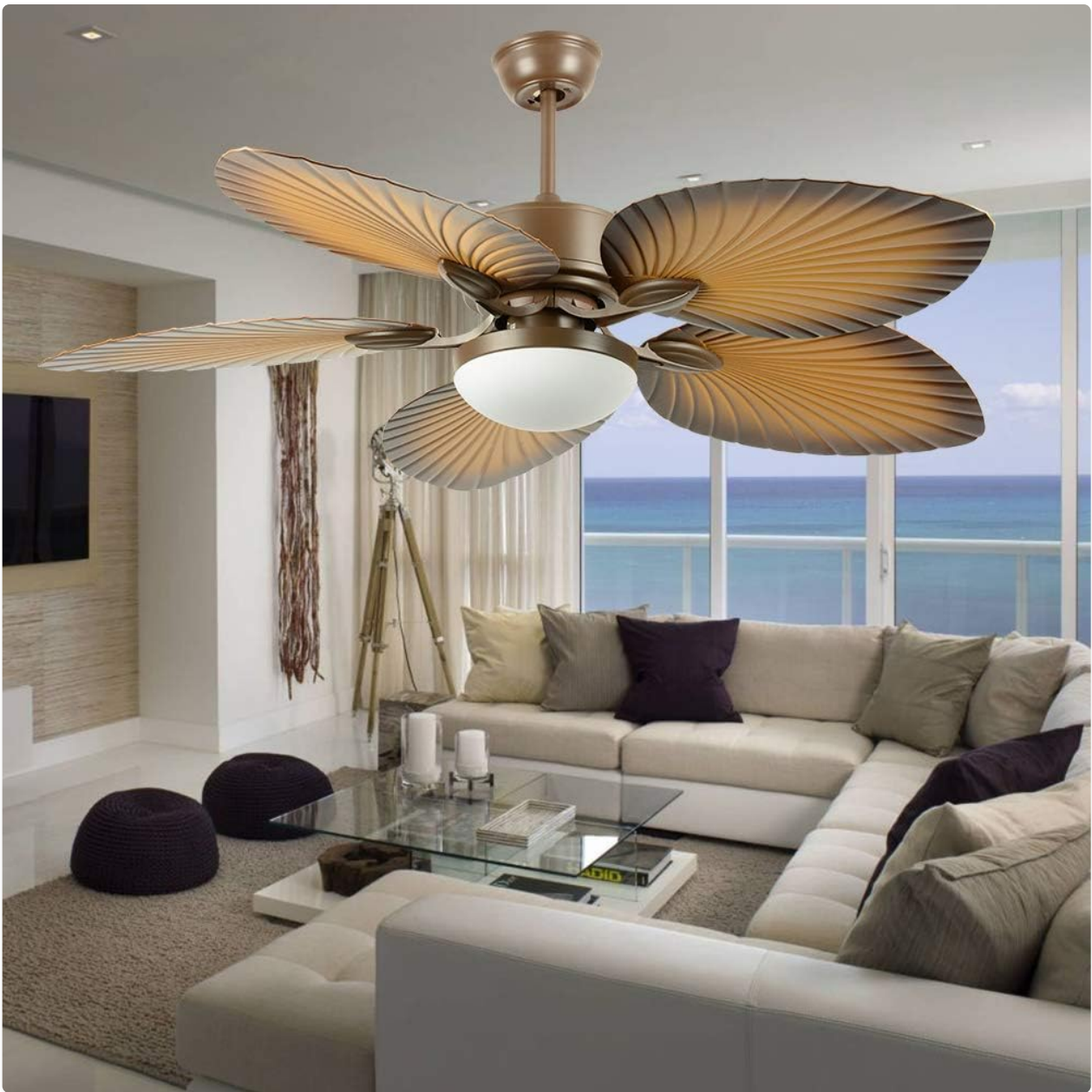
Image 1.1: The ANFERSONLIGHT 52-inch Tropical Palm Ceiling Fan in a living room setting.