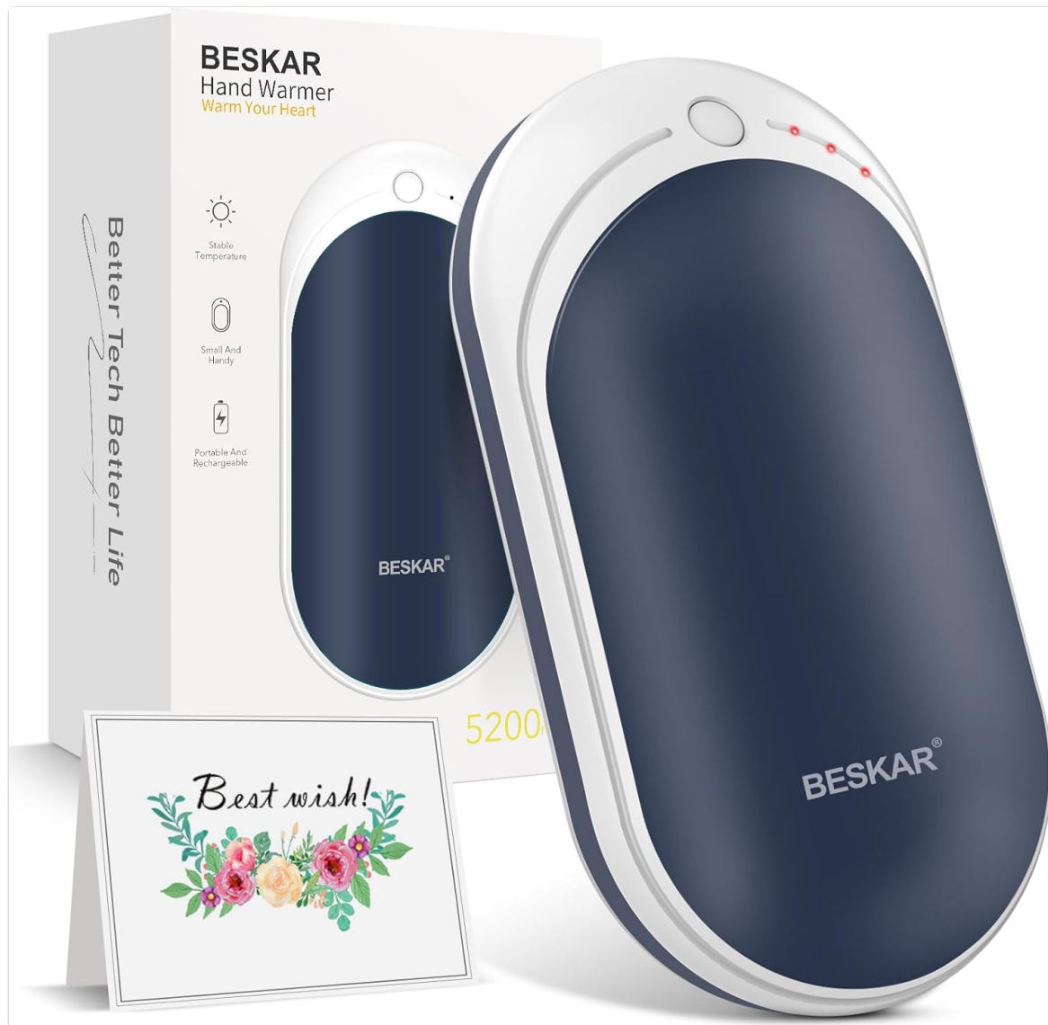
Image: The BESKAR Rechargeable Hand Warmer shown with its retail packaging and a 'Best Wish!' card.