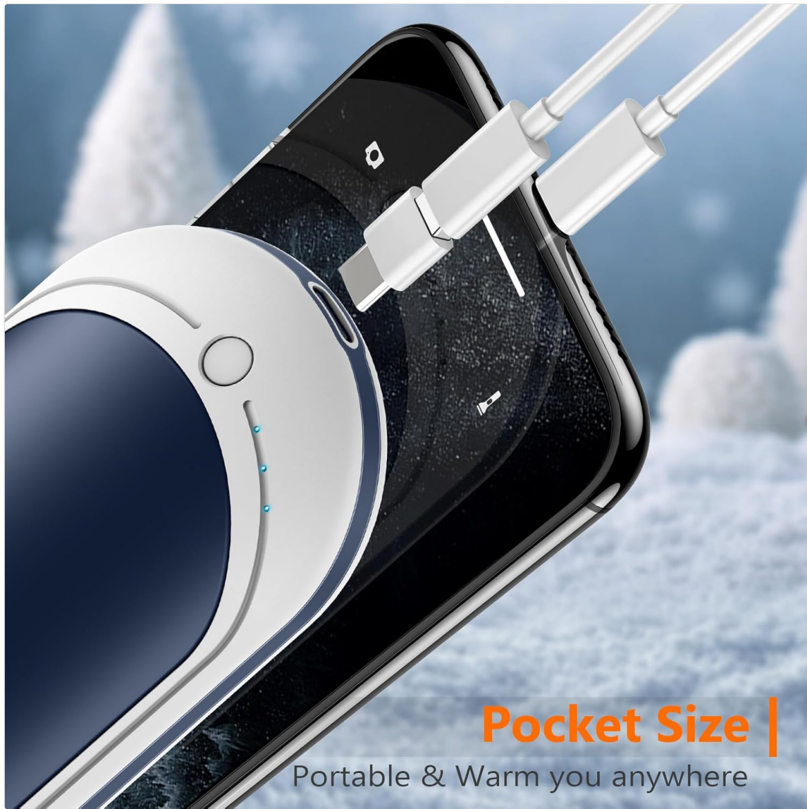
Image: The hand warmer connected to a smartphone via a USB cable, demonstrating its power bank functionality.