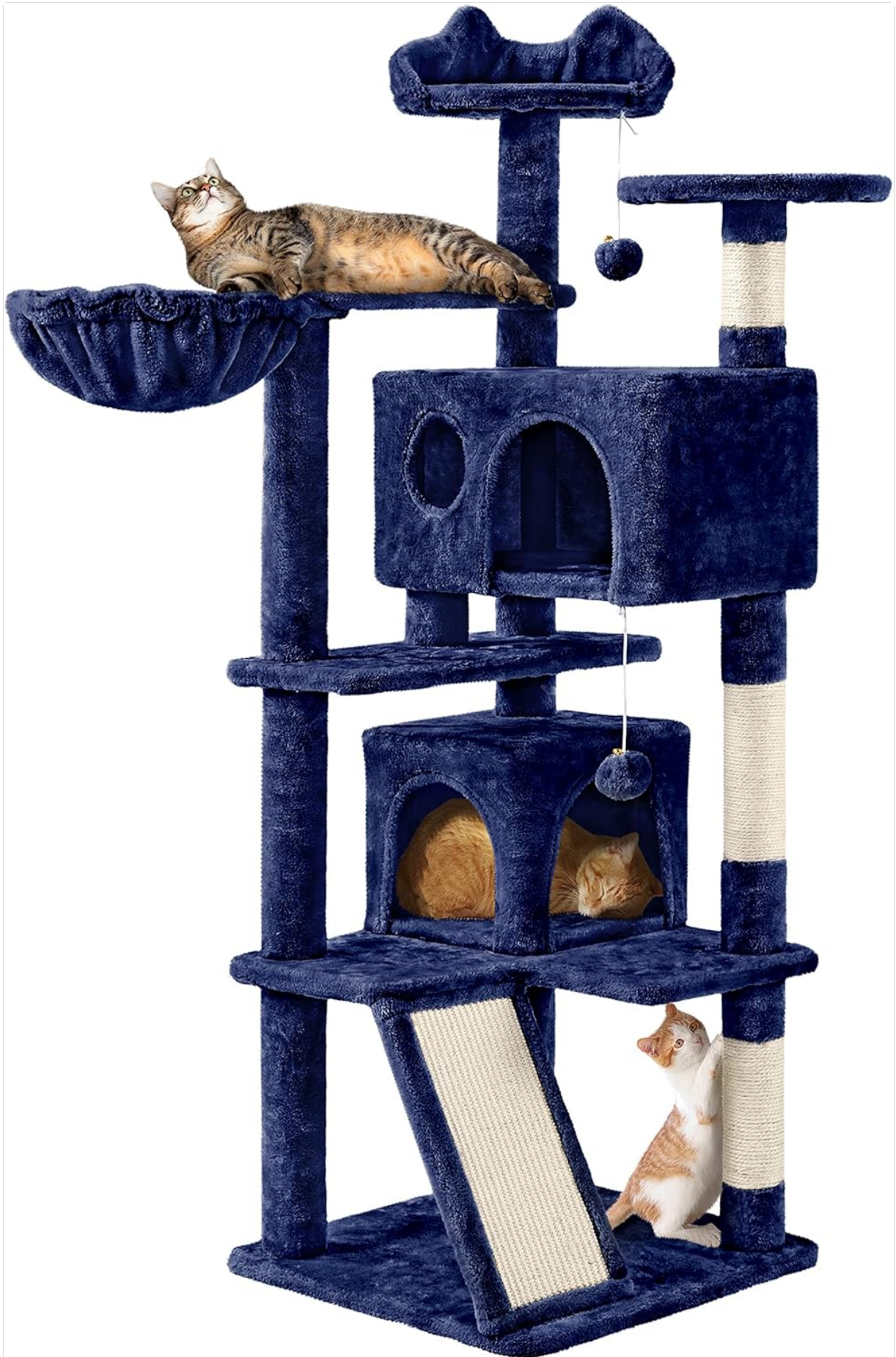
Fully assembled Topeakmart 57-inch Cat Tree Tower in Navy Blue, featuring multiple levels, two condos, a basket, and scratching posts, with cats interacting.