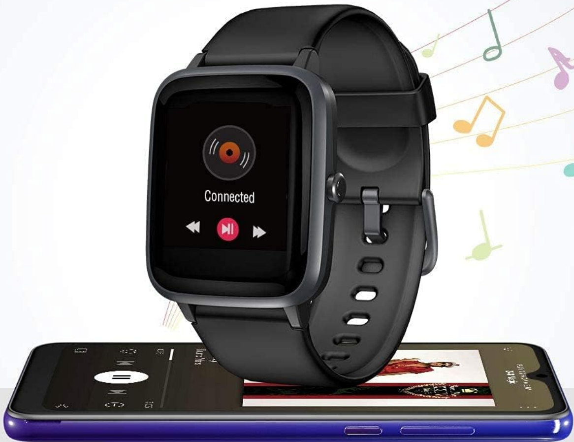
Image: The Blackview R30 Smartwatch screen showing a music control interface with play/pause and skip buttons. A smartphone is positioned below the watch, indicating the watch's ability to control music playback on the phone.