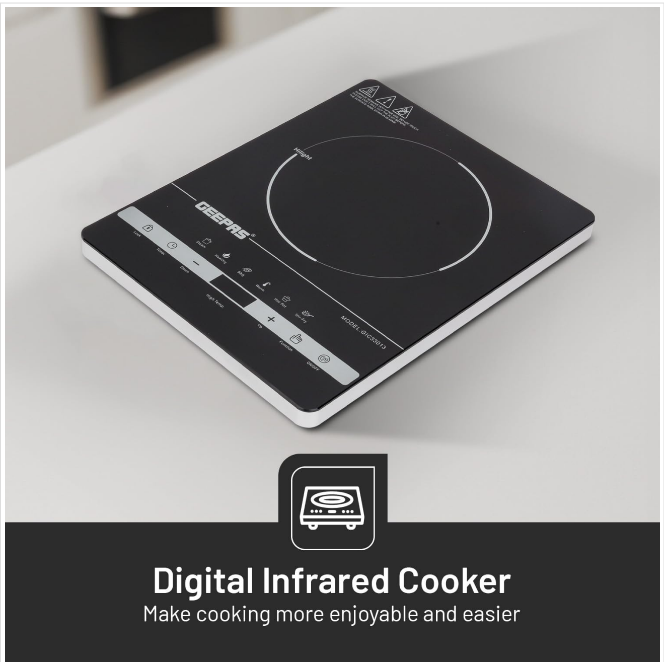
Image 1.1: Angled view of the Geepas GIC33013 Digital Infrared Cooker.