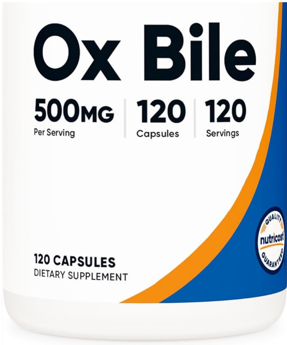
Front view of the Nutricost Ox Bile 500mg bottle, showing the brand, product name, dosage, and capsule count.