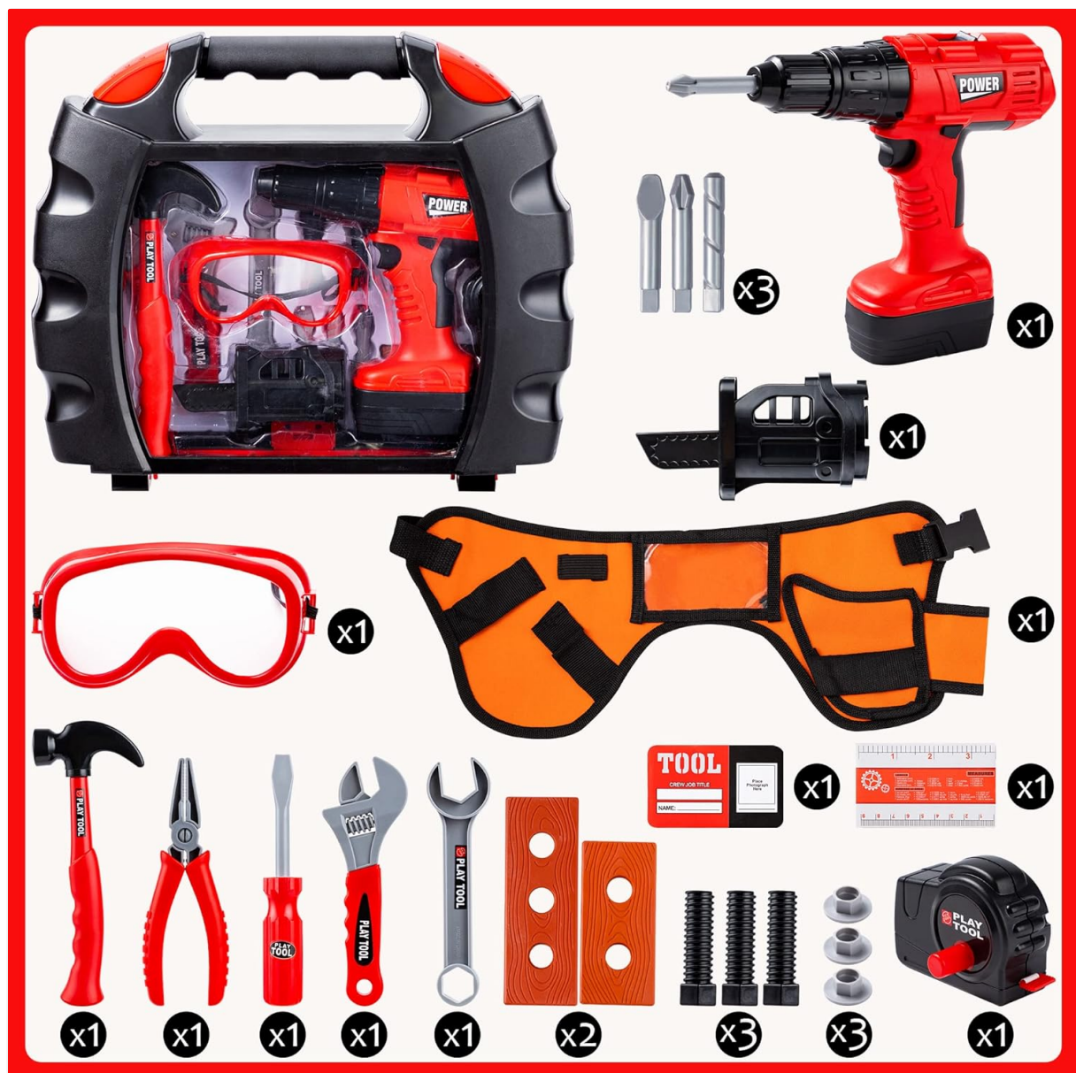
Figure 1: Contents of the JOYIN 24-Piece Kids Construction Tool Set.