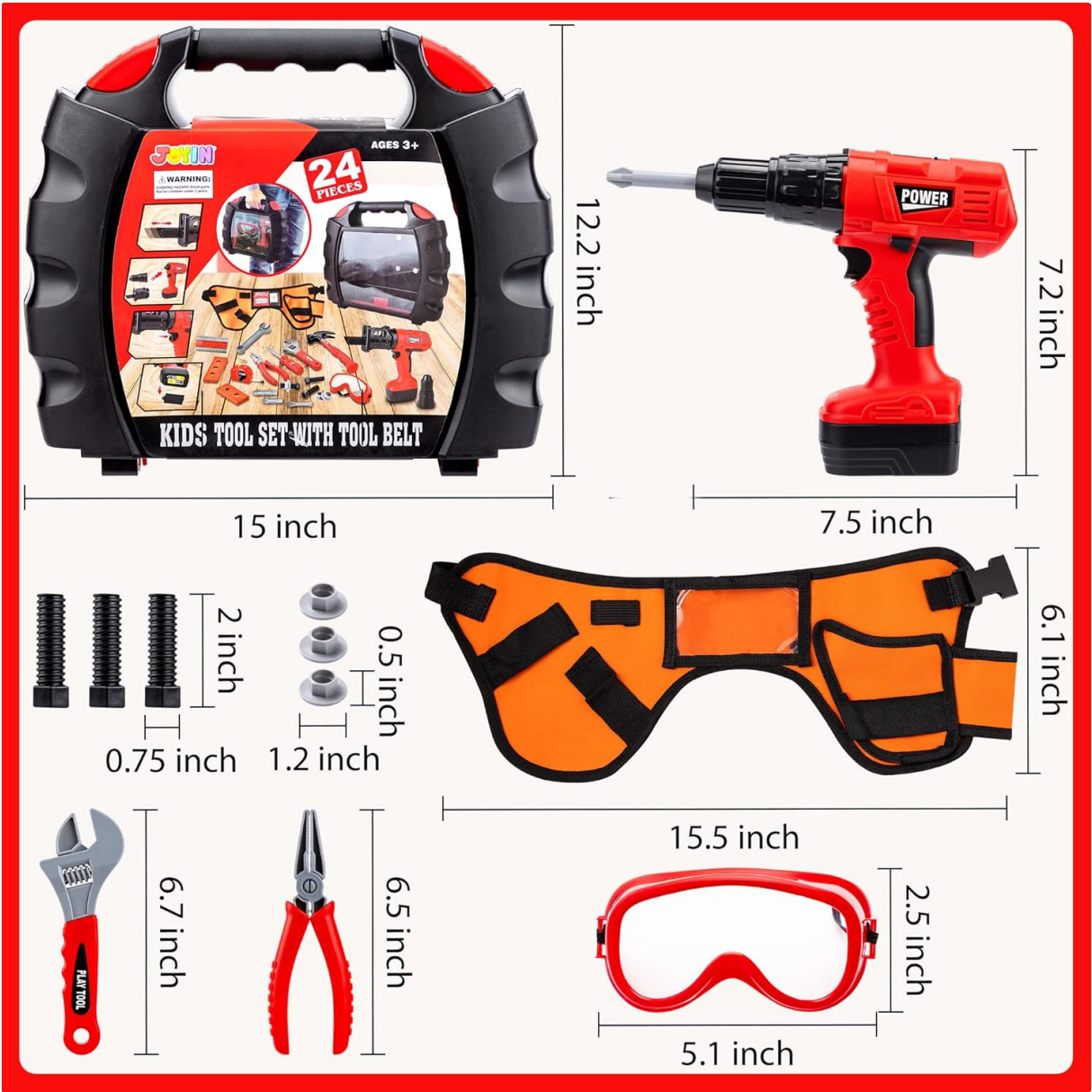
Figure 7: Product dimensions for key components.