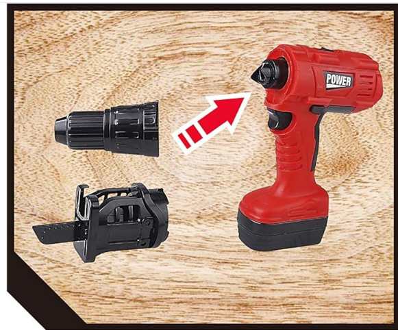
Replaceable Drill Chunk