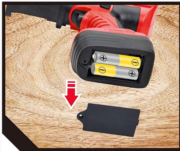
Operated by 2 AA Batteries