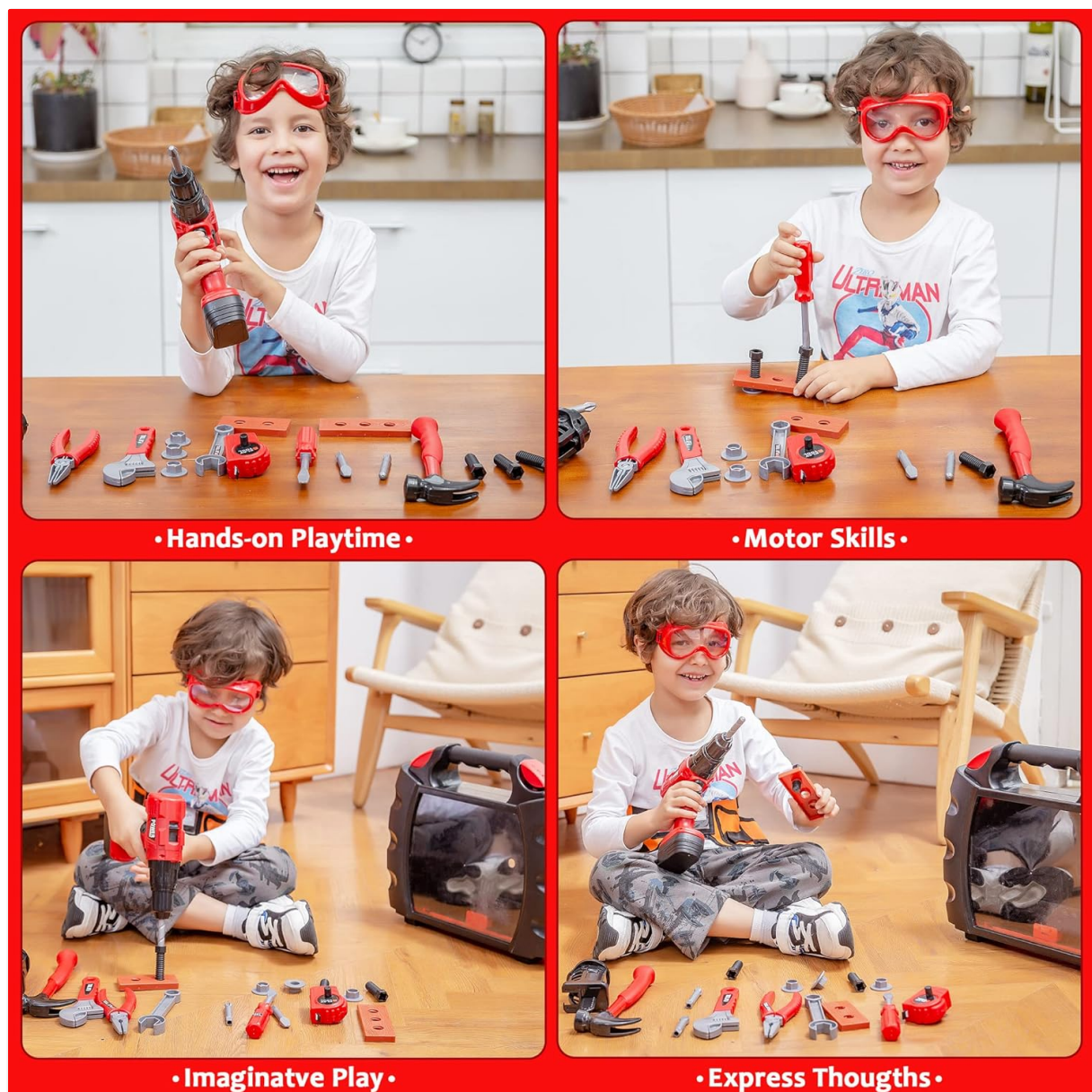
Figure 5: Child engaging in hands-on playtime with the tool set.