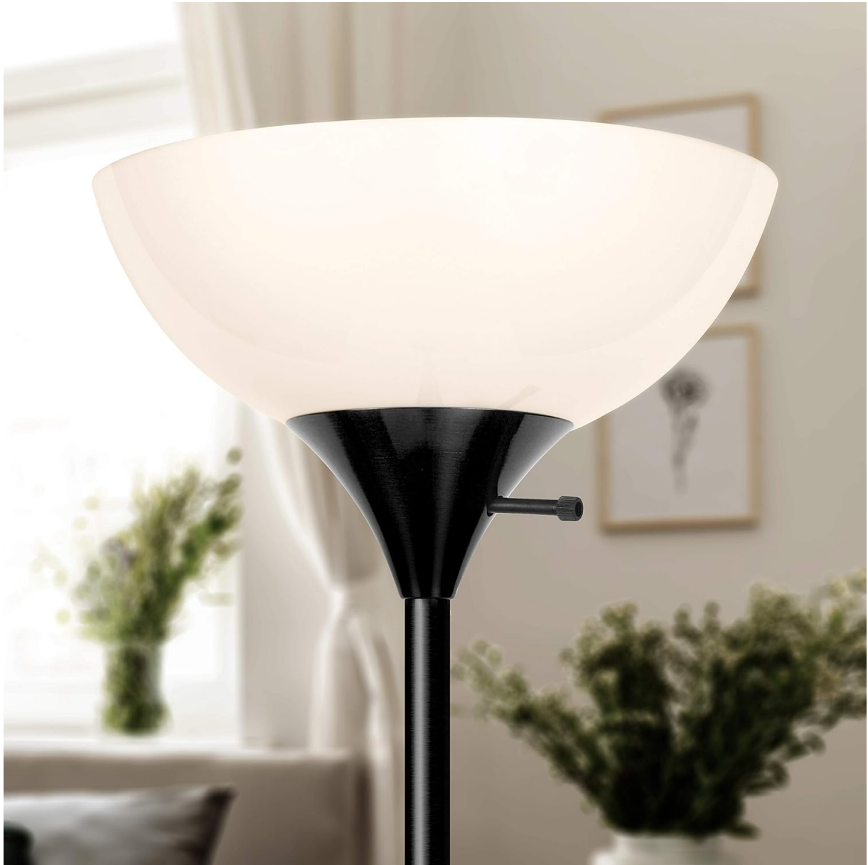
Image: A detailed view of the rotary dimmer switch located on the lamp head for easy brightness adjustment. See the dimmer function in action:

Video: A short clip demonstrating the 3-way dimmable feature of the floor lamp.