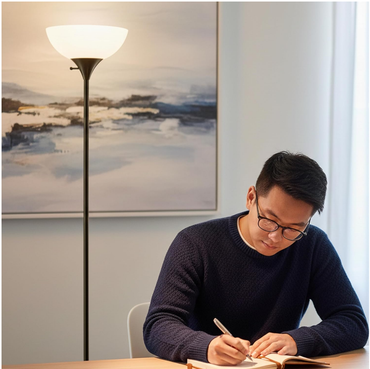
Image: The Brightech Sky Dome Dimmable LED Floor Lamp in Jet Black, showcasing its sleek design and upward-facing light.