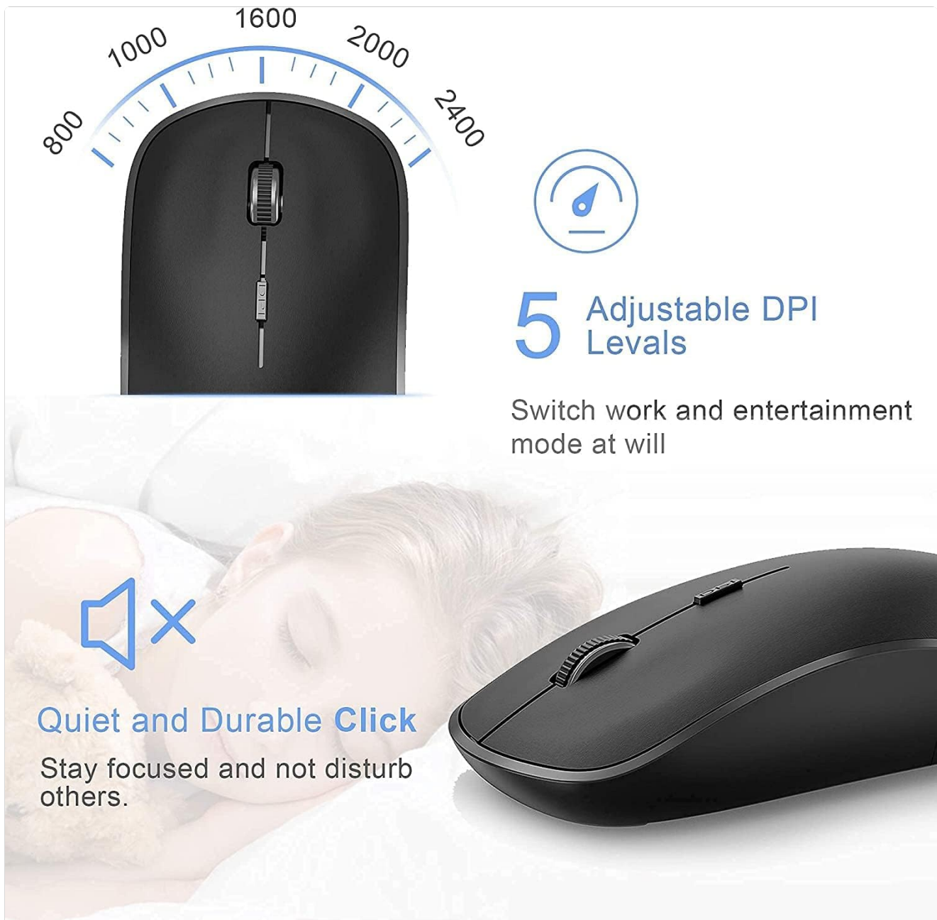
Figure 4: Adjust mouse sensitivity with 5 DPI levels for optimal performance in various applications.