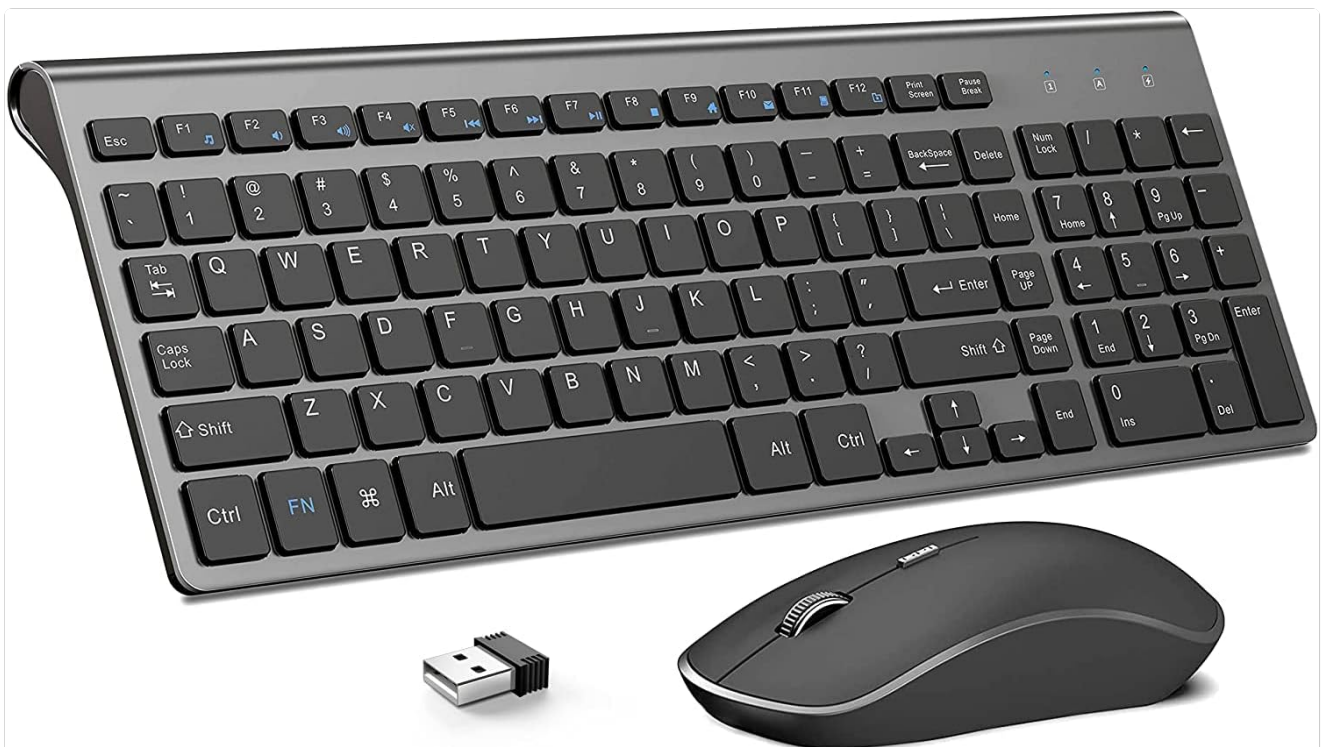
Figure 1: JOYACCESS Wireless Keyboard and Mouse Combo (Black Grey)

The JOYACCESS Wireless Keyboard and Mouse Combo (Model: JA-CB2BK) offers an ergonomic, slim, and efficient solution for your computing needs. Designed for comfort and convenience, this combo features a stable 2.4G wireless connection, adjustable DPI settings for the mouse, and energy-saving auto-sleep functions. Its sleek design and quiet operation make it ideal for various environments, from office to home use.