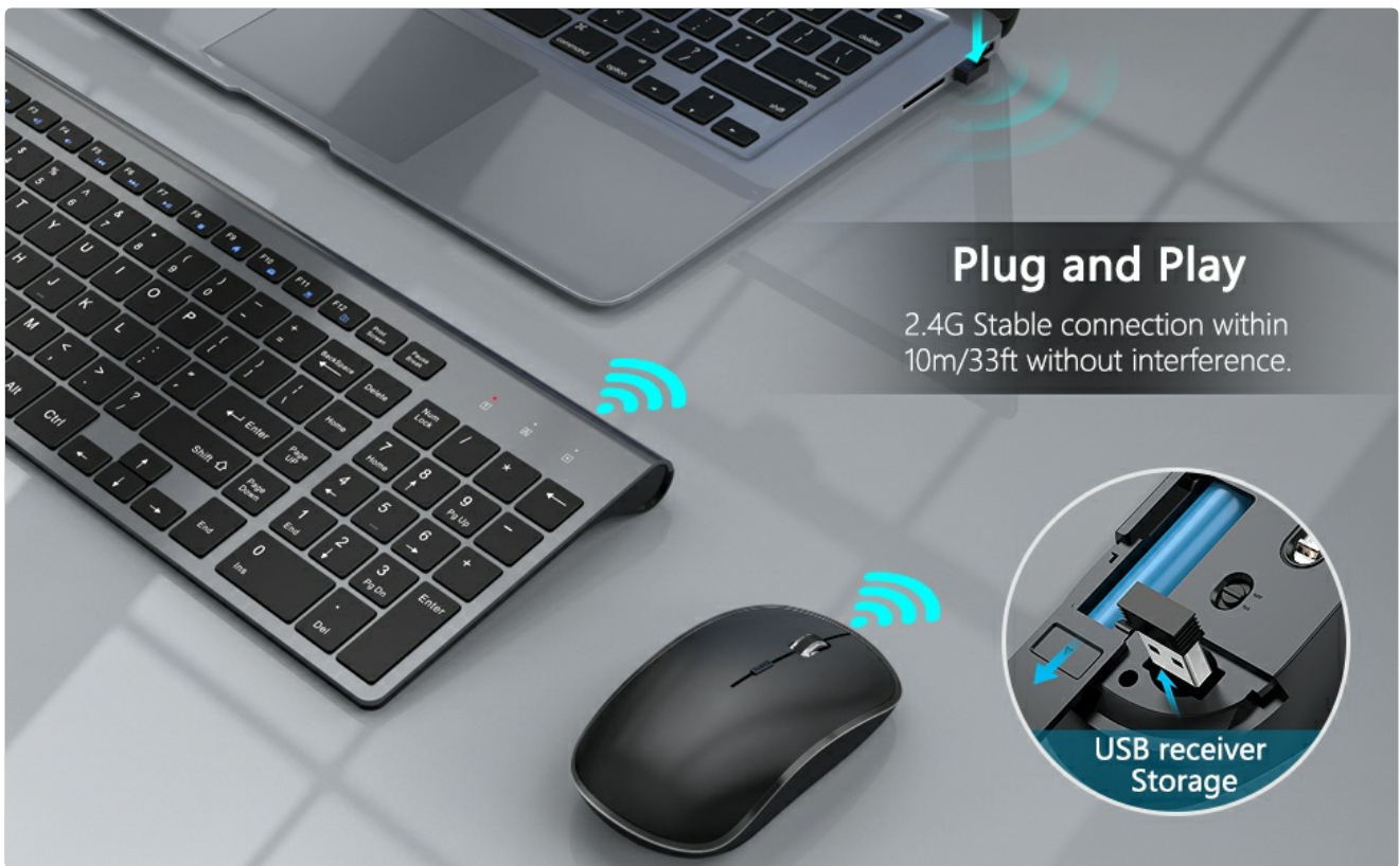
Figure 3: The single nano receiver is stored within the mouse for convenience and frees up USB ports.