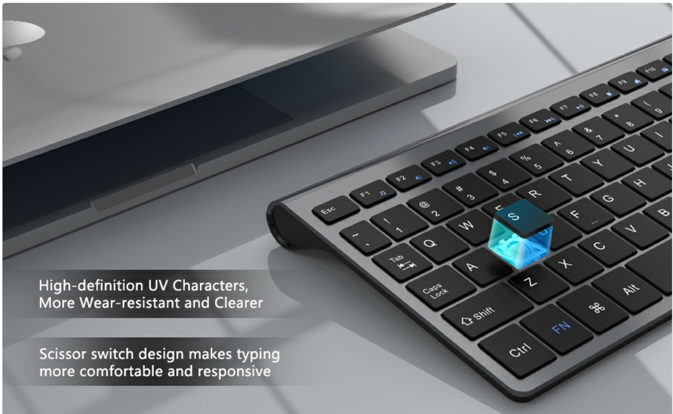
Figure 8: High-definition UV characters ensure durability and clarity of key labels.