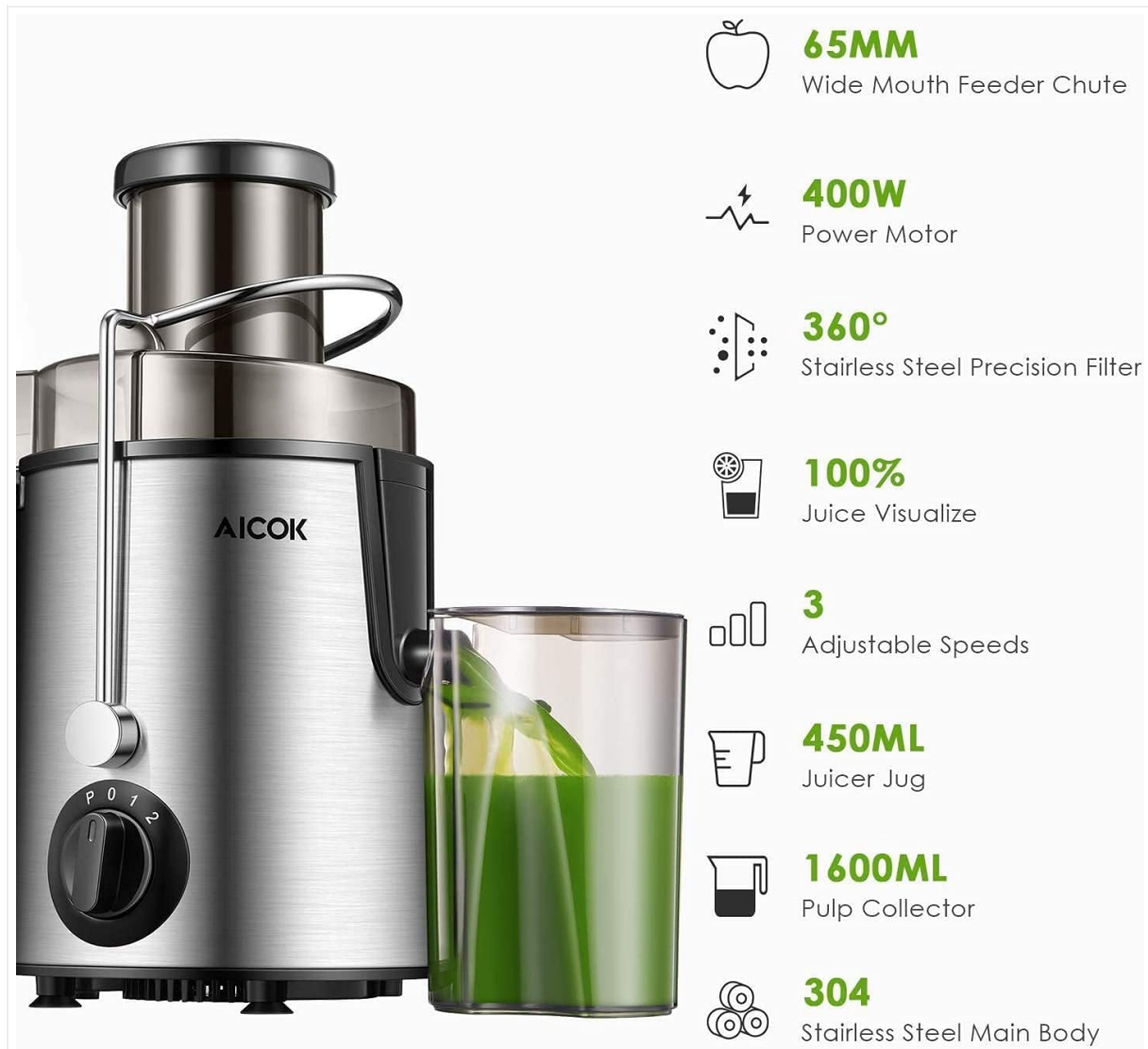
Image: A detailed diagram of the AICOK Centrifugal Juicer highlighting its key features: 65mm Wide Mouth Feeder Chute, 400W Power Motor, 360° Stainless Steel Precision Filter, 100% Juice Visualize, 3 Adjustable Speeds, 450ML Juicer Jug, 1600ML Pulp Collector, and 304 Stainless Steel construction.

Familiarize yourself with the components of your AICOK Centrifugal Juicer: