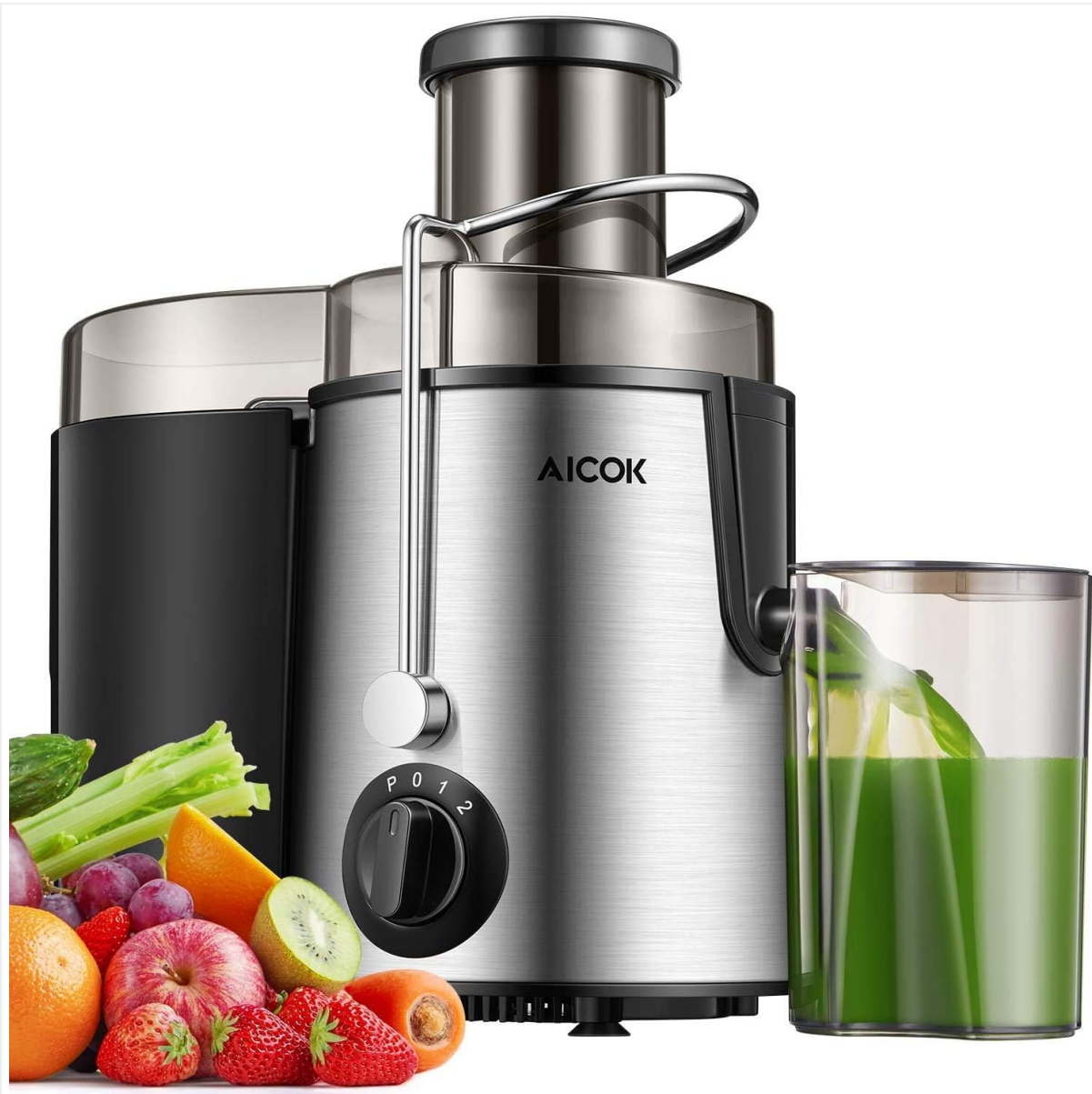
Image: The AICOK Centrifugal Juicer, a sleek stainless steel appliance, is shown alongside a vibrant assortment of fresh fruits and vegetables, and a glass of green juice, highlighting its purpose.