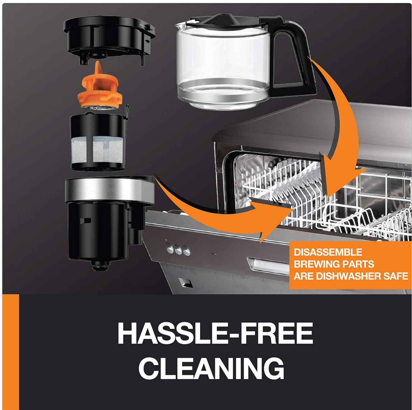
Figure 6: Illustrates how the brewing parts can be disassembled for easy cleaning, with many parts being dishwasher safe.