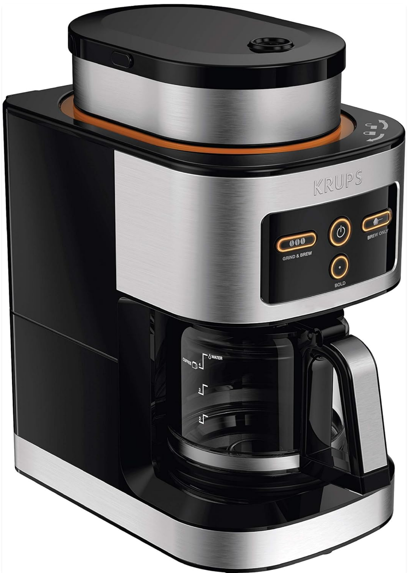
Figure 1: KRUPS KM550D50 Personal Café Grind Drip Maker Coffee Grinder.