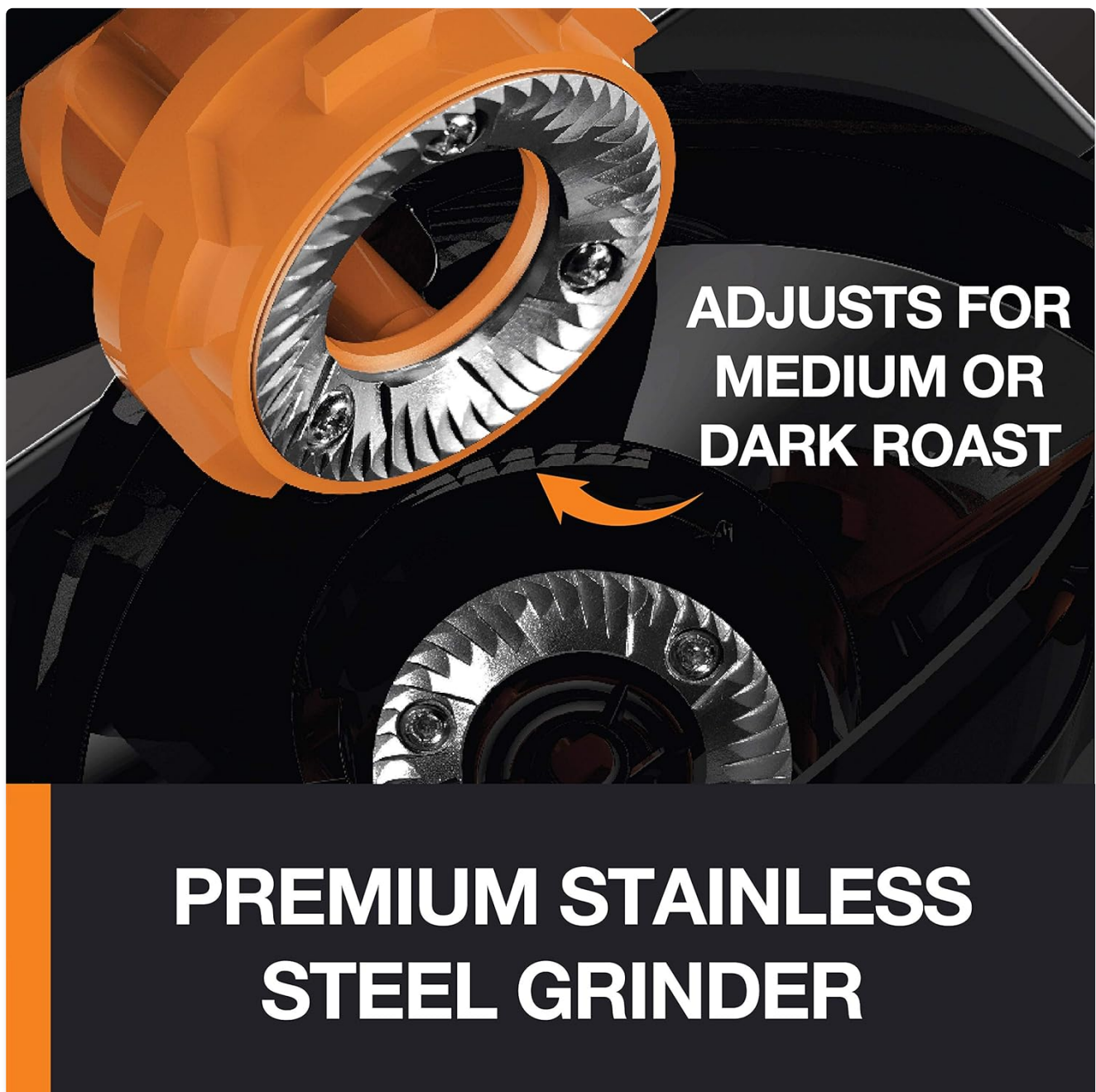
Figure 3: Close-up view of the premium stainless steel burr grinder, which adjusts for medium or dark roasts.