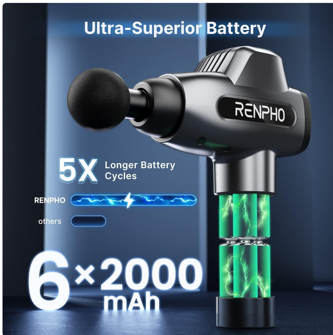
Image: A visual representation of the massage gun's internal battery structure, indicating 6x2000 mAh cells for superior battery cycles.