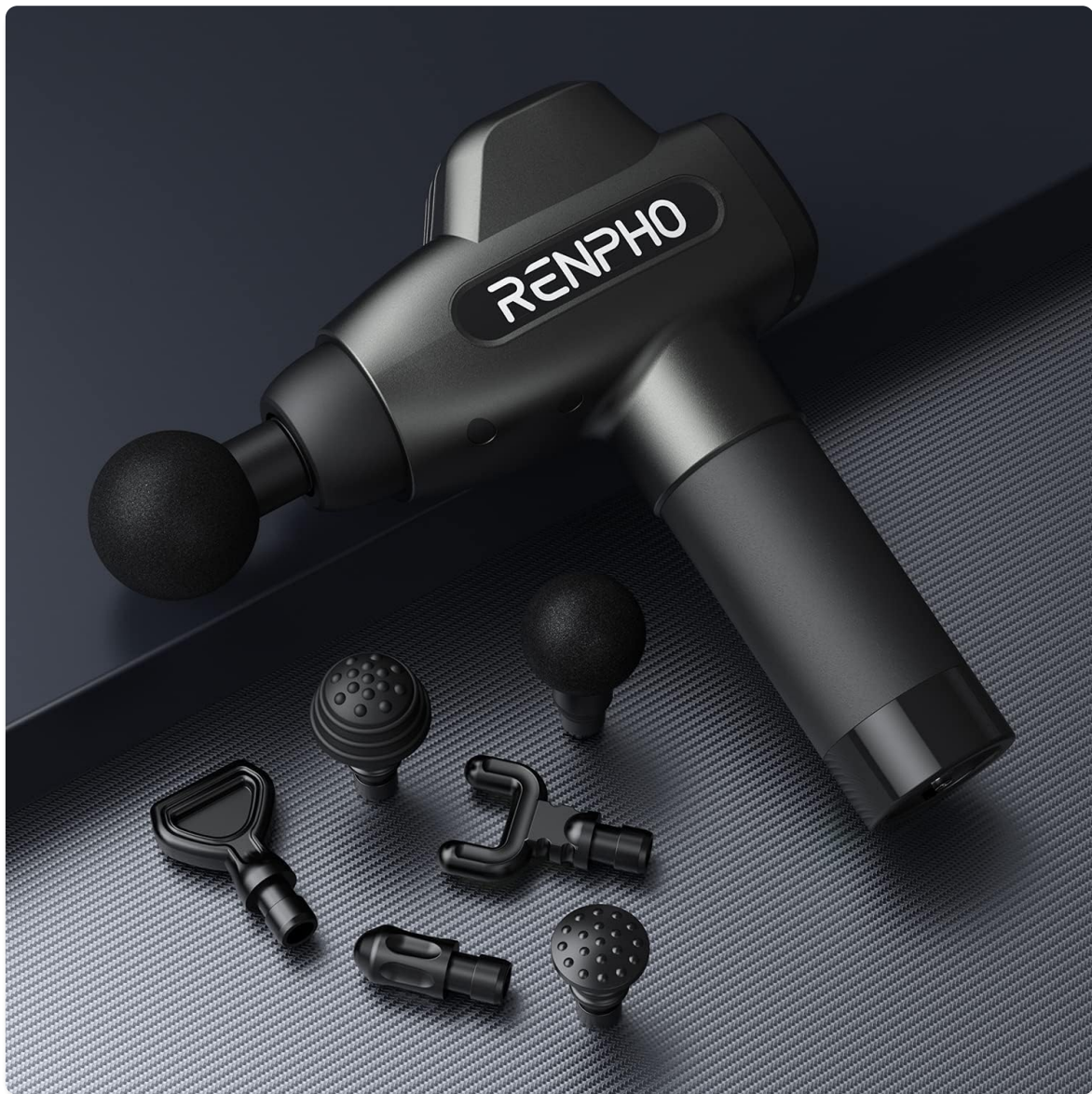
Image: A display of six different massage heads, each with a description of its intended use for various body parts and massage techniques.