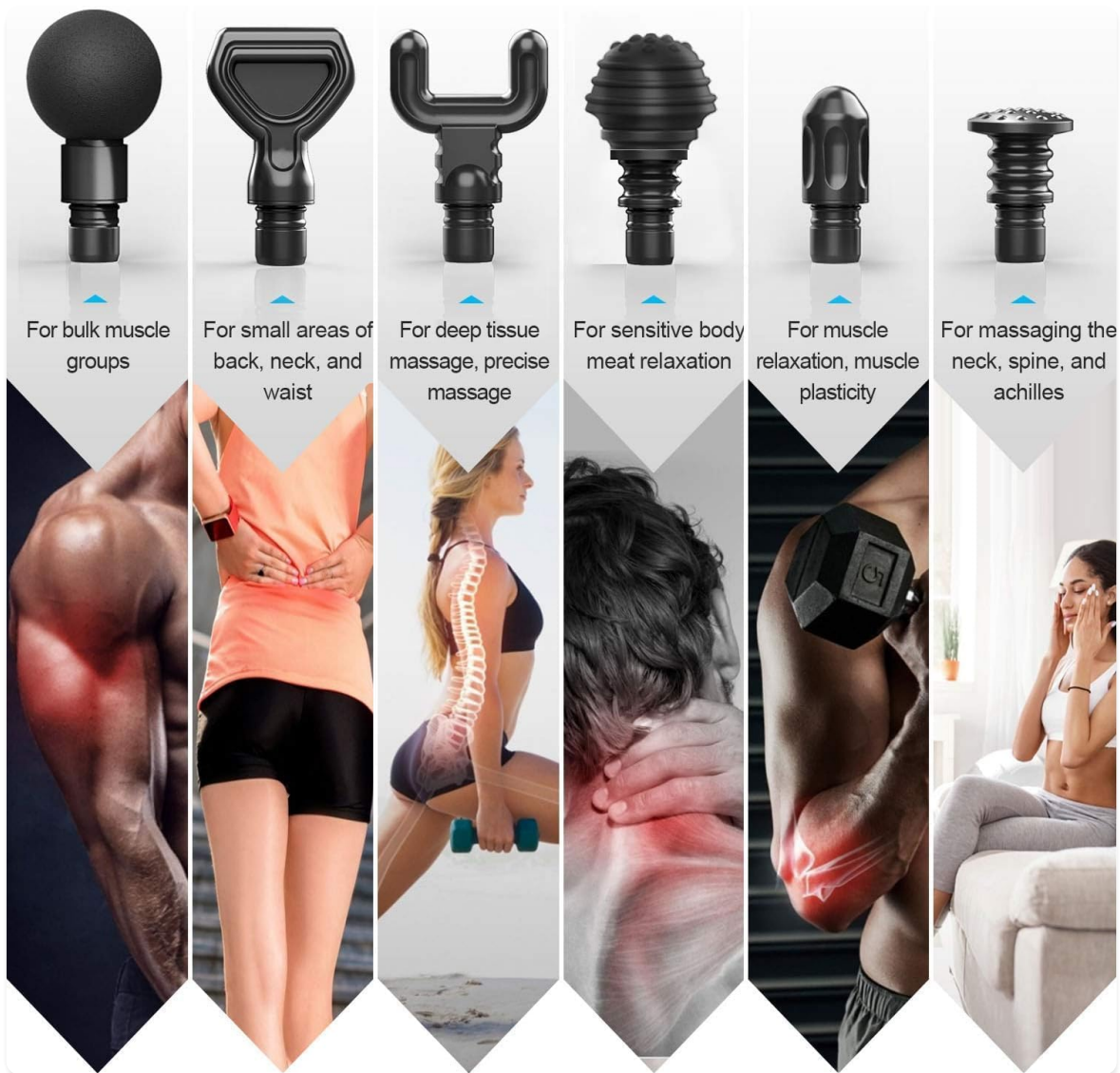
Image: A collage showing various individuals using the massage gun for pre-workout warm-up, post-workout recovery, and general muscle relief.