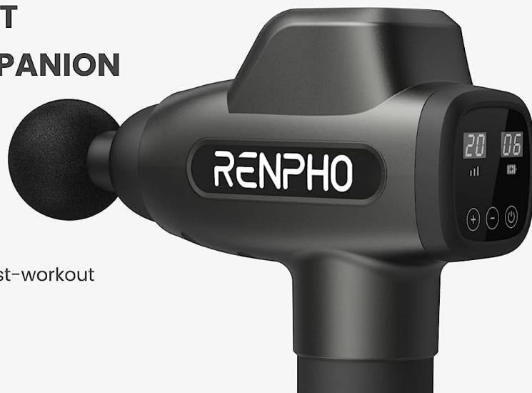
Image: A visual comparison demonstrating the percussion force of the RENPHO C3 (60lbs) versus other massage guns (10-30lbs).