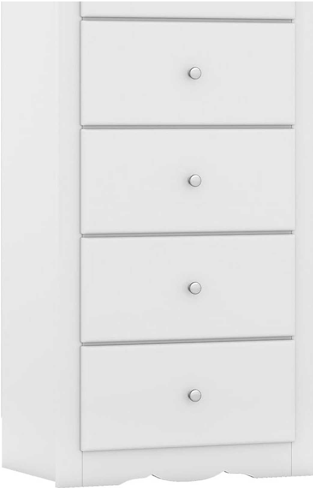
Image: Front view of the Giantex 6-Drawer Dresser in white, showcasing its six drawers with metal handles.