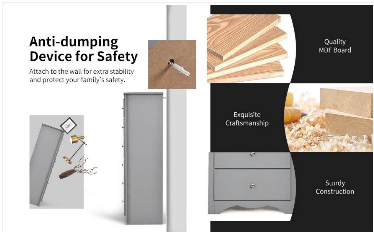
Image: Illustration demonstrating the installation of the anti-toppling device to secure the dresser to a wall, enhancing safety and stability.