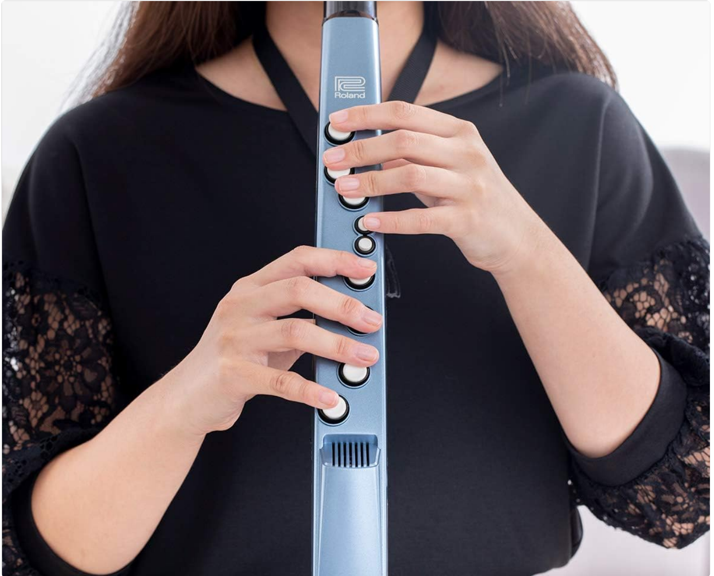
Figure 2: Proper holding and fingering technique for the Aerophone Mini.