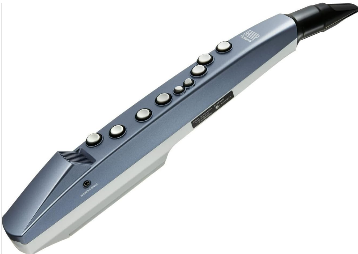
Figure 1: The Roland AE-01 Aerophone Mini.