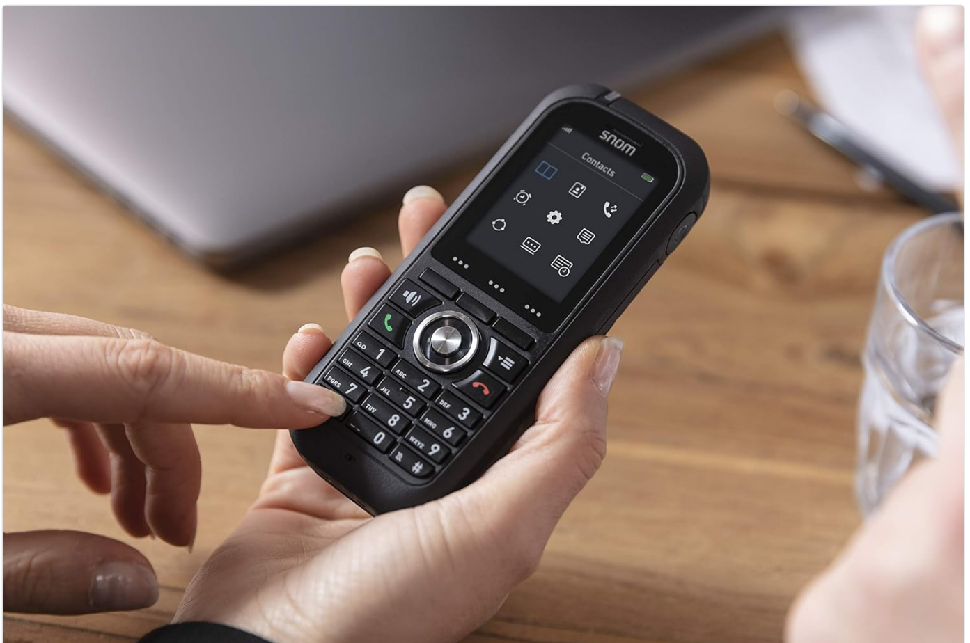
Image: A person holding and interacting with the Snom M80 handset, demonstrating its ergonomic design during use.