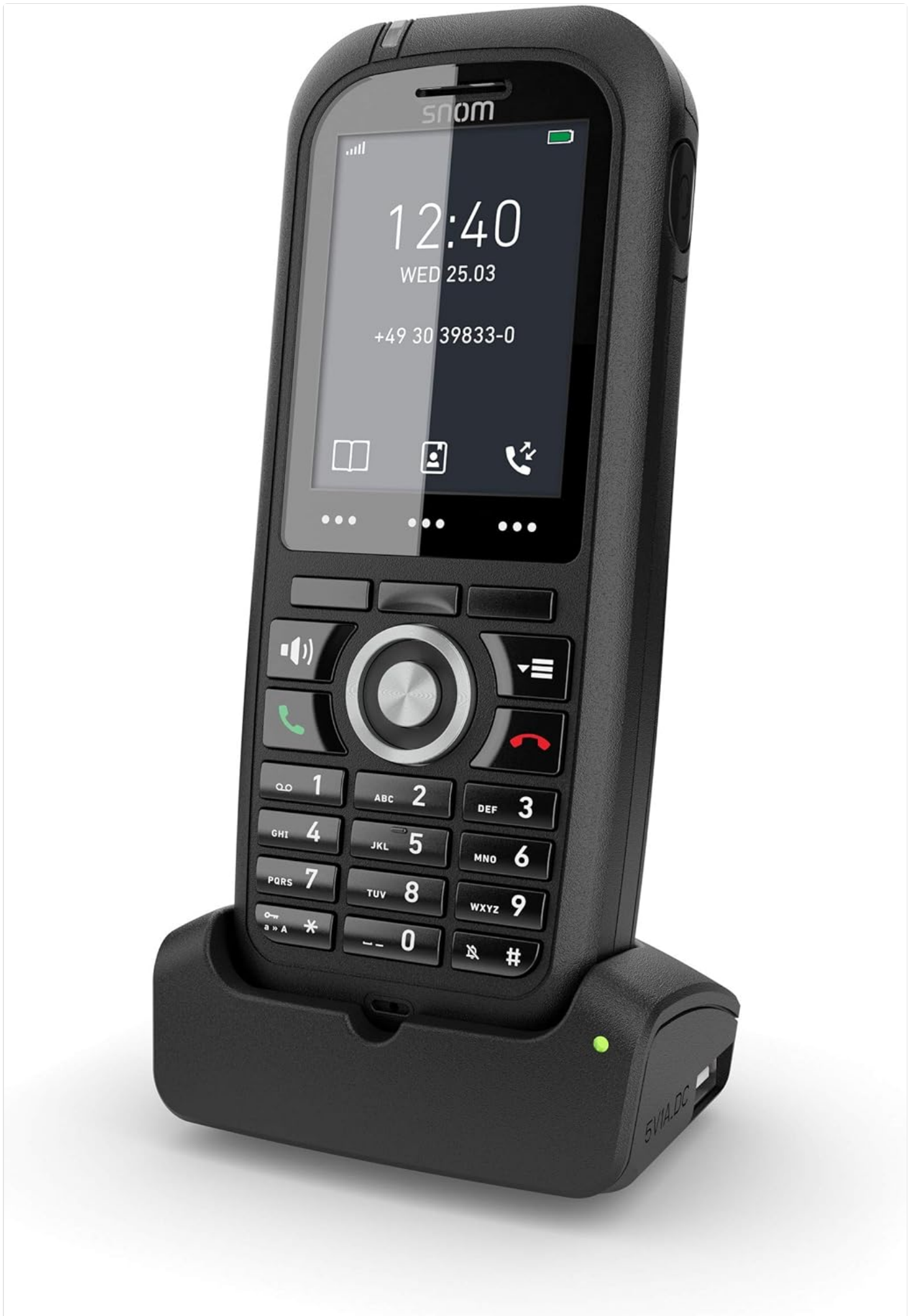
Image: The Snom M80 handset placed in its charging cradle, shown from front and side views, indicating proper charging position.