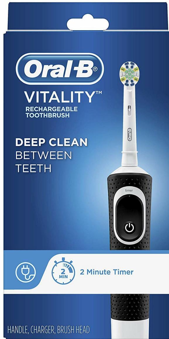
Oral-B Vitality FlossAction Electric Toothbrush in its retail packaging.