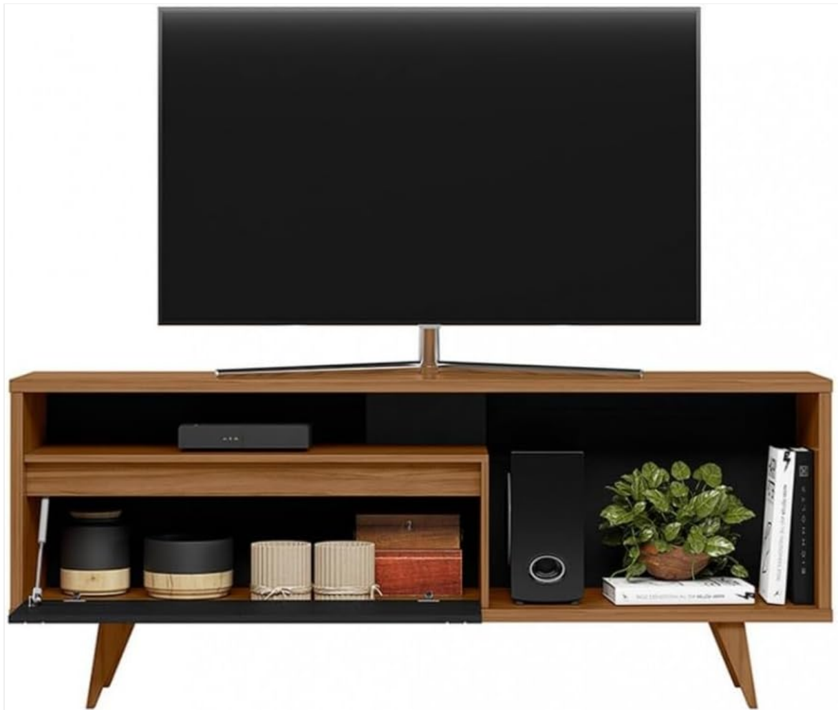
Figure 4: The TV rack with its gas piston door open, showcasing the internal storage capacity for various items.