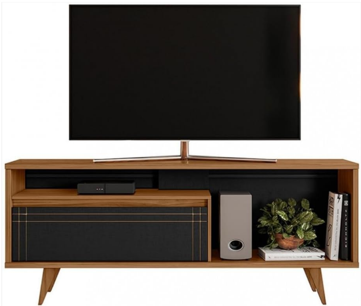
Figure 3: The TV rack with a television placed on top and various media devices and decorative items in the compartments.