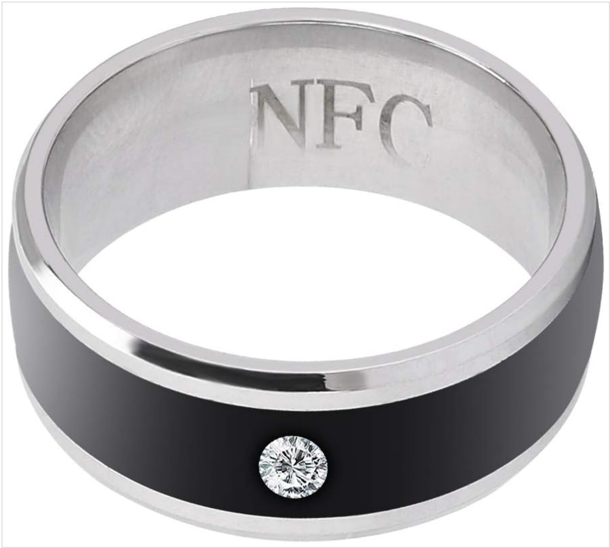
Figure 4: Using the smart ring to unlock a phone application