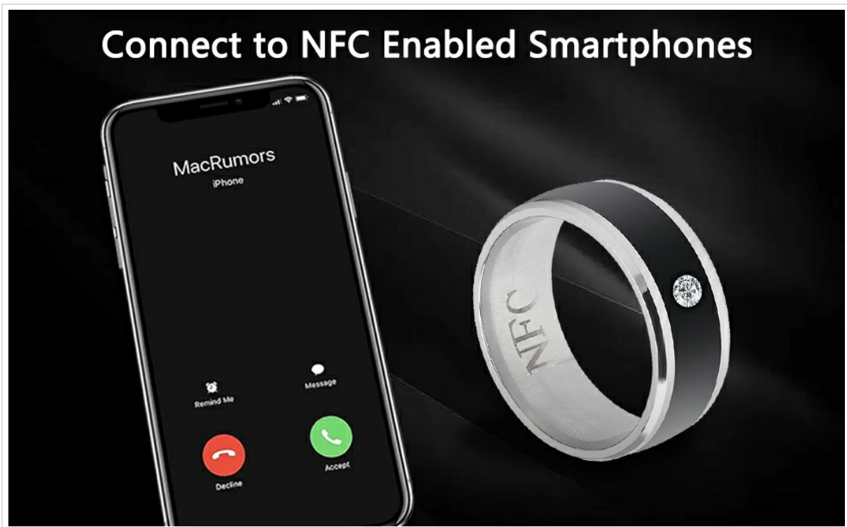
Figure 3: Connecting to NFC-enabled smartphones