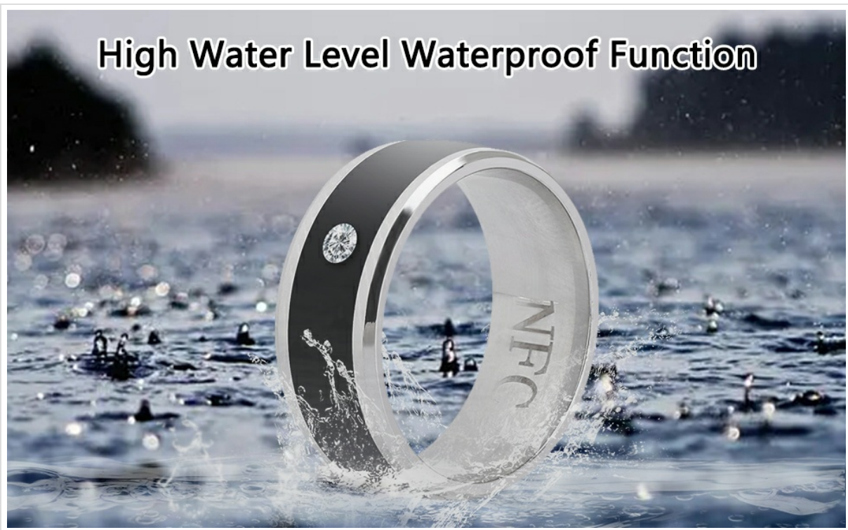
Figure 5: Smart Ring demonstrating water resistance