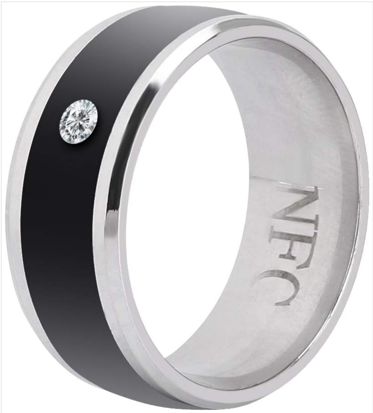
Figure 1: Wendry NFC Smart Ring (Model WN-SR01)