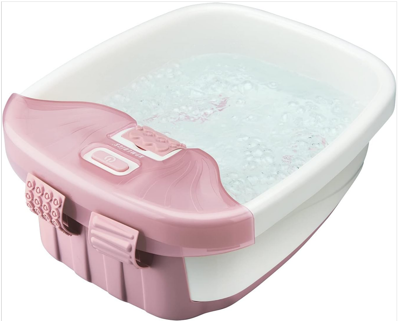
Image: The HoMedics Bubble Bliss Deluxe Foot Spa, filled with water and generating bubbles, showcasing its design and function.