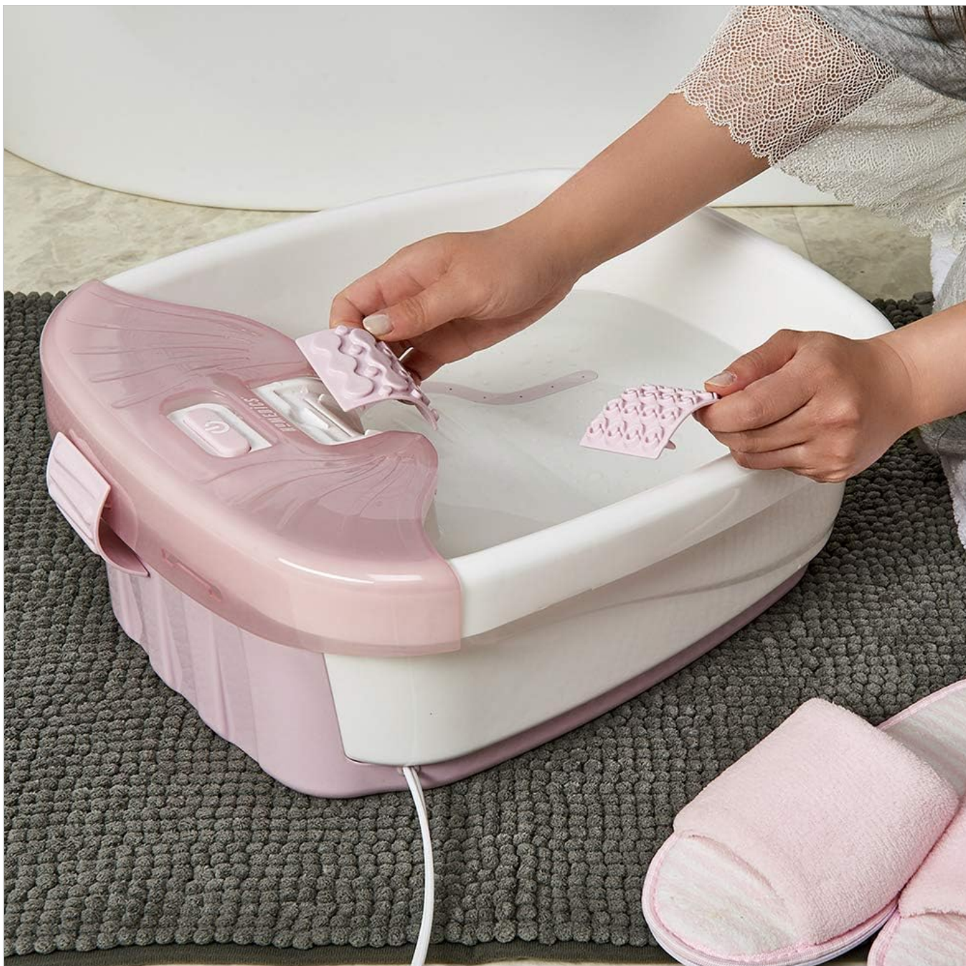
Image: Hands are shown carefully placing one of the massage attachments into the designated slot on the foot spa.