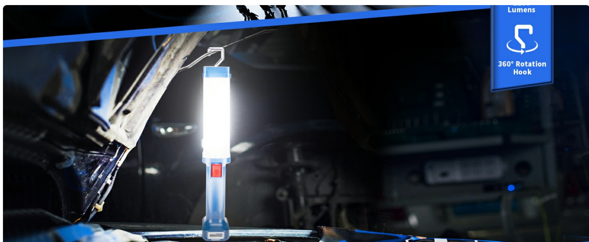
Figure 5: The 360° rotating hook allows the light to be hung for overhead illumination.

Extend the integrated hook from the top of the light to hang it from tents, pipes, or other suitable structures. The 360° rotation allows for precise light positioning.