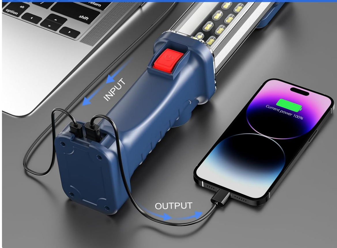
Figure 1: Key components of the WARSUN zj889-led Work Light, including the LED lamp, power switch, strong magnet, non-slip handle, and charging input/output ports.