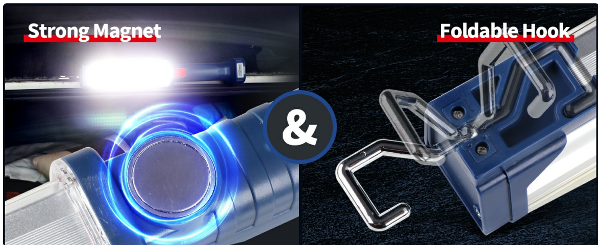
Figure 4: The strong magnetic base provides secure attachment to metal surfaces.

The strong magnetic base allows for hands-free operation by attaching the light to any ferrous metal surface. This is ideal for working under car hoods, on metal shelving, or other metallic work areas.