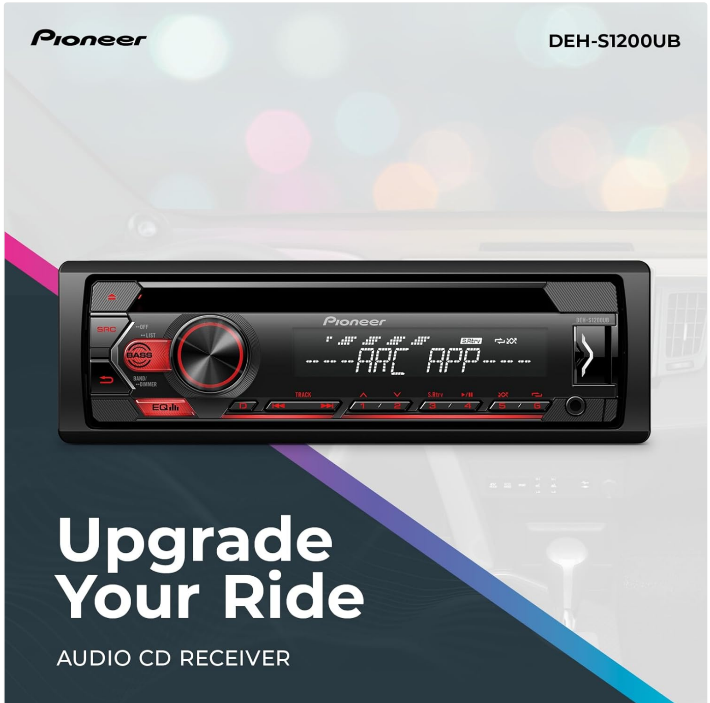
Figure 5: The Pioneer DEH-S1200UB is an audio CD receiver designed to upgrade your in-car audio experience.

The unit features Advanced Sound Retriever technology to enhance compressed audio files.