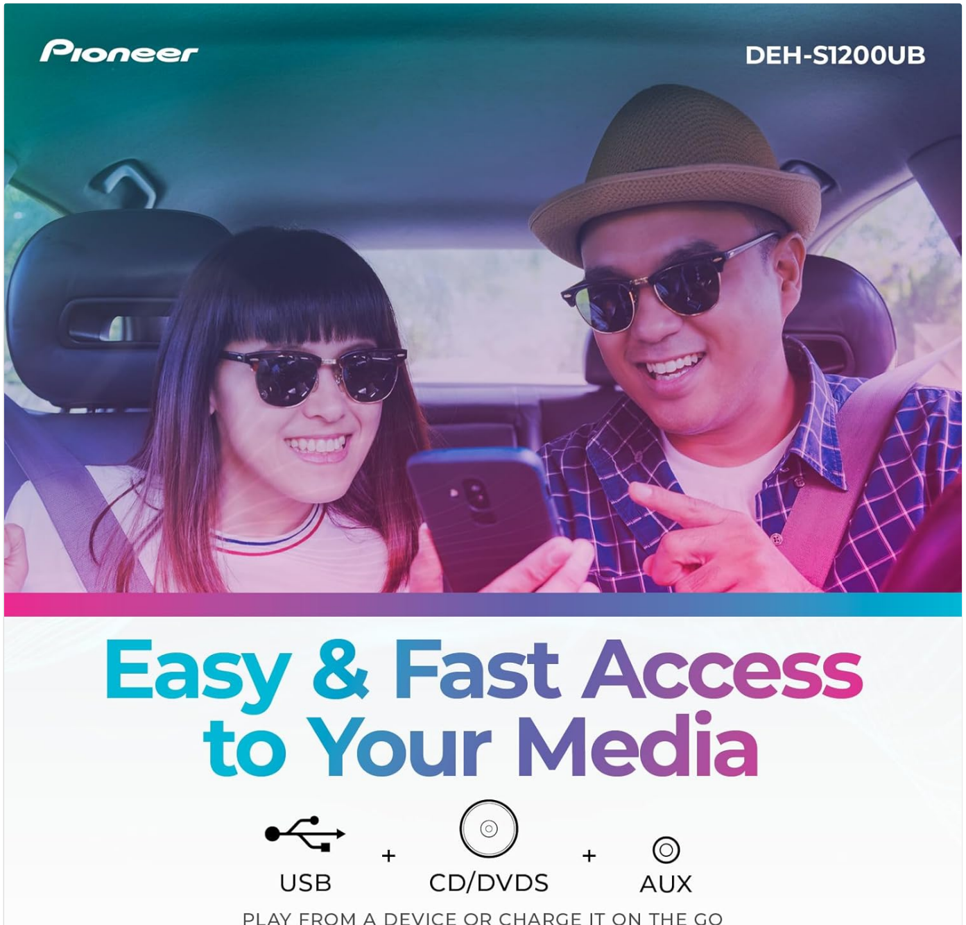
Figure 3: The DEH-S1200UB offers easy and fast access to media via USB, CD/DVDs, and AUX inputs.

The DEH-S1200UB supports CD, USB, and AUX playback. It is compatible with FLAC, MP3, WAV, WMA, and AAC audio formats.