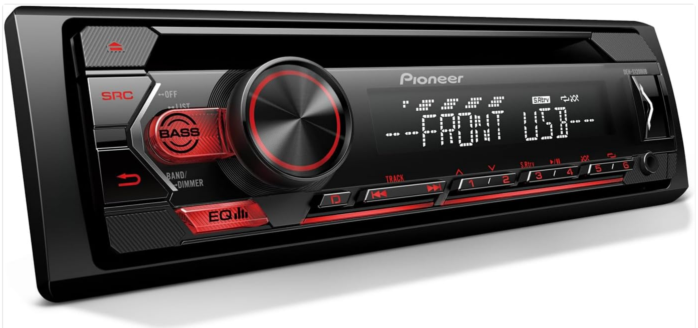
Figure 2: Front panel of the Pioneer DEH-S1200UB, showing main controls.