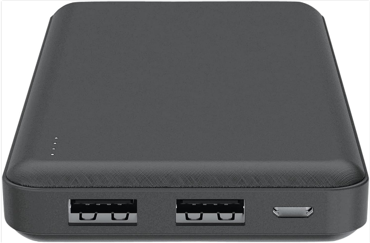
Image: Top view of the Celly PBE10000BK Power Bank, showing the two USB-A output ports, the micro USB input port, and the LED indicators.