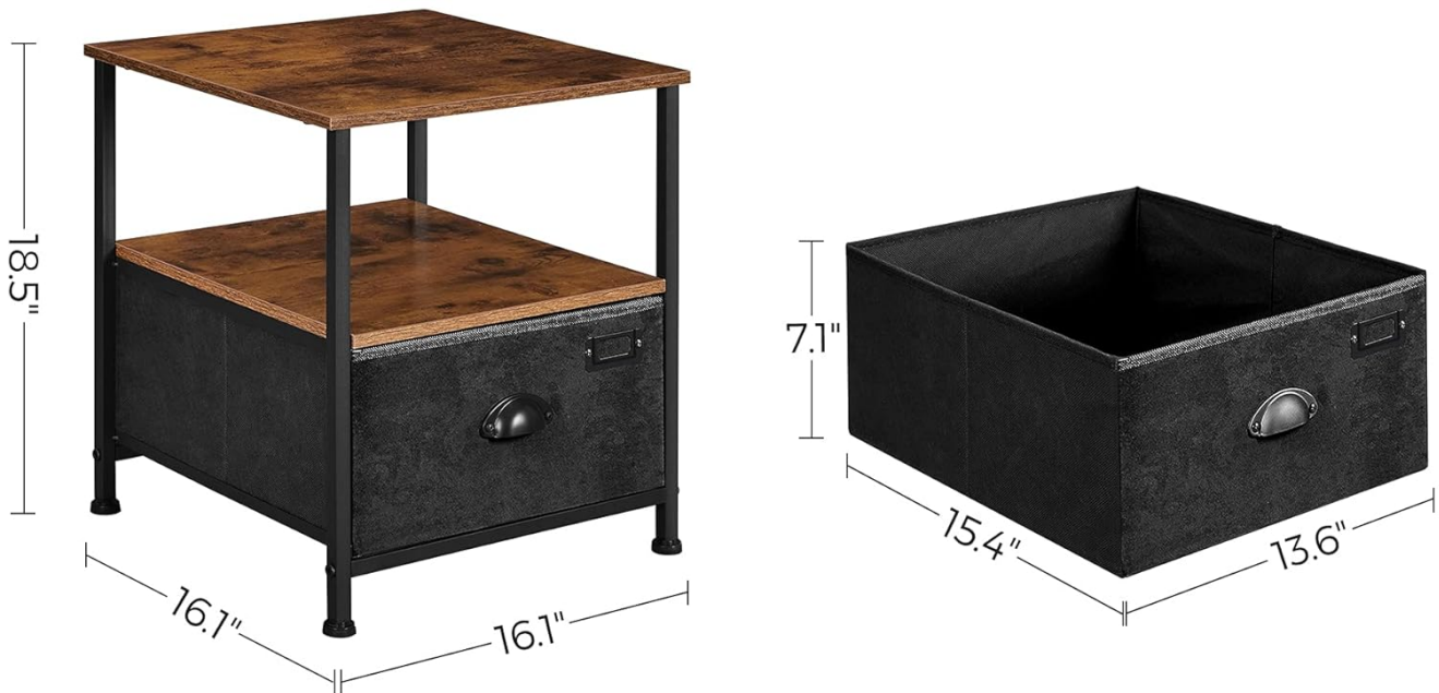
Image 5: A diagram illustrating the precise dimensions of the nightstand and its fabric drawer for accurate placement and planning.