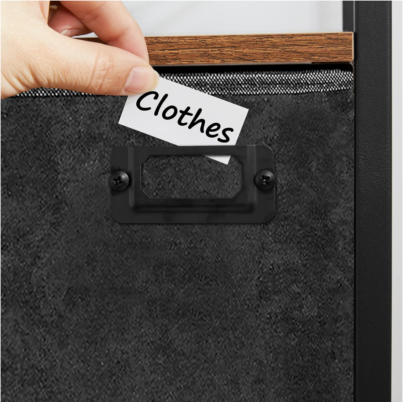
Image 2: A close-up view of the fabric drawer, highlighting the metal cup pull handle and the label frame for organizing contents.