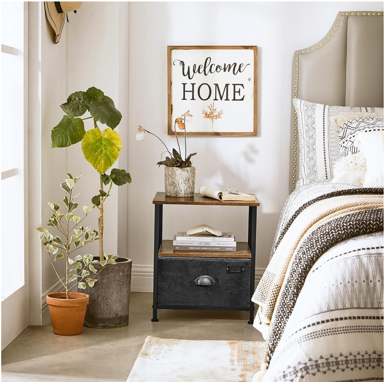
Image 1: The SONGMICS ULVT02H Nightstand positioned beside a bed, showcasing its rustic brown and black design with a fabric drawer.