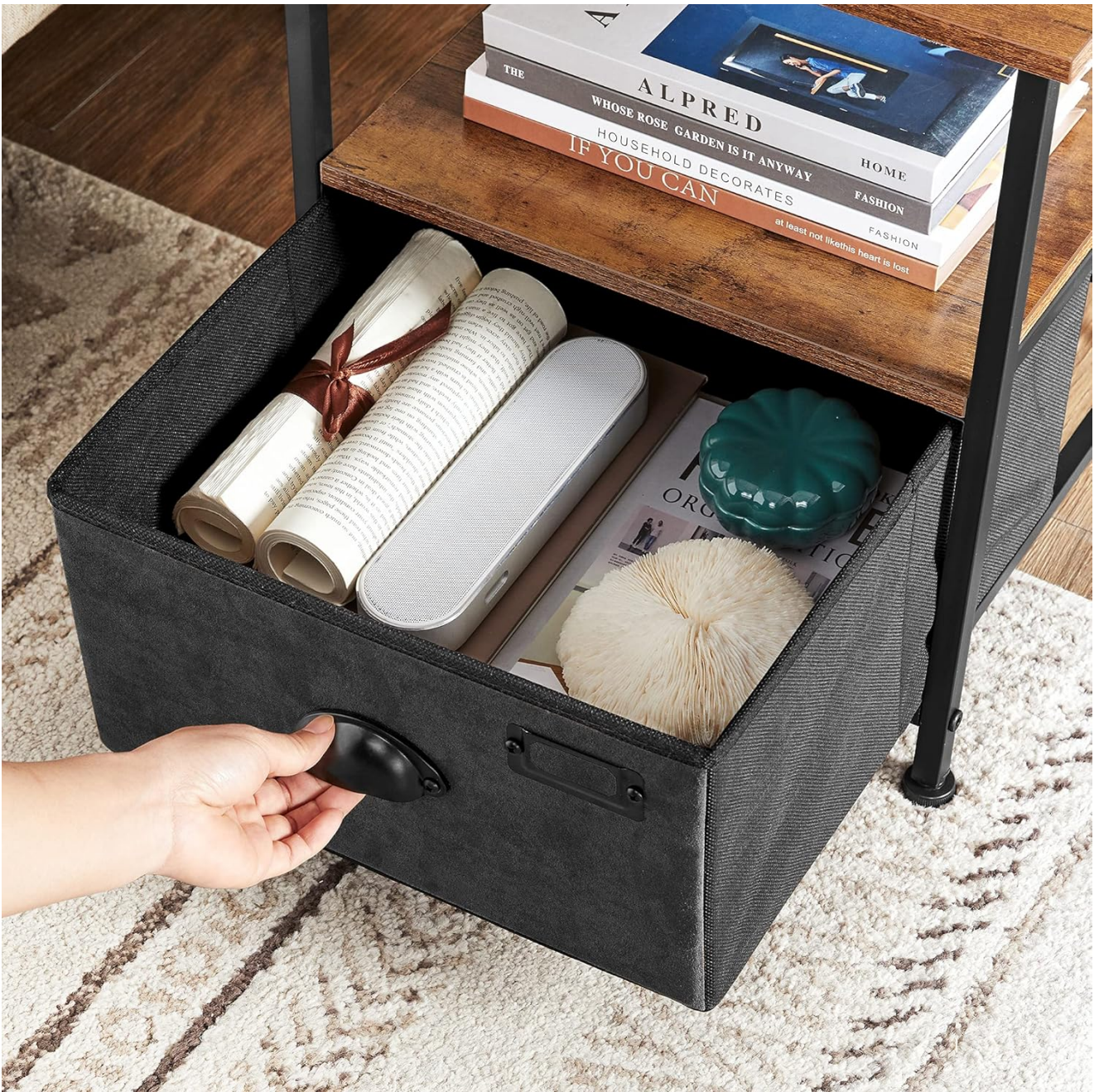
Image 3: The fabric drawer pulled open, revealing ample space for storing items such as rolled documents, a speaker, and decorative objects.