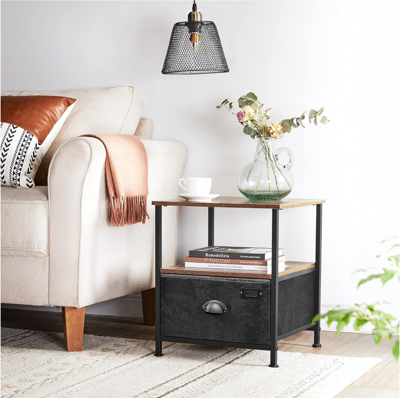
Image 6: The nightstand serving as a stylish side table in a living room, holding books and a vase, demonstrating its versatility.