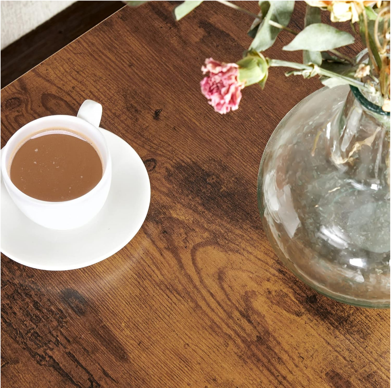
Image 7: A close-up of the rustic brown wooden tabletop, showing its texture and finish, suitable for holding a coffee cup or small decor.