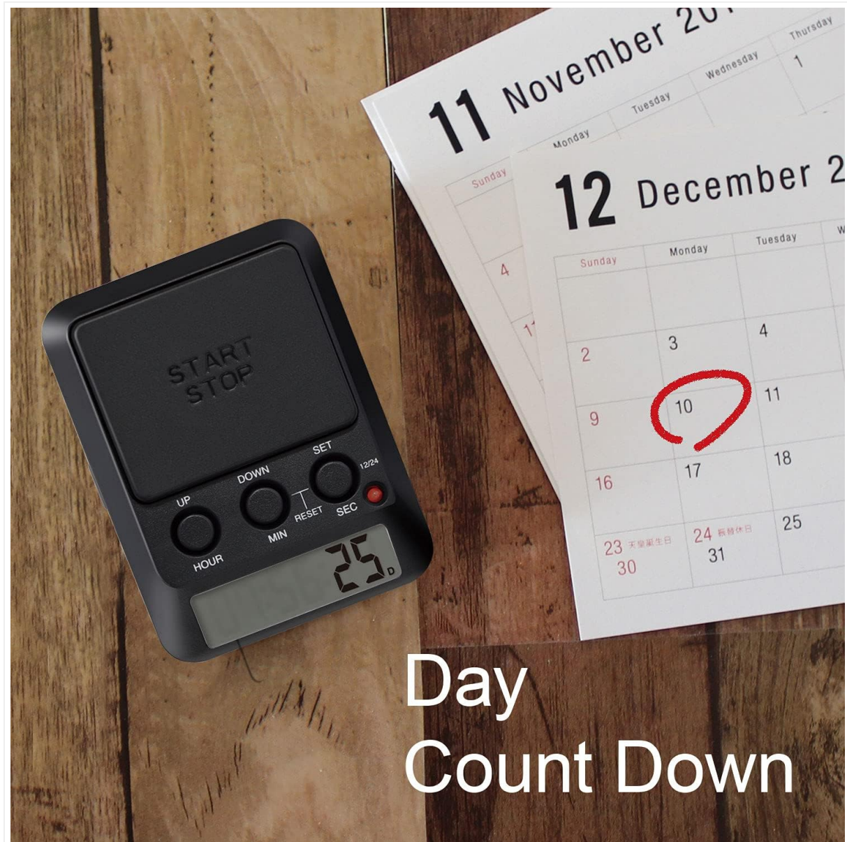
Figure 4: The Day Count Down feature helps track days until a target date.

Track the number of days remaining until an important event.