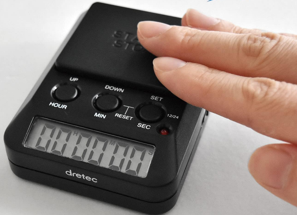
Figure 3: The large START/STOP button for easy operation.