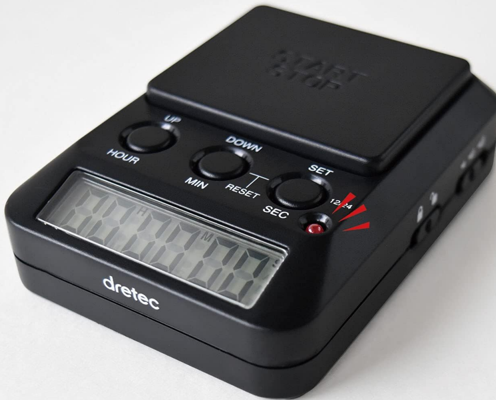
Figure 5: The timer provides both lamp and alarm notifications.