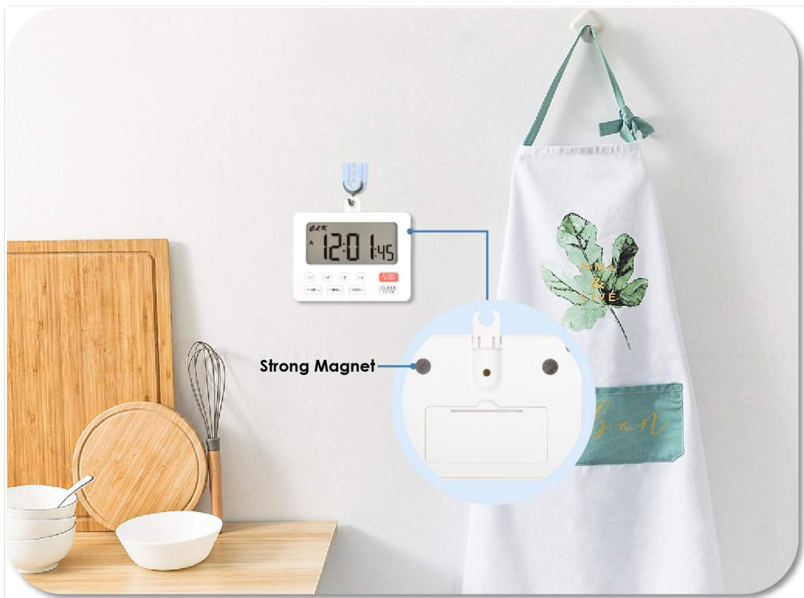
Jayron Desktop Digital Countdown Timer mounted on a kitchen wall, demonstrating magnetic and hanging hole placement options.