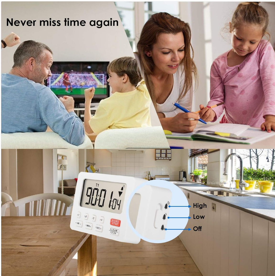
Jayron Desktop Digital Countdown Timer showing alarm volume settings (High, Low, Off).