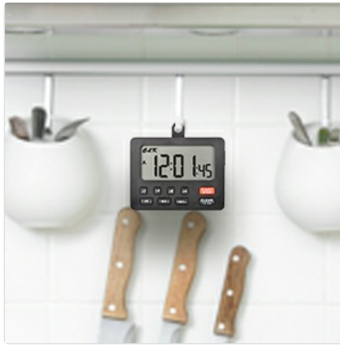
Jayron Desktop Digital Countdown Timer showing multiple placement options including magnetic and hanging.