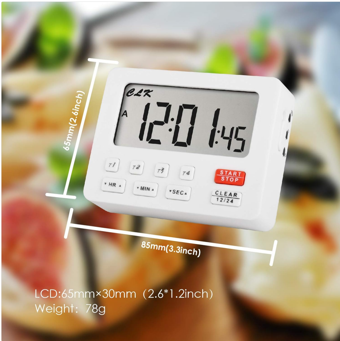
Jayron Desktop Digital Countdown Timer with dimensions: 65mm (2.6 inch) height, 85mm (3.3 inch) width, and 78g weight.