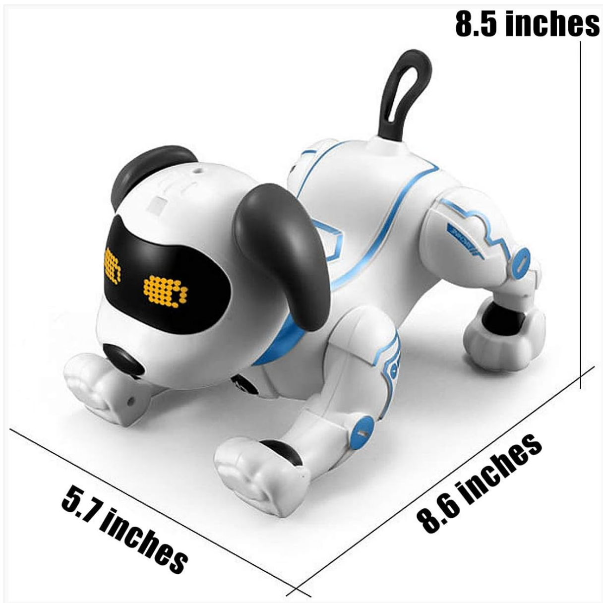
Figure 5: Product dimensions of the robotic dog.