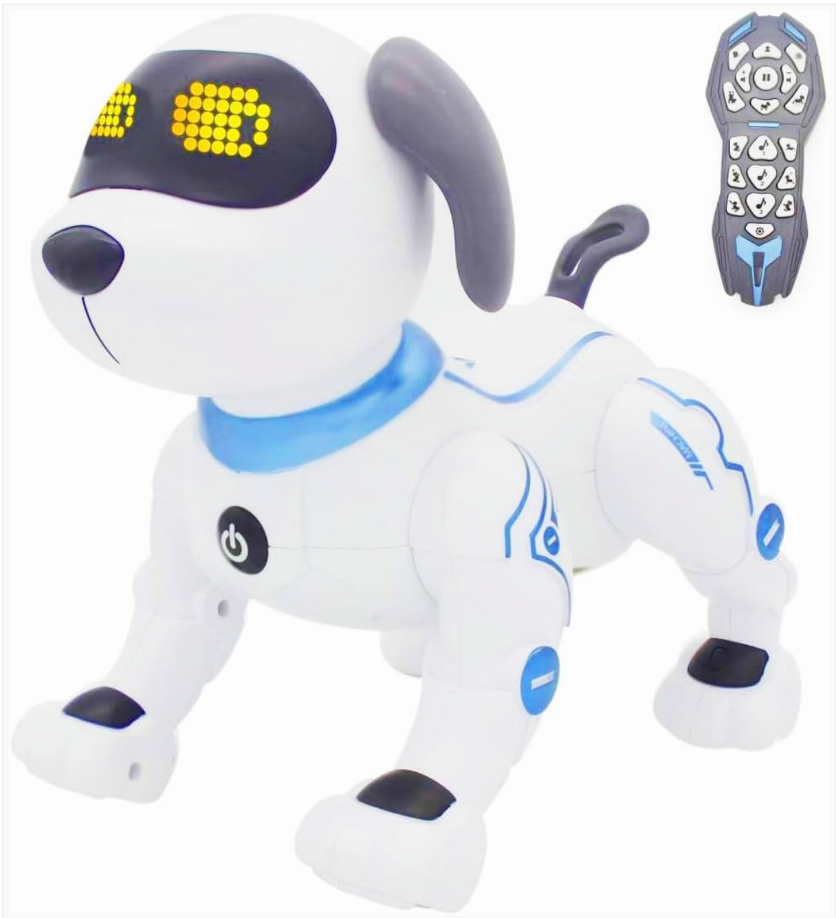
Figure 3: The robotic dog and its remote control.