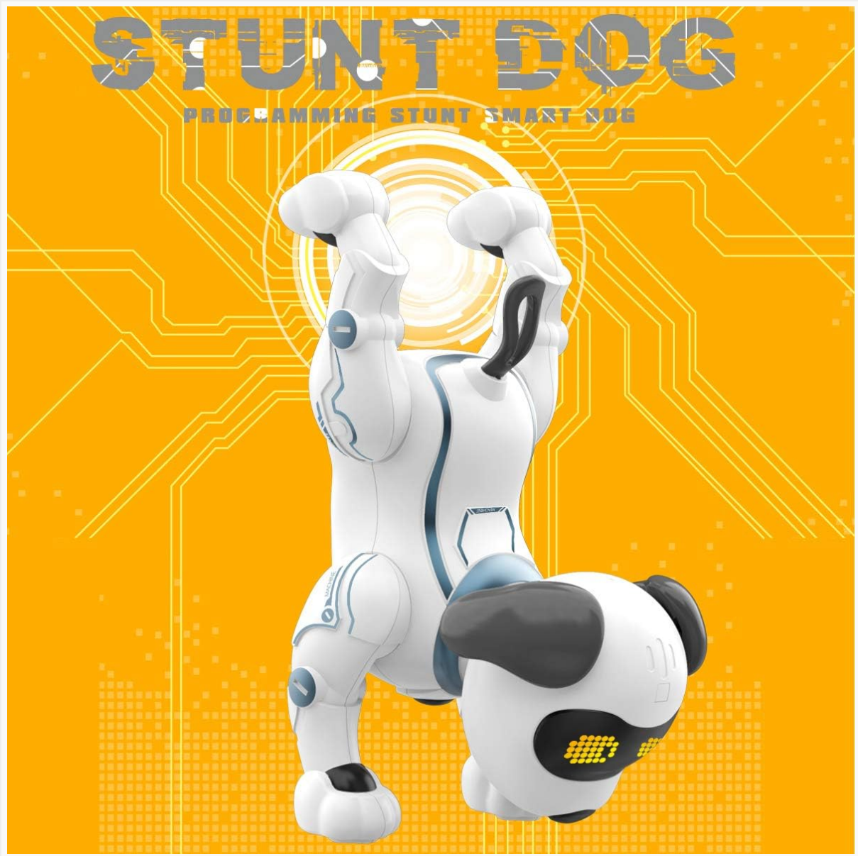
Figure 1: Fisca RC Robotic Stunt Dog.