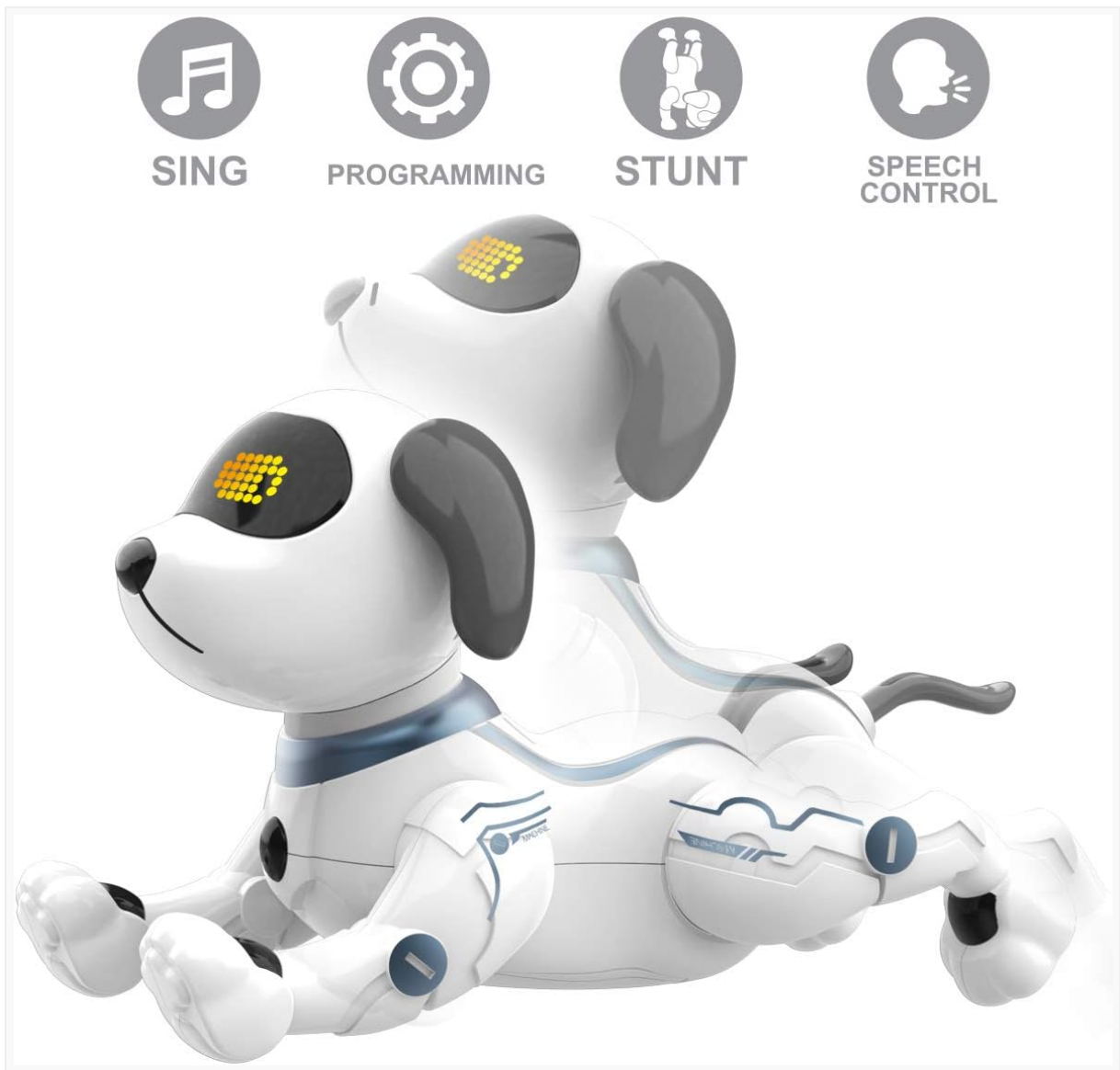
Figure 2: Key features of the robotic dog including singing, programming, stunts, and speech control.