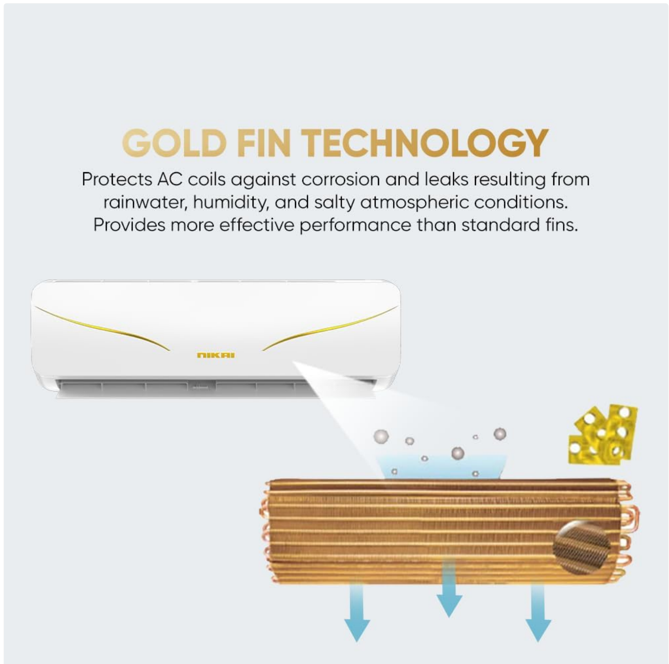
Figure 6.1: Gold Fin Technology protects the coils, but regular cleaning is still necessary.

It is recommended to have your air conditioner professionally serviced at least once a year to check refrigerant levels, clean coils, and inspect electrical components.