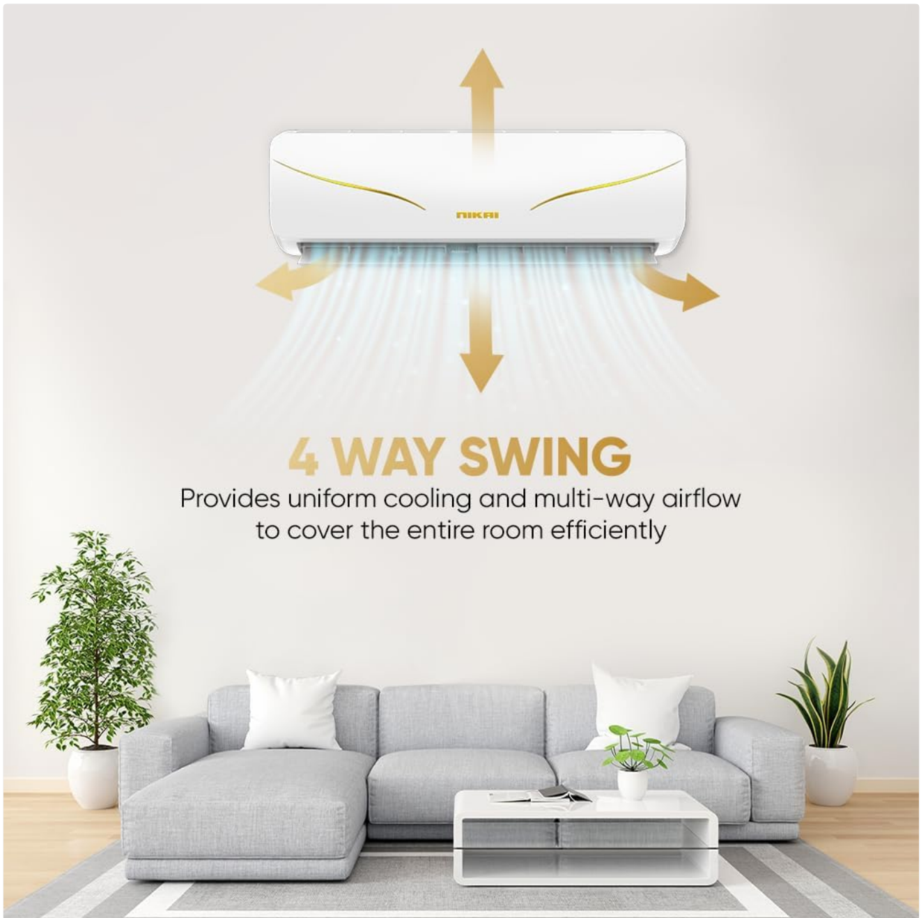
Figure 5.1: The 4-way swing feature ensures comprehensive air distribution.